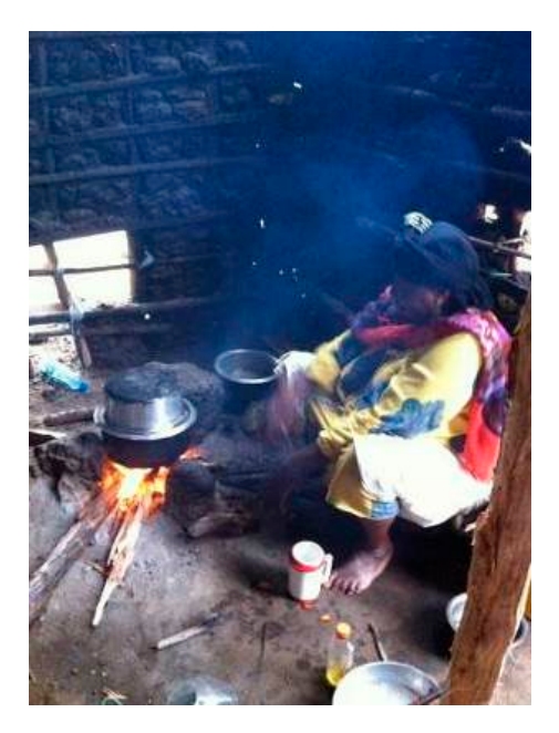
Figure 4. Three-stone open fire in use at Kwale, Kenya.

About 98% of the households reported using a three-stone open fire or other type of stove before the introduction of the gasifier (Figure 4) [23]. The most common combination was a three-stone open fire and a charcoal stove, practised by 22% of households. The three-stone open fire was reported by users to emit more smoke than the gasifier.