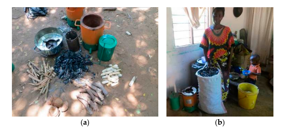
Figure 6. (a) Biomass from the farm ready for use in the gasifier and (b) the charcoal produced.

The survey showed that 26% of households bought some or most of the firewood they used, with 85% of them buying headloads and 15% handcart loads. These households bought firewood 1 to 10 times per month. A headload of firewood cost 50 KES (0.5 USD) on average. There was a significant difference (p = 0.003) in the number of headloads of firewood used before and after gasifier by the 26% of households that bought firewood and a 38% decrease (400 KES (4 USD) to 250 KES (2.5 USD)) in the amount of money spent on fuel after the gasifier was introduced. The gasifier can use fuel materials from tree pruning and crop residues, which are accessible on-farm (Figure 6a), hence reducing the need to buy firewood, which could constrain the household budget [32].