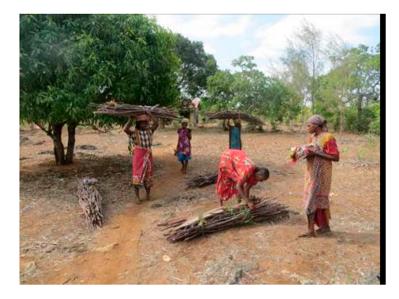
Figure 5. Women at Kwale, Kenya carrying headloads of firewood from a private plantation.