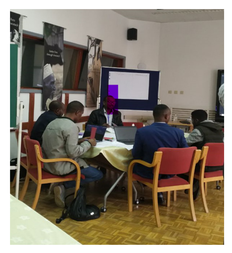
Photo 3: Plenary discussions at the end of the three rounds of conversations to harvest the ideas during the review workshop at ILRI Addis campus, Addis Ababa, Ethiopia (photo credit: ILRI/Lina Gazu).

Photo 2: Conversation during the review workshop at the ILRI Addis campus, Addis Ababa, Ethiopia (photo credit: ILRI/Lina Gazu).