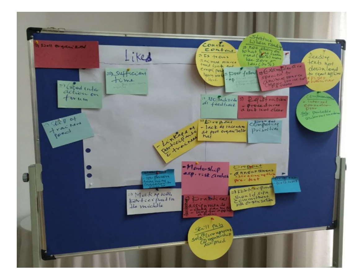
Photo I. Findings of the conversations during the review workshop on course design, contents, materials and communications.