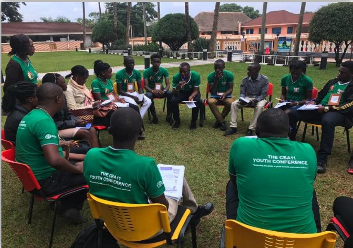
Group participants discuss the role of youth in agriculture.

The Dragon's Den provided representatives with an opportunity and real-time practice of mobilization, advocacy and presentation of ideas and solutions, through which they can get involved in solution development and implementation of strategies. It was focussed on the question: What adaptation strategy or solution can be supported or implemented to support the youth in agriculture?