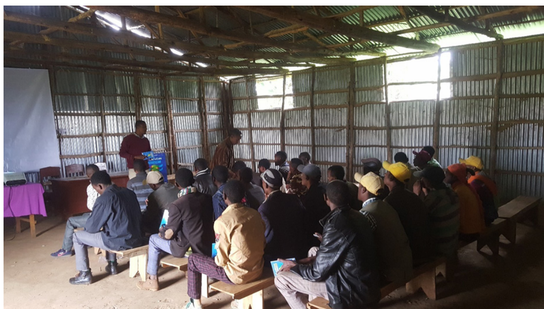
Figure 4. The picture from training of farmers in Adiyo district on preventing and control of respiratory diseases.

In the trainings the farmers learned about the causes, clinical signs, transmission, predisposing factors, control and prevention of respiratory diseases of small ruminants; and they discussed seasonal calendars for