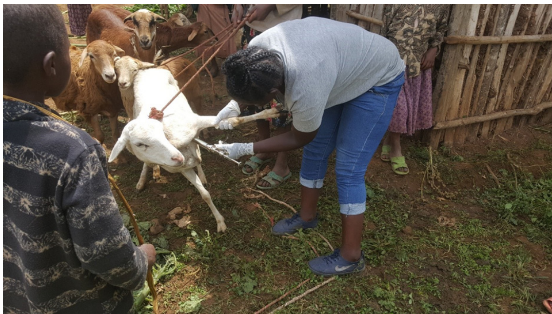
Figure 3. Animal health assistant vaccinating sheep against ovine pasteurellosis.