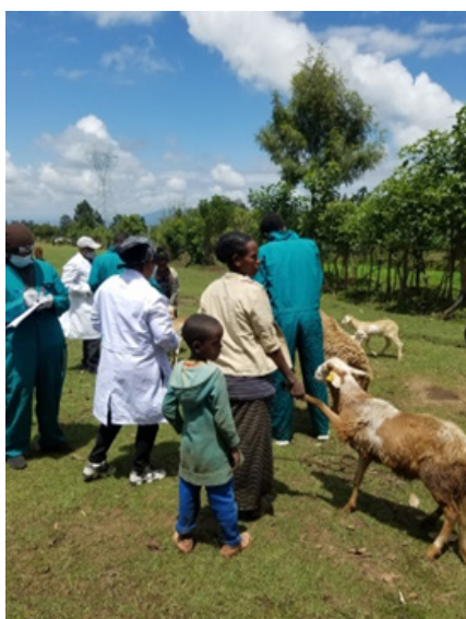
Figure 5. Deworming, sample and data collection.

Since parasite control needs community action, the community conversation module on gastro-intestinal parasite control was developed. Community conversation is a participatory training and extension approach adopted for herd health interventions. On the other hand, for the follow up of the effectiveness of deworming programs, the pre and post deworming fecal samples were collected from the sites. A total of 1,928 and 735 fecal samples were collected pre and post deworming through 2018–2021 and analysed.