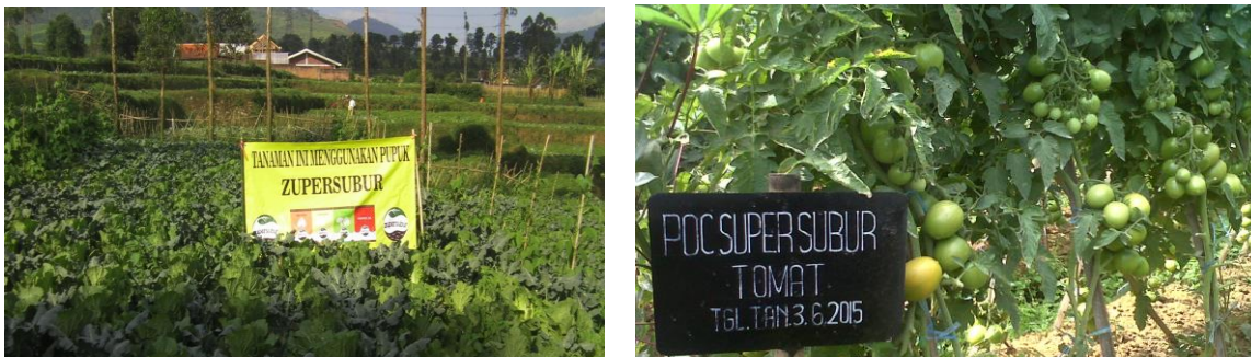
Figure 5a. Cow waste was converted and used as organic fertilizer; Figure 5b. Organic fertilizer resulted in higher production of tomato.

Often farmers dispose cow waste directly into the environment without treatment. Processing cow waste into fertilizer and animal feed can reduce health risks and provide an economic benefit. Trials for a new series of interventions have been carried out in a number of sites in Pangalengan and outside Pangalengan, involving the processing of waste, the use of processed cow waste to improve crop yields, and the use of animal herbal feed supplement. Early results of these trials were extremely promising with higher yields in some treatments, for example, lower chicken feed conversion ratio, and higher milk production in cow. However, challenges include applying appropriate technology and raw materials preparation.