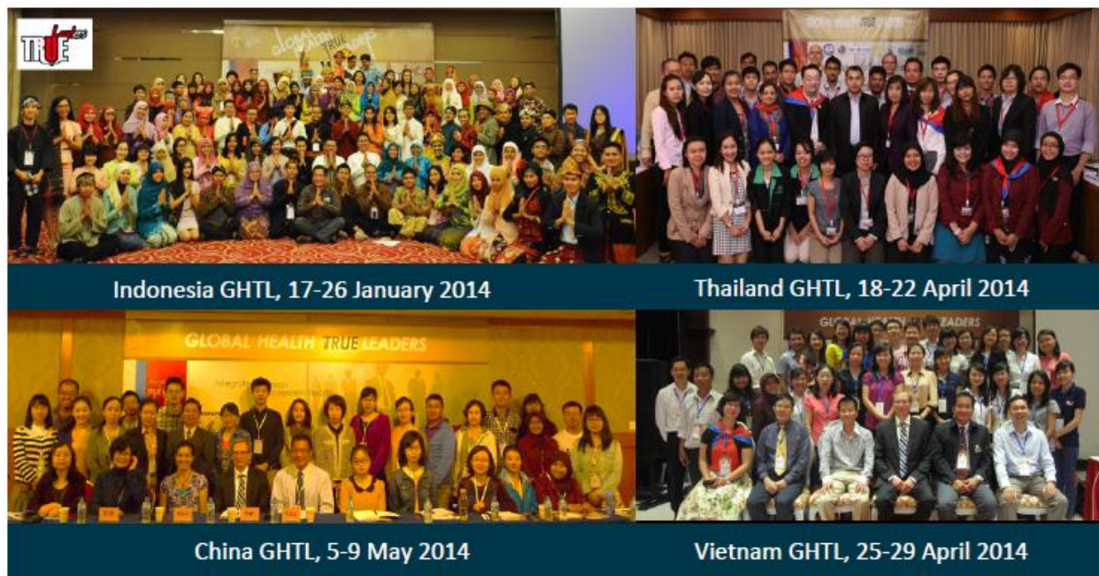
Figure 8. Cohort of Global Health True Leaders participants (Global Health True Leaders Series, 2014)

The seed funding grants were used to give funding for 24 small Ecohealth projects proposed by alumni of GHTL 2014. Awardees organized workshops, research, and community empowerment in priority areas to address local health challenge in their community.