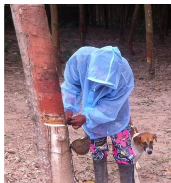
Figure 6a. Engagement of migrant workers by research team; 6b. Reducing risk of vector-borne diseases in a rubber worker using a repellent-impregnated jacket.