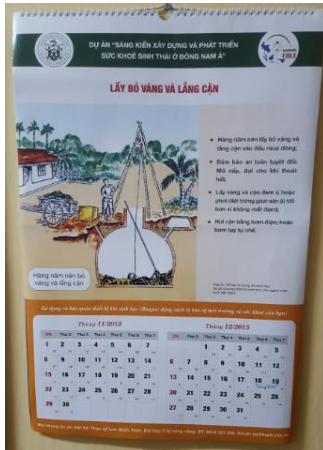
Figure 7. Health promotion messaging in a calendar