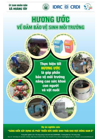
Figure 8. Health promotion messaging in traditional village regulation document