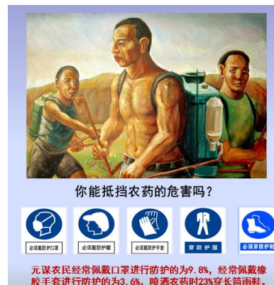
Figure 4. Health promotion poster