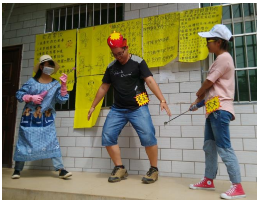
Figure 3. Street theatre performance