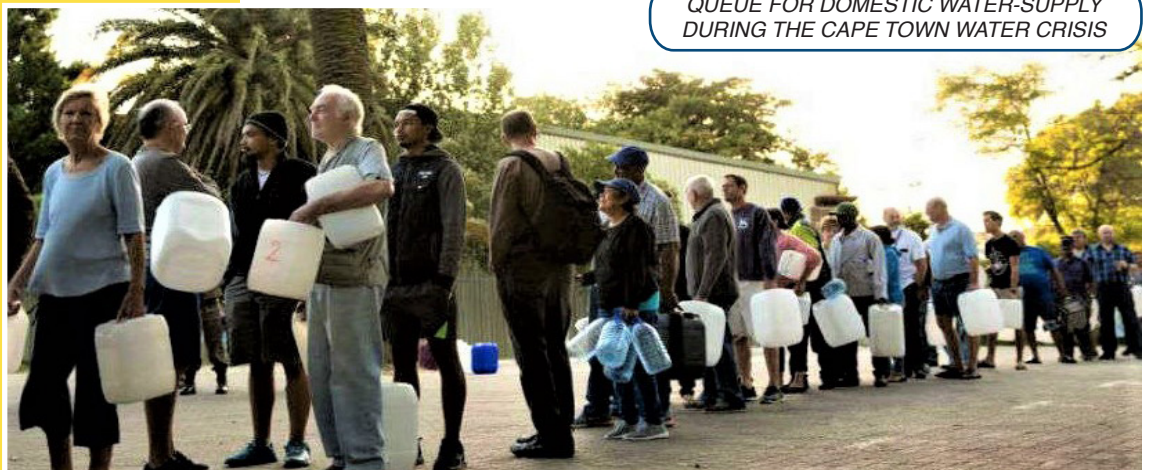
QUEUE FOR DOMESTIC WATER-SUPPLY DURING THE CAPE TOWN WATER CRISIS