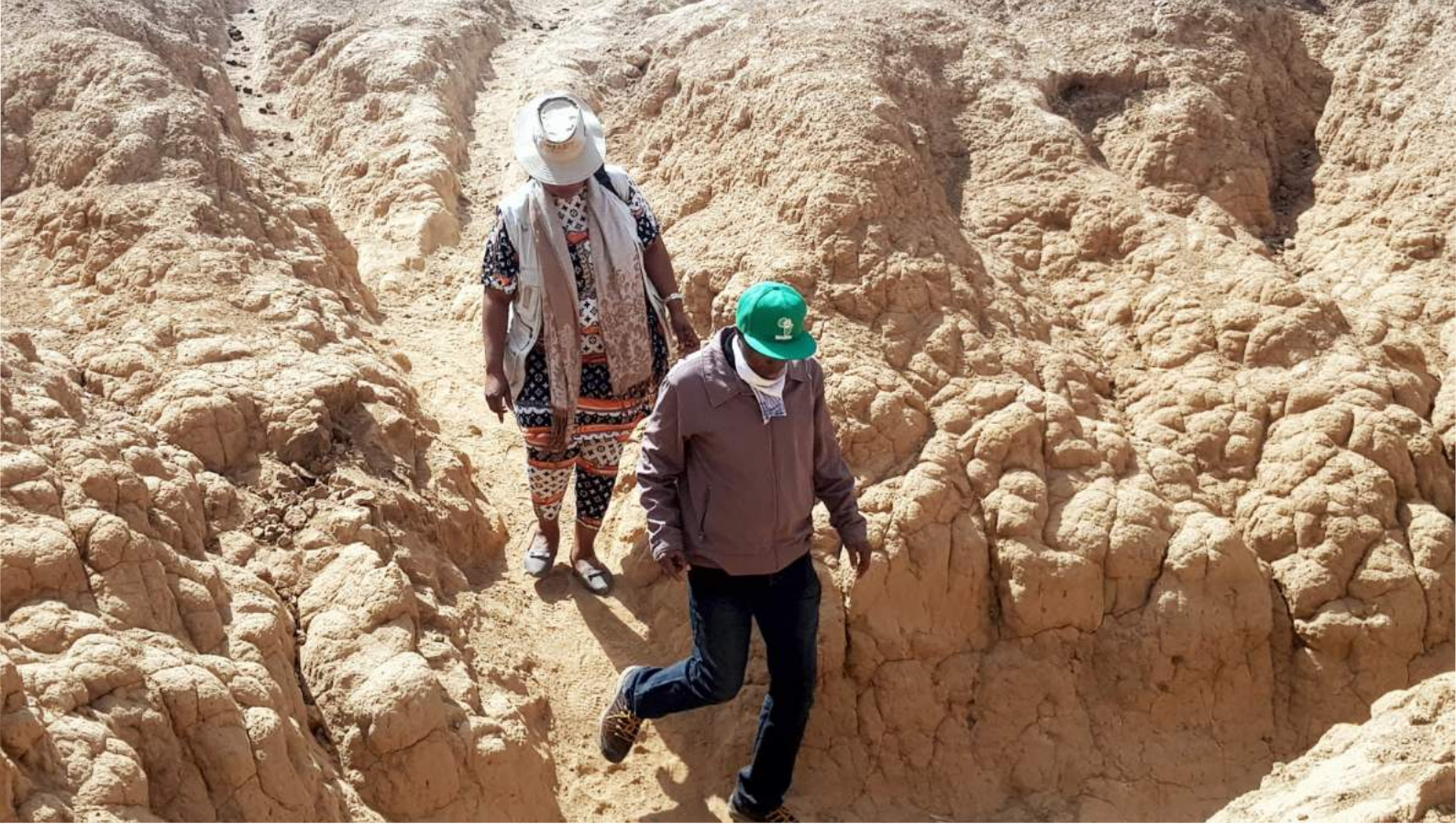
The Livestock Coordinator and the TAAT M&E Specialist on their way to the soil conservation site