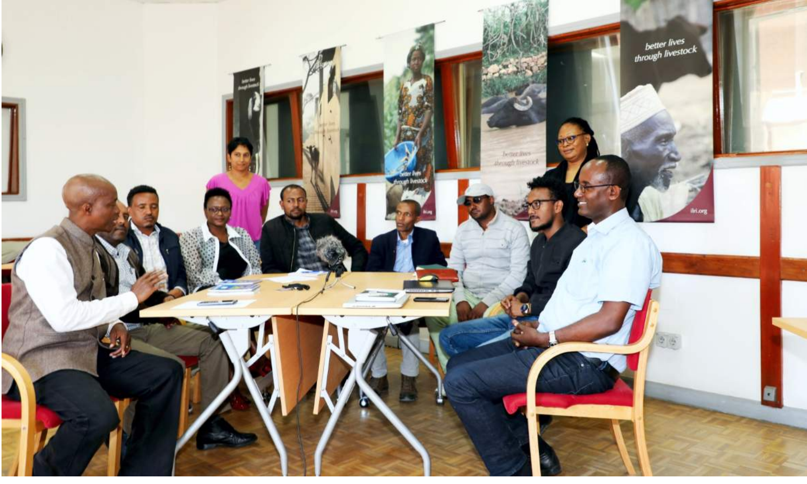
Focus Group Discussion with ICARDA and Menz field site implementing partners in Addis-Ababa