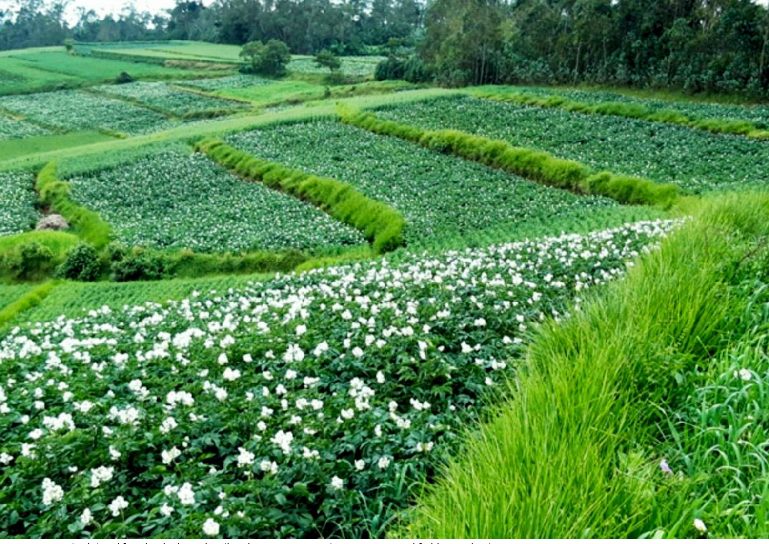
Reclaimed farmlands through soil and water conservation structures and fodder production.

In Kedida Gamela woreda at Kembata zone, the FGD was held with group of community members engaged in integrated SWCS and FD project. The community members indicated that they have been building anti-erosive structures on the hills through the Government scheme to protect the area from gullies. However, all the efforts made to protect gullies did not work and they lost their farm and grazing lands. With the TAAT Livestock Compact in partnership with Inter Aid, the innovation to work on farmlands and not on the gradients was very exciting. The elderly people indicated, at the beginning of the project, they were reluctant to embark upon anti-erosive structures on lowlands for the risk of losing large portions of their farmlands. However, the project demonstrated that it is possible to fight erosion from the valleys, enhance fertility and degraded land and production of forage all over the year.