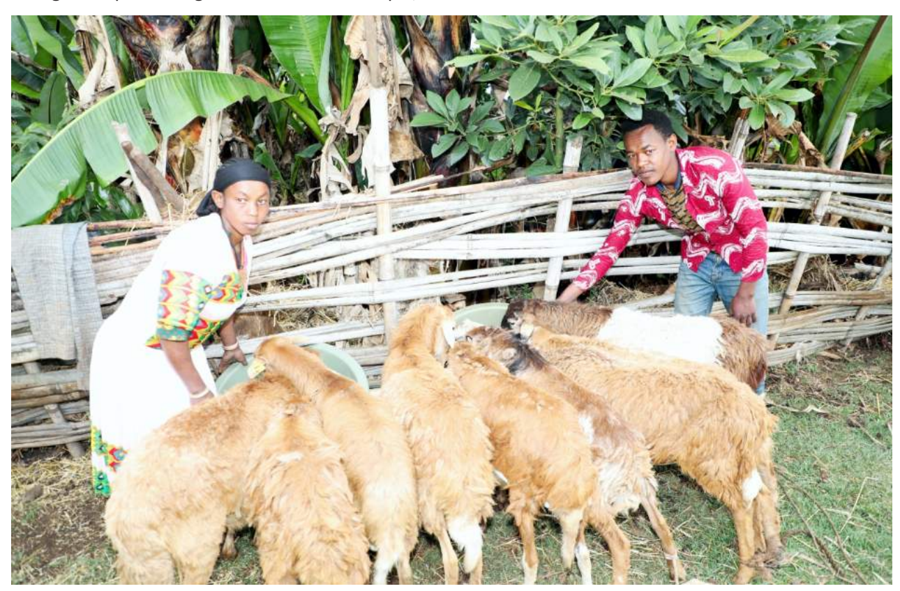
Best performing beneficiary with 8 rams and his mother

In addition to the challenges in the private sector, marketing patterns have changed for the past five years and have influenced consumption patterns. Five years ago, a fattened sheep was sold at 2,600ETB (USD80.7). Today a fattened sheep through the program is sold at 6,000ETB (USD186)