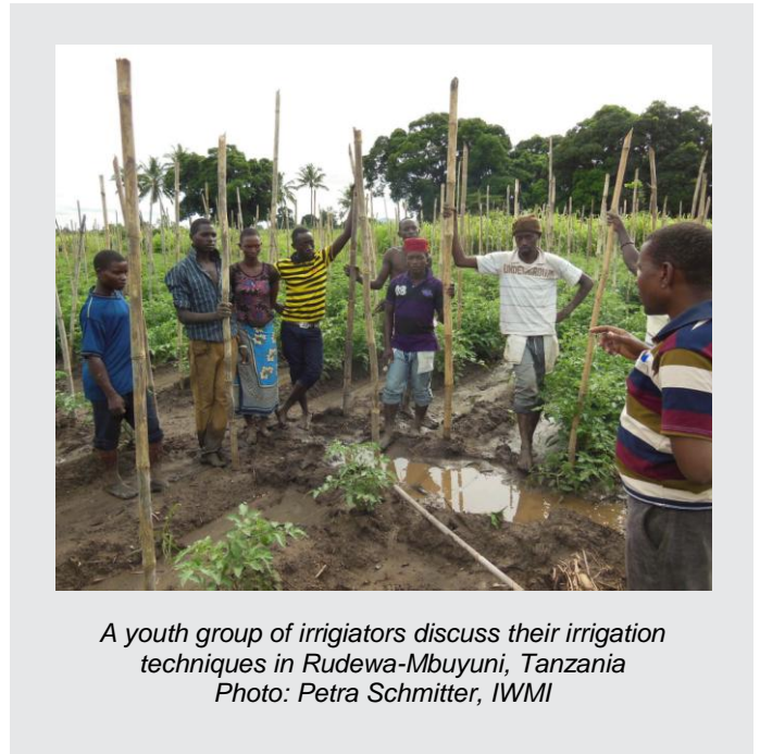
A youth group of irrigators discuss their irrigation techniques in Rudewa-Mbuyuni, Tanzania

The aim of ILSSI is to identify ways of creating opportunities for farmers and other actors across scales. Researchers, with farmers and extension workers, are piloting systems to improve water lifting, conveyance and field distribution. They are also examining mechanisms to improve access to small scale irrigation technologies for both women and men. The project considers scaling technologies and practices with a focus on both the market and environmental sustainability.