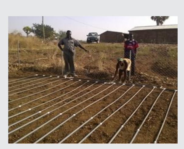
Farmers installing a drip kit designed by the University for Development Studies, Ghana.

The aim of ILSSI is to identify ways of creating opportunities for farmers and other actors across scales. Researchers, with farmers and extension workers, are piloting systems to improve water lifting, conveyance and field distribution. They are also examining mechanisms to improve access to small scale irrigation technologies for both women and men. The project considers scaling technologies and practices with a focus on both the market and environmental sustainability.