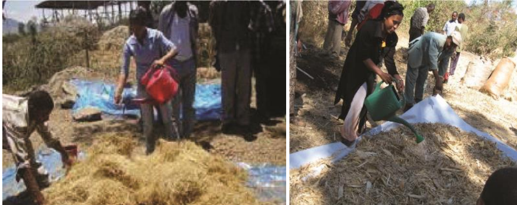
Photo: Spraying the urea molasses solution on straw (left) and chopped stover (right) spread on a plastic sheet. (Photo credit: ILRI)

Dissolving urea in water using small container (left) and mixing the dissolved urea, molasses in a larger container and stirring to mix it properly (right) (Photo credit: ILRI)