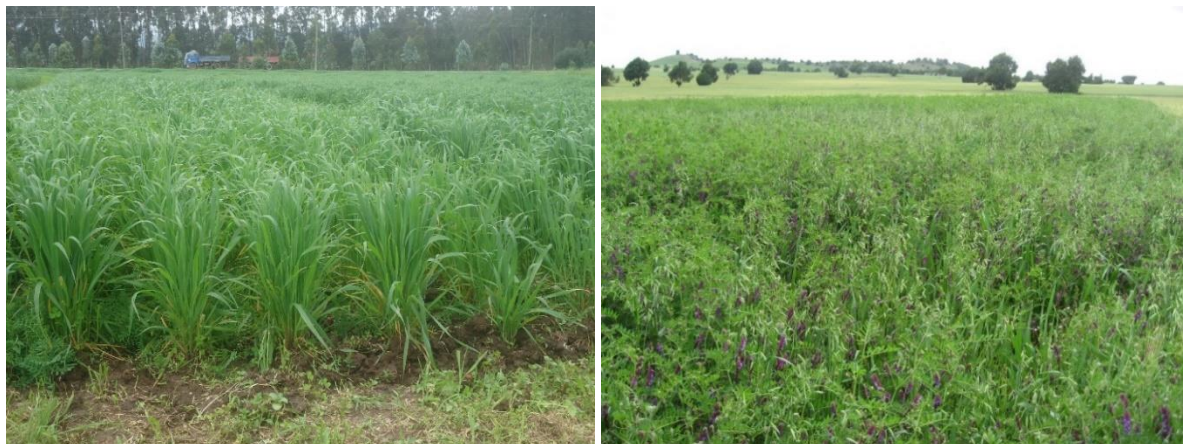
Oats and oat-vetch mixture forage

The grain yield of oat in Ethiopia varies over the different agro-ecologies and varieties, where grain yield is lower for forage varieties. Oats grown for seed production uses lower seeding rates and higher fertilizer levels. Seed yields on average ranges between 1 to 3.5 t/ha with average straw yields of about 5.5 t/ha. When people use oats for food dehulling with local mills is required. The hull generally accounts 25 -35% of the total grain weight and mostly used for animal feed.