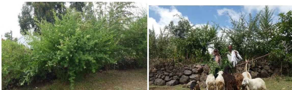
Tree Lucerne fodder tree

Tree lucerne flowers extensively and as a result it is an important bee fodder. Smallholders who keep beehives can benefit quite a lot from this tree. Tree lucerne bear a considerable amount seed and the seeds can also be used as good sources of poultry feed.