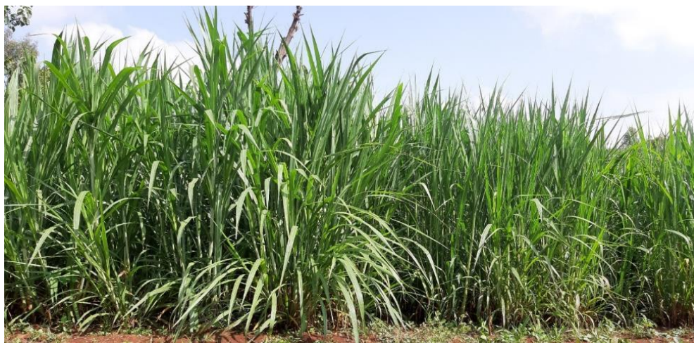
Napier grass plot

Though seeds could be produced and used for establishment, seeds of elephant grass is very rarely produced and used. The most common sources of planting materials are stem cuttings and root splits. Cuttings taken from the basal of moderately mature stems containing 3 nodes could be used for planting. The basal part should be buried with the nodes at slant (at 45°) position. Cuttings can also be planted horizontally into a furrow, to a depth of 5-10 cm. Normally planted in rows 0.5 m apart. Root splits most often used in cooler agro-ecologies. Cuttings could be handled with plastic bags could be transported and can be used for planting up to 2 week-time.