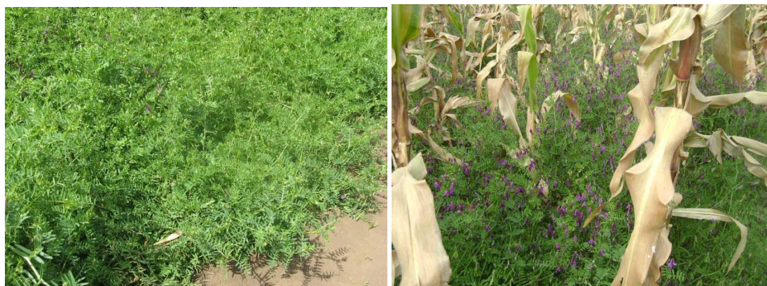
Vetch forage

Vetches are good seeders, but their indeterminate flowering and susceptibility to frost are the major bottle necks. Seed production from Vicia sativa and Vicia narbonensis is easier as they are early maturing and good seed producers. However, seed crops of Vicia villosa , dasycarpa and atropurpurea are late maturing varieties, has indeterminate growth of flowers, in this process frost occurs and damages usually at early pod stage. Therefore, vetch seed production should be done in frost free areas. In Ethiopia seed productivity ranges for V. villosa 7 to 23 qt/hq, V. dasycarpa 7 to 21, V. dasycarpa 5 to 20, V. sativa 8 to 27 and V. narbonensis 4 to 29 qt/ha. Forage seed productivity is affected by the level of management, soil and environmental situations.