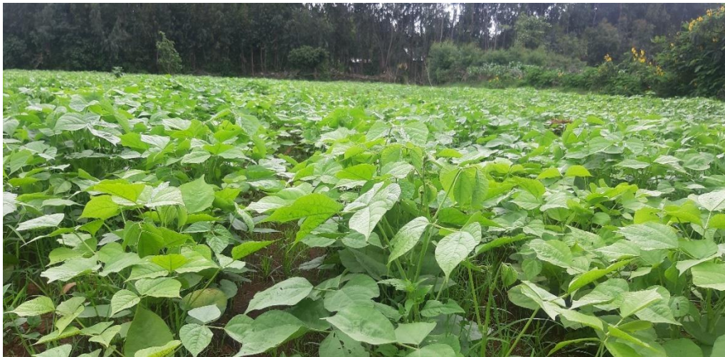
Lablab fodder plot

Seed productivity varies with the different varieties, production management and environment. But lablab is a very good seed producer on average 10 to 25 qt/ha. The seed are usually attacked by weevils and needs to be stored properly.