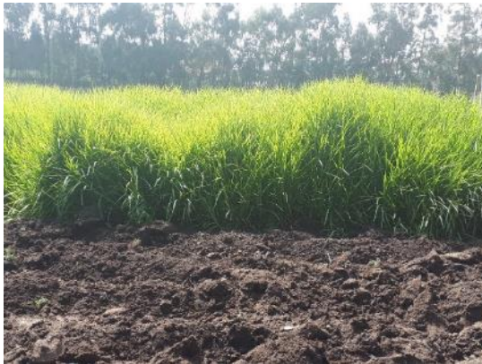
Desho grass

The grass rarely seeds and propagation is mainly through root splits.