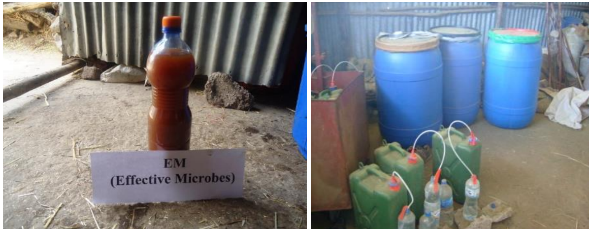
Effective microbes (EM) solution (left), processing EM1 solution to EM2 solution (right).