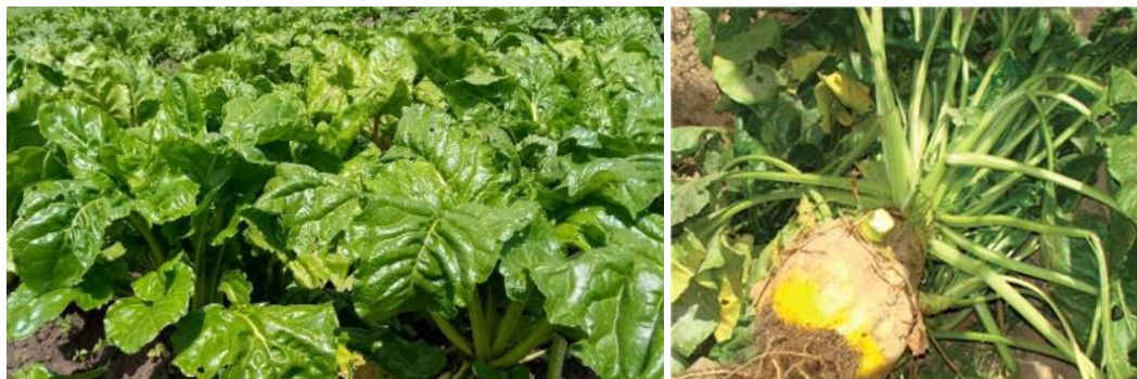
Fodder beet plant

Fodder beets flower and produce seeds in the second year after planting, though the root decreases in size. When the seeds of fodder beet are ready for harvest, they can be collected by stripping. Seed yield is about 400–500 kg/ha.