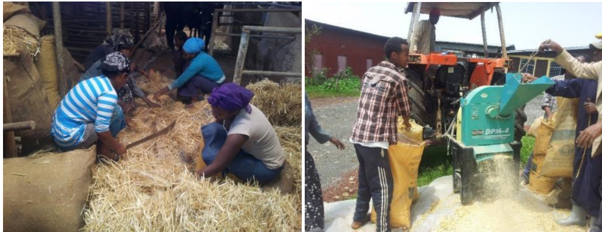
Chopping of crop residues with machete (left) and grinding and chopping using motorized choppers (right)

If facilities are available passing chopped and ground crop residues in pressurized steam could improve the digestibility and intake of crop residues.