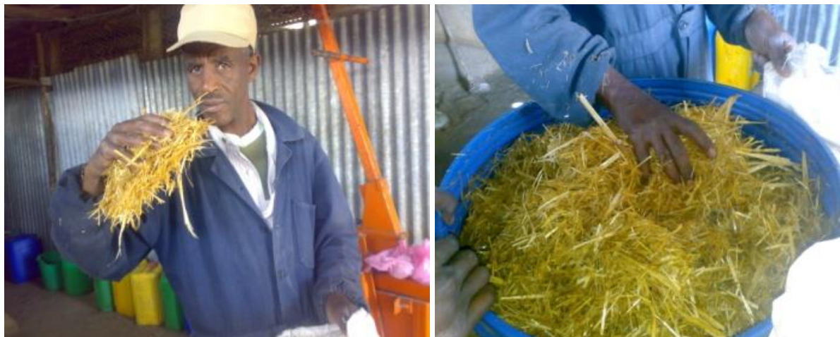
Crop residues treated with effective microbes (EM) smells very attractive and normal color (right).