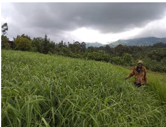
Brachiaria grass

Brachiaria is known to produces a quality seed in many places. However, country seed production in not widely practiced in Ethiopia due partly to the requirement of this grass for an extended day length to bear viable seeds. As a result, propagation is mainly done through root splits. In other countries, seed yields ranged between 400 to 4000 kg/ha. Fresh seeds are dormant up to 9 months. Prolonged storage or acid scarification breaks seed dormancy.