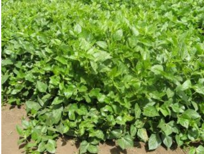
Cow pea forage