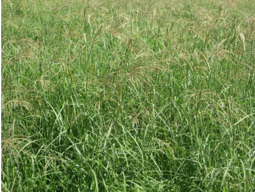
Rhodes grass