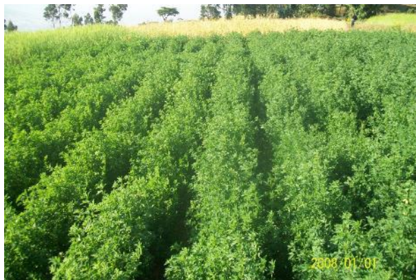
Alfalfa forage planted in rows

Alfalfa easily bears viable seeds, but it requires adequate pollination. It is highly advisable for seed producers to establish beehives in the proximity of alfalfa seed production plots. This will give farmers a double advantage; use the plant as bee forage and ensure proper pollination. Seed yield per harvest could range from 225 kg to 500 kg per hectare.