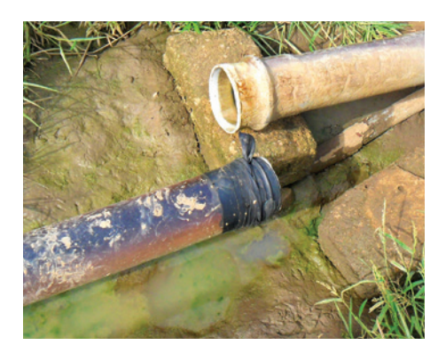
SMALL RESERVOIRS IN THE UPPER EAST REGION OF GHANA SHOWING (LEFT TO RIGHT) SILTATION, DYSFUNCTIONAL DISTRIBUTION CANALS AND DAMAGED IRRIGATION PUMP PIPES.

that are more accessible to women, would encourage them to adopt high value, market-orientated cash crop farming in the dry season. This could significantly improve household incomes and nutrition.