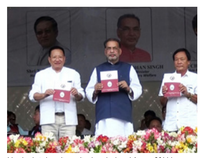
Nagaland pig breeding policy launched on 6 August 2016 by Radha Mohan Singh, the Indian minister for agriculture at a public meeting in Kohima, Nagaland

In fact, existing breeding policies in a couple of states are rather vague, limited to one or two paragraphs, without much detail on the recommendations. In contrast, the Nagaland policy contains information on breeding objectives, recommendations for action in specific locations and on certain production systems, a breeding a technical breeding program, the selection of breeding and replacement stock, required support and an implementation plan.