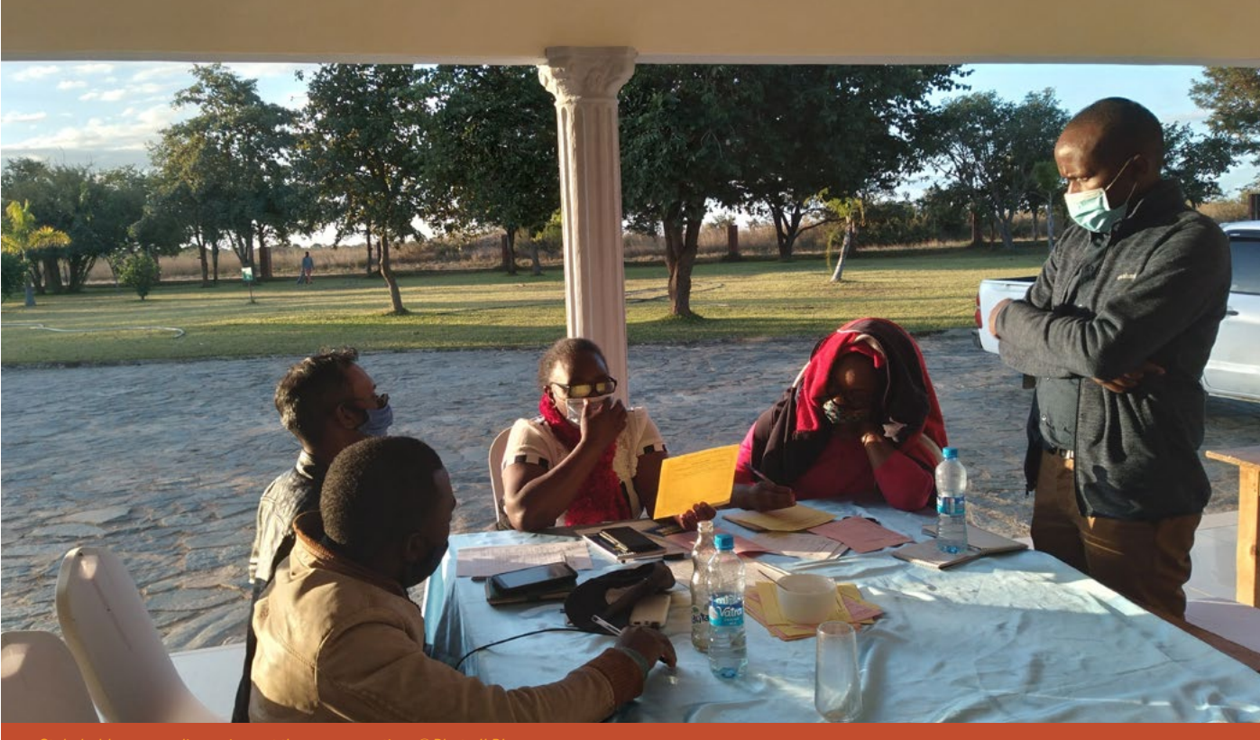
Stakeholder group discussions at the same meeting.