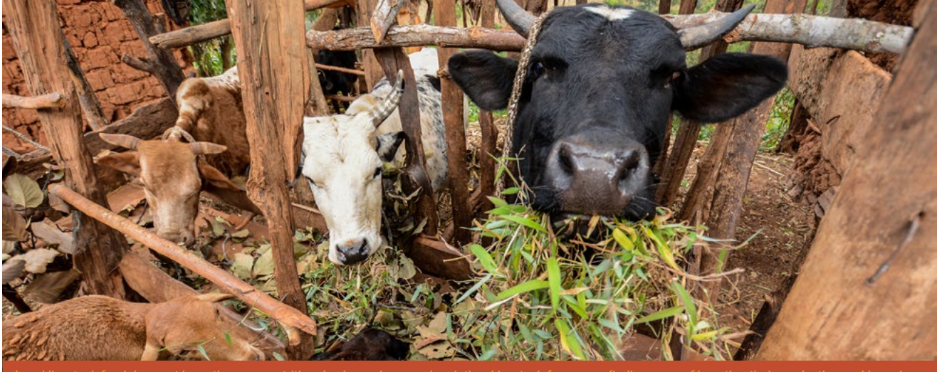
Local livestock feed does not have the same nutritional value as improved varieties. Livestock farmers re finding ways of boosting their production and lowering their environmental impact by planting improved forages..