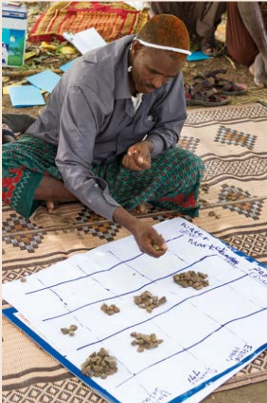
Resource trend analysis is a valuable complementary tool to mapping.