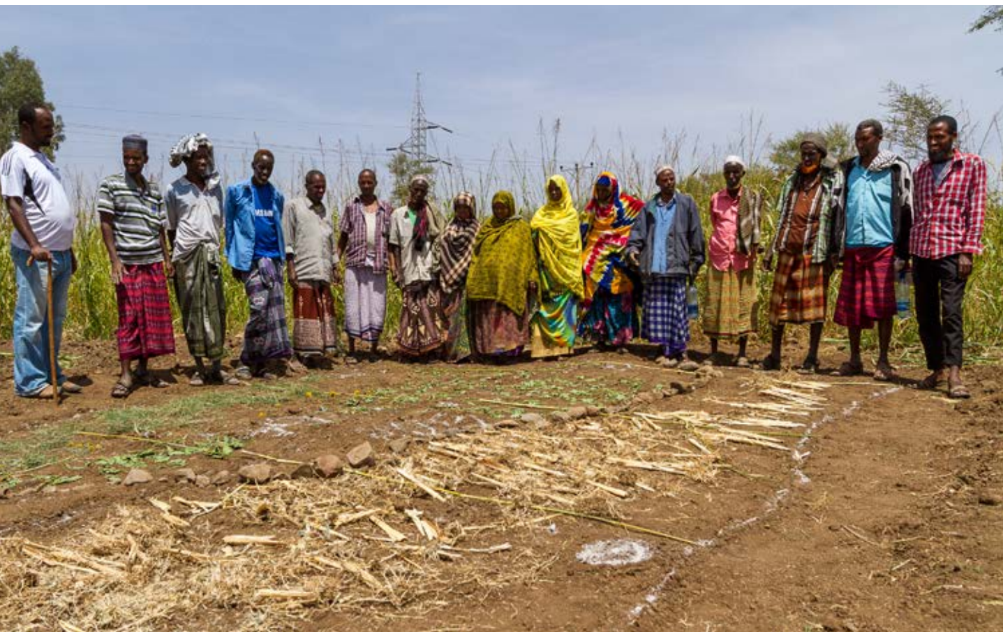
Photographs of the finished map are an important record for the mapping report.