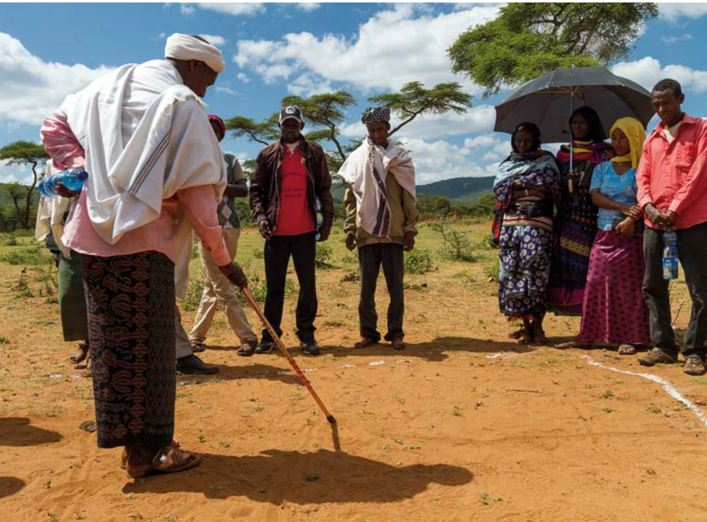
Locating a key landmark that everyone knows is a good starting point in mapping.