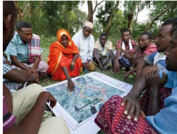
Mapping participants work together to validate a digitized map of their rangeland.

Once the final laminated, hand drawn, validated version of the map has been produced and disseminated, a decision can then be made with the community on whether or not the map should be digitized. The mapping team should explain that a digitized map could be more easily compared to other maps, such as topographic maps. A digitized map may also be