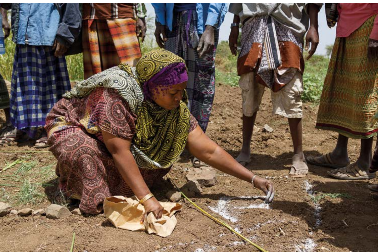
Good questions can prompt the community to add important details and information to the map.