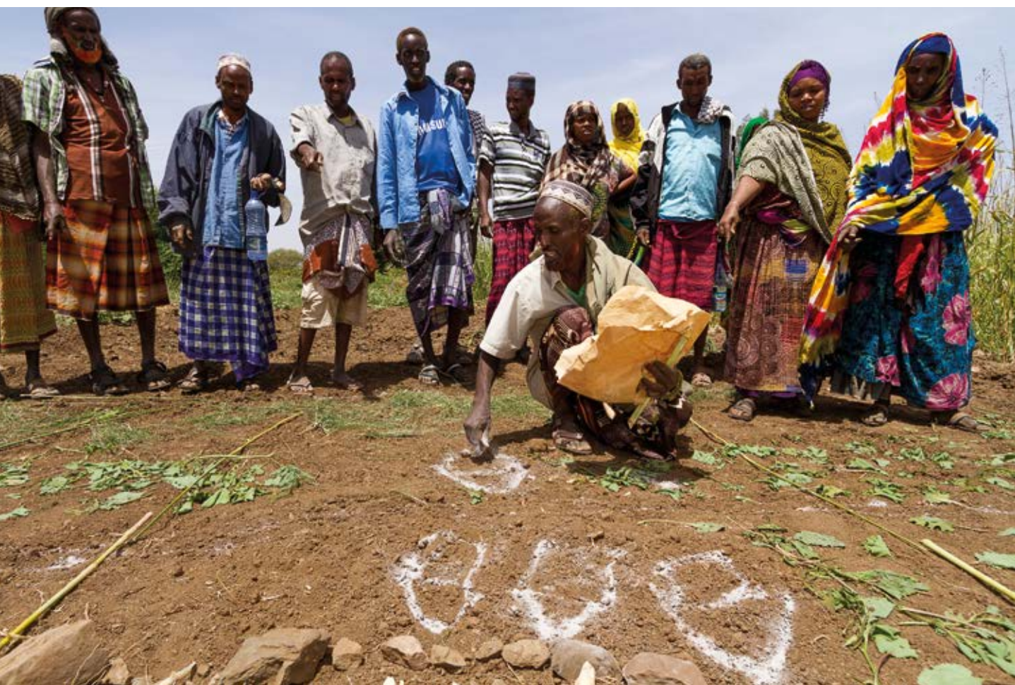
Being highly visual and inclusive, mapping can help increase levels of participation in all stages of PRM.