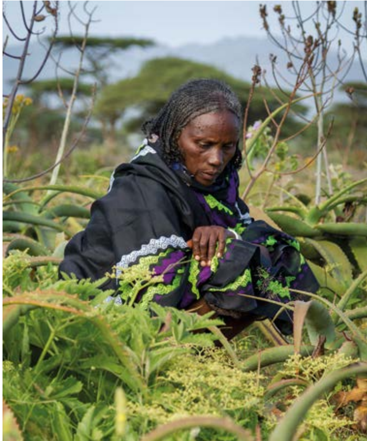
DIDA YABELLO, YABELLO WOREDA, BORENA ZONE, OROMIA REGION