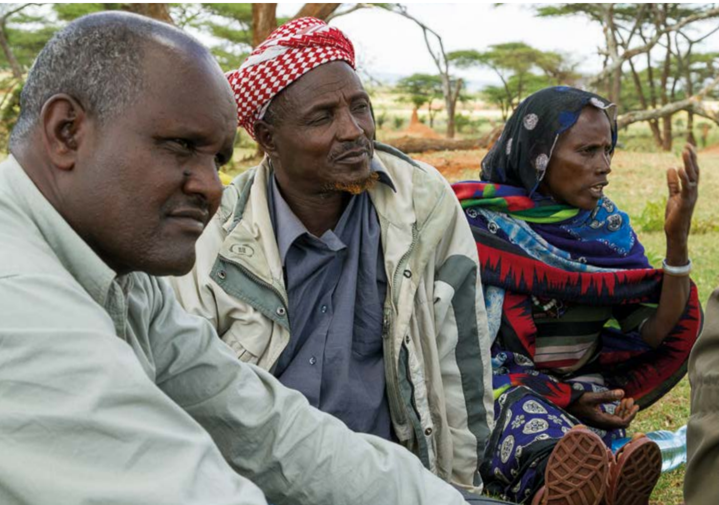
Working closely with the community throughout the preparation phase is key to ensuring a successful mapping exercise.