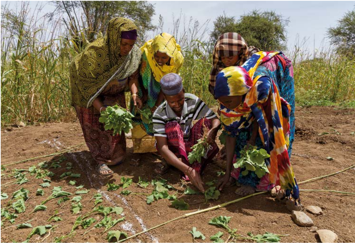
Producing a ‘map’ on the ground enables communities to explain their resource use to those from outside their community.

There are a number of advantages to digitizing community drawn maps with the participation of the communities that made them. This gives the community greater control, builds capacity, and provides a valuable tool for communities needing a baseline for discussions and negotiations with other stakeholders.