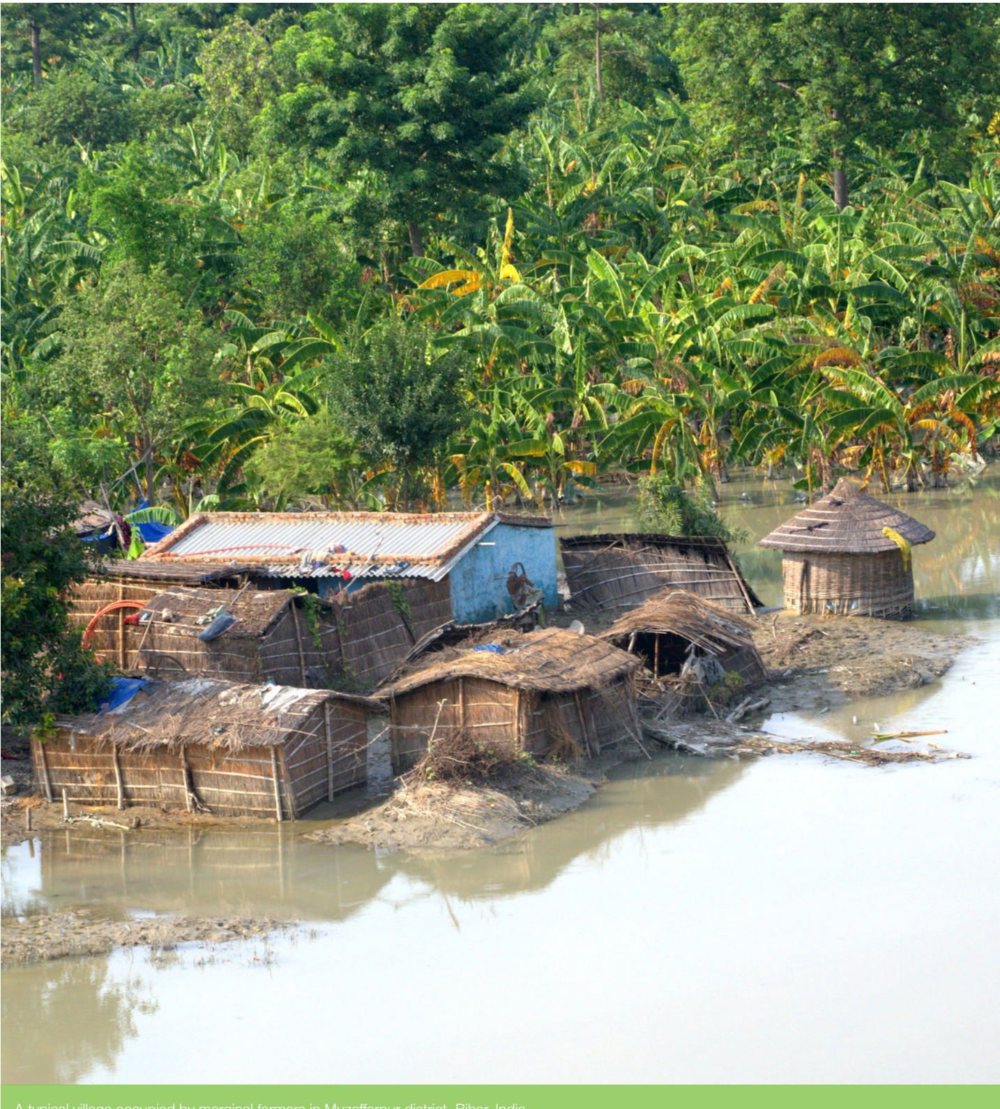
A typical village occupied by marginal farmers in Muzaffarpur district, Bihar, India