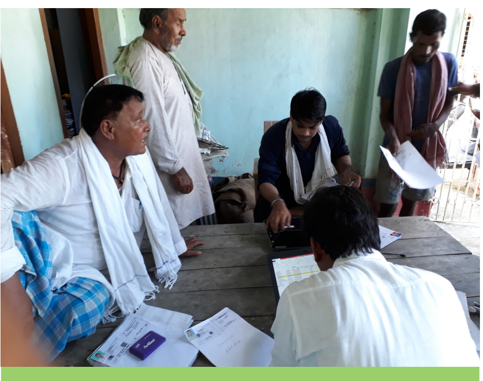
Picture: Farmer enrollment to IBFI at village level

BSDMA has a network of over 1,000 master trainers stationed throughout the state (one per three Panchayat areas) to support the mandate of providing training and capacity building on DRR and disaster mitigation to the relevant stakeholders.