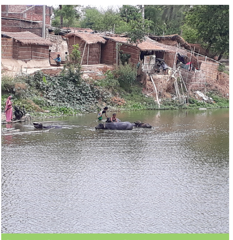
<sup>l</sup>icture: Baghmati River running across Muzzafarpur, Bihar, India

Capable private sector entities are available to offer services to promote IBFI, by developing appropriate promotional materials and videos suited to diverse communities. A private company named 'Digital Green' is currently working with 'JEEViKA' and Oxfam India to provide tailormade solutions to create awareness with an understanding of the local context, and to build the technology so that it is suited to and for the community.