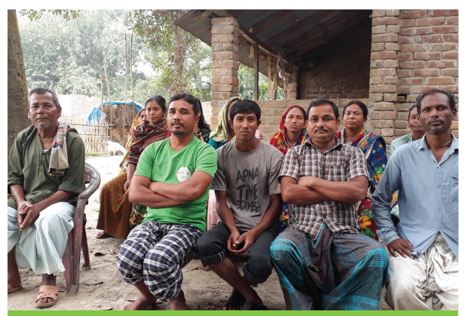
FIGURE 1: A GROUP OF SMALL AND MARGINAL FARMERS DISCUSSING WIBCI AT A FOCUS GROUP DISCUSSION IN DOHONDA VILLAGE, DINAJPUR DISTRICT, BANGLADESH.

This brief explores how the Green Delta Insurance Company Limited (GDIC) adopted an aggregator<sup>1</sup> model to address some of these challenges during implementation of a WIBCI product among farmers. Data were collected through Focus Group Discussions (FGDs) and Key Informant Interviews (KIIs) in selected villages in Bogura, Dinajpur and Nilphamari districts in northern Bangladesh, where this WIBCI product was implemented (Figure 1).