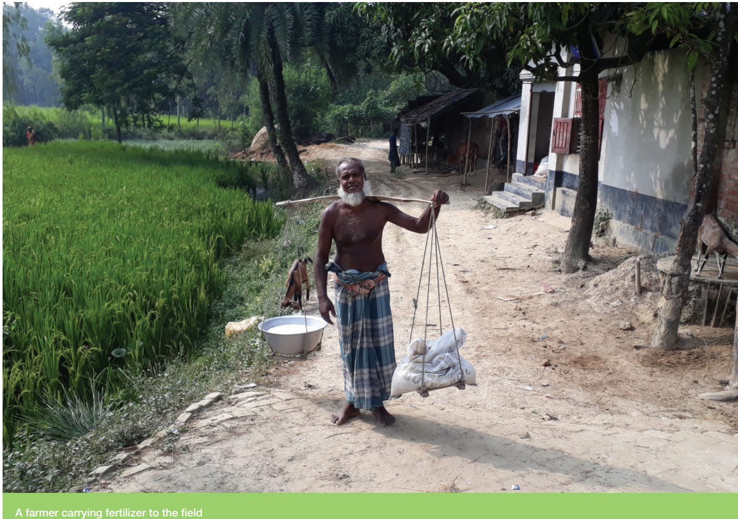
A farmer carrying fertilizer to the field