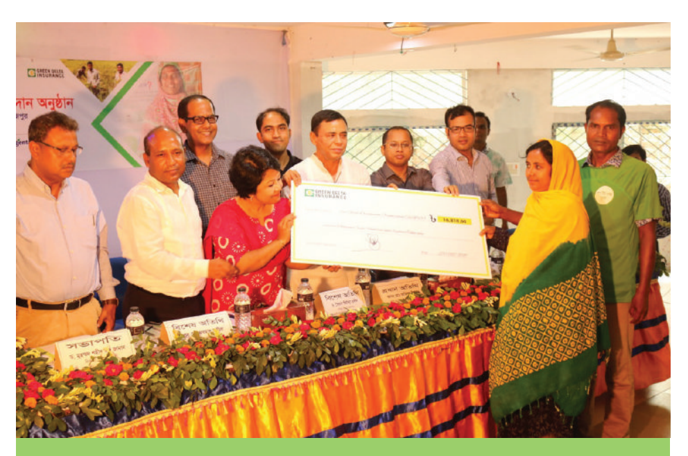
Distribution of bundled insurance in a claim payout ceremony in 2019

Bangladesh is located in the low-lying river delta formed by the Ganges, Brahmaputra and Meghna rivers, and is considered as the country most vulnerable to climate change in the world (World Bank 2012). Furthermore, the country's geography, population density and extreme poverty make Bangladeshi people highly vulnerable to other natural hazards, which often turn into disasters. Among the various risks and disasters, flooding is the most common and frequent, and is considered to be one of the principal threats to development. Approximately 70% of Bangladesh's of flooding. population is at risk