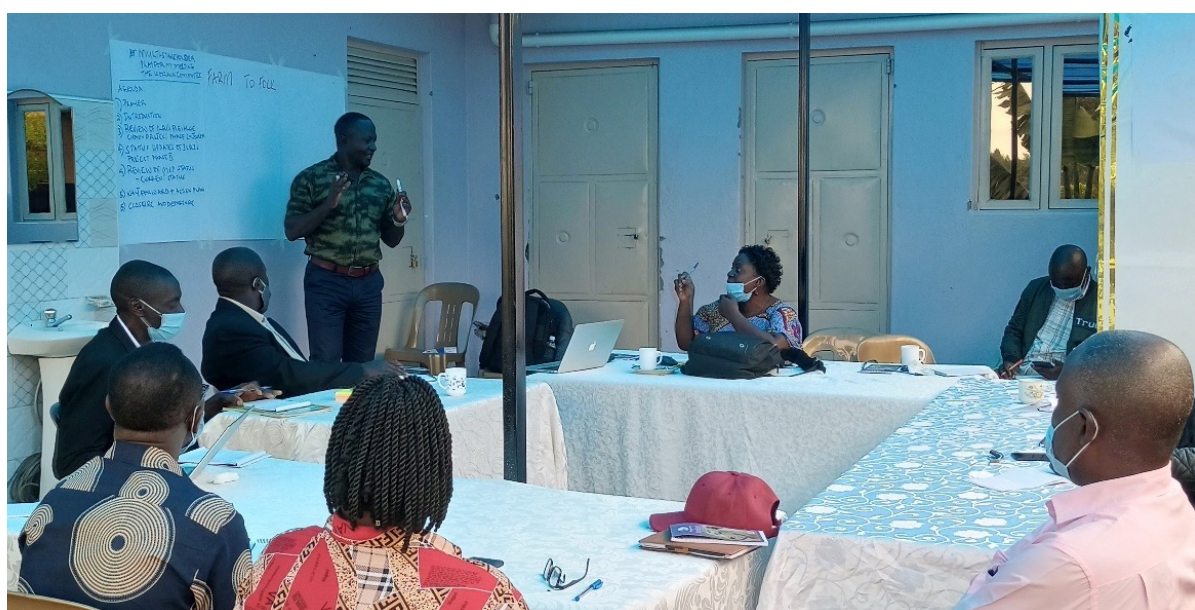
Members of the steering committee of the Greater Masaka pig MSP during one of the meetings to assess progress of the MSP activities.