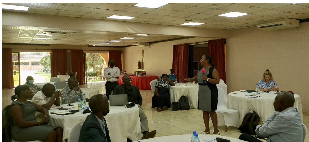
Members of the national multi-stakeholder pig platform during meeting held in Kampala.