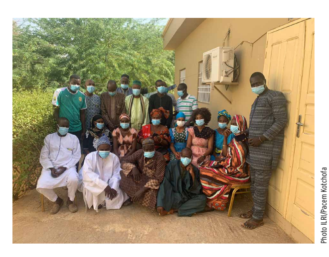
Group photo of stakeholders who participated in the PPR participatory disease modeling sessions in Senegal

The ECo-PPR project is executed with innovative approaches and methods to capture these components and harmonize data collection across all countries and among partners by developing a data collection framework (Figure 1). Some boxes in the framework correspond directly to research tools, such as the key informant interviews, community meetings, household surveys and market surveys; while other boxes, such as gender and socioeconomic studies, are integrated throughout multiple tools. All the baseline studies tools are interdisciplinary, capturing both the epidemiological and socioeconomic dimensions to support the integrated studies. For example, the household questionnaire which captures SRs husbandry, animal movement to understand disease spread and disease management practices was structured as an intra-household survey i.e. it is administered to both a man and a woman within each household. This structure takes advantage of the different knowledge men and women have due to different gender roles in SRs production and gives gender disaggregated data to better understand women's contributions in disease management and control.