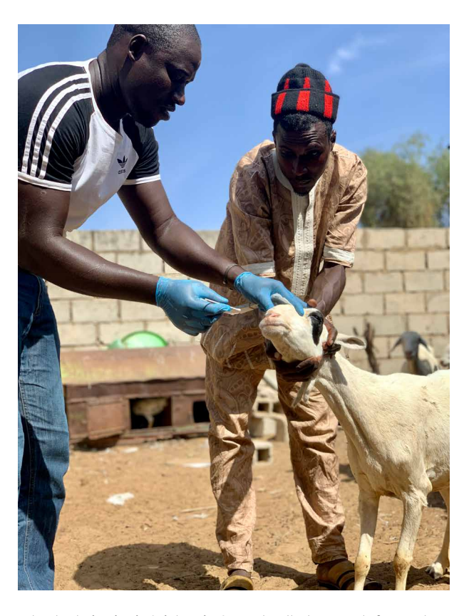
A local veterinarian in Saint Louis, Senegal, collects a sample from a sheep that is showing clinical symptoms of PPR.

The baseline tools are programmed for digital administration in Open Data Kit (ODK) and available in English, French and Swahili. By administering the tools in six project countries and encouraging their use in partner projects, the project aims to provide harmonized results that can assist with policy decisions at the regional and global level.