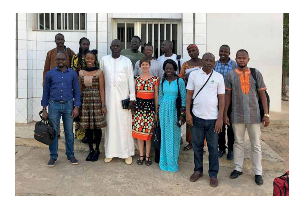
Group photo of the regional West African meeting for enumerators trainings before launching field data collection in Senegal