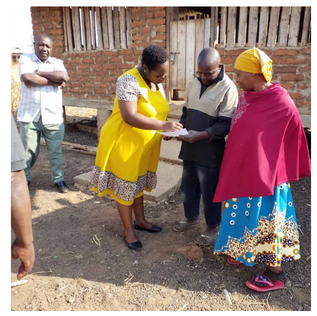
An enumerator conducting a household survey in Tanzania.

Specifically, it will provide a deeper understanding of the socioeconomic impact of PPR and the challenges to control it using an interdisciplinary approach that bridges socioeconomics, epidemiology and biosciences. The immediate beneficiaries of the ECo-PPR project are livestock keepers, public and private veterinary professionals, animal health practitioners such as the field delivery agents and the respective countries' governments.