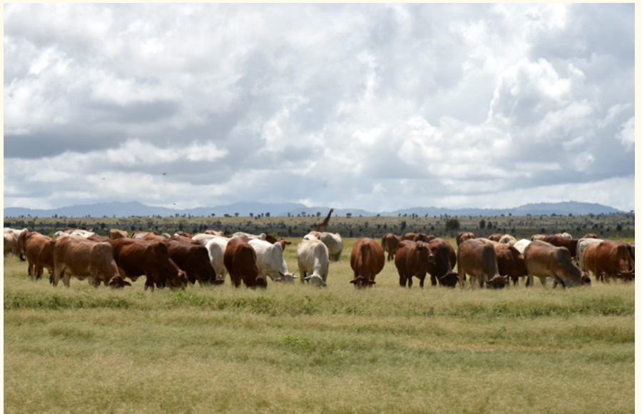
Cattle and wildlife at the ILRI Kapiti Research Station.

There is often a perception that livestock are major contributors to land degradation and biodiversity loss. However, people, wildlife and domestic animals interact in complex and often beneficial ways. Integrated crop-livestock are crucial farming systems in the developing world (and increasingly recognized in the developed) and livestock play an important role in nutrient recycling through controlling crop residues and fertilizer from manure. Likewise, sustainable livestock grazing increases rangeland productivity in many grazing systems.