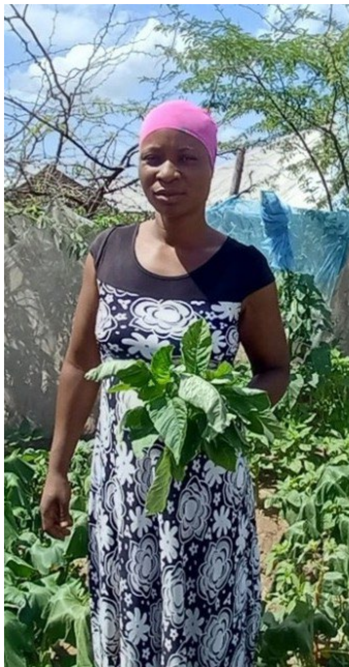
Harvesting amaranth leaves from a greywater-irrigated home garden in Kalobeyei Settlement in Kenya.

The introduction of charcoal briquettes, produced from organic biomass and charcoal dust, has shown promising results, with refugees reporting reduced fuel consumption and cooking time, particularly for slow-cooking crops included in the WFP food basket. In addition, this approach reduces pressure on local biomass resources, fostering greater cohesion with host communities by minimizing competition for fuelwood.