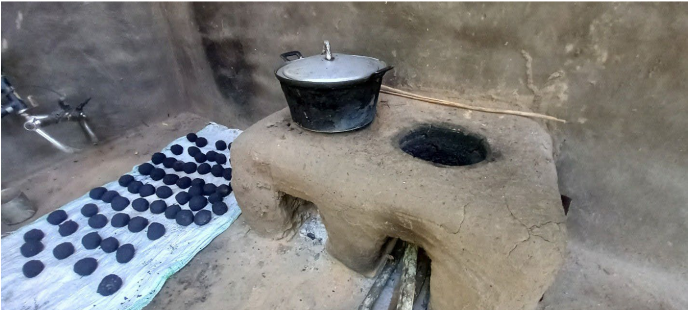
Charcoal briquettes produced by a refugee used for cooking in Imvepi settlement in Uganda.