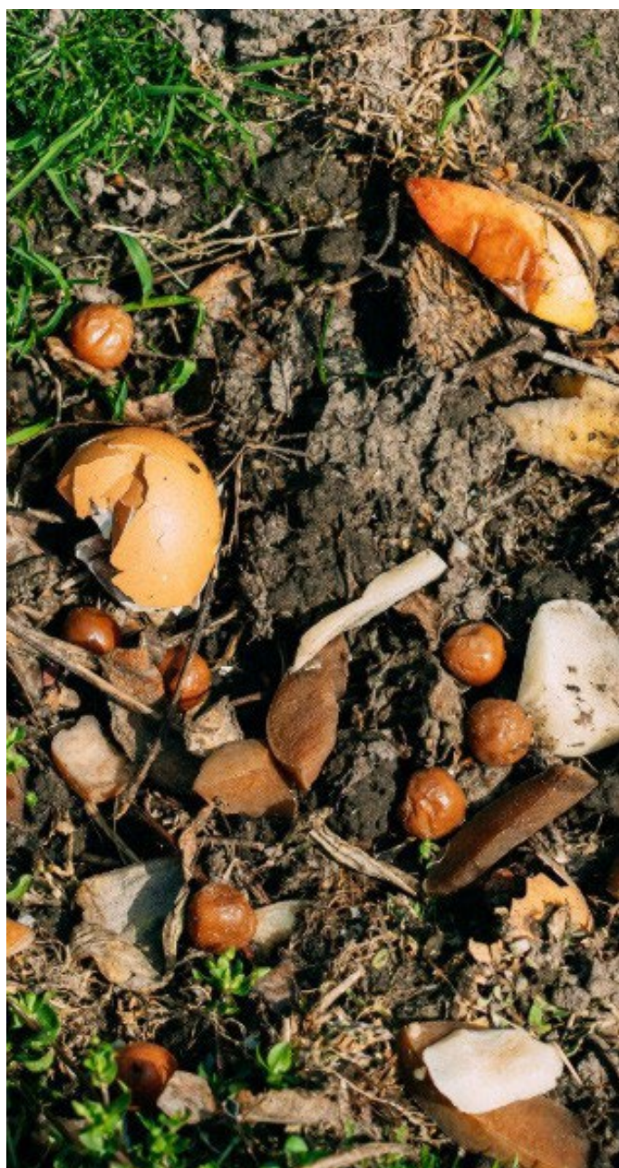
Compost from organic waste and manure

this approach has the potential to be scaled up in other refugee settings and host landscapes across the MENA region, offering a sustainable solution to energy and waste management crisis.