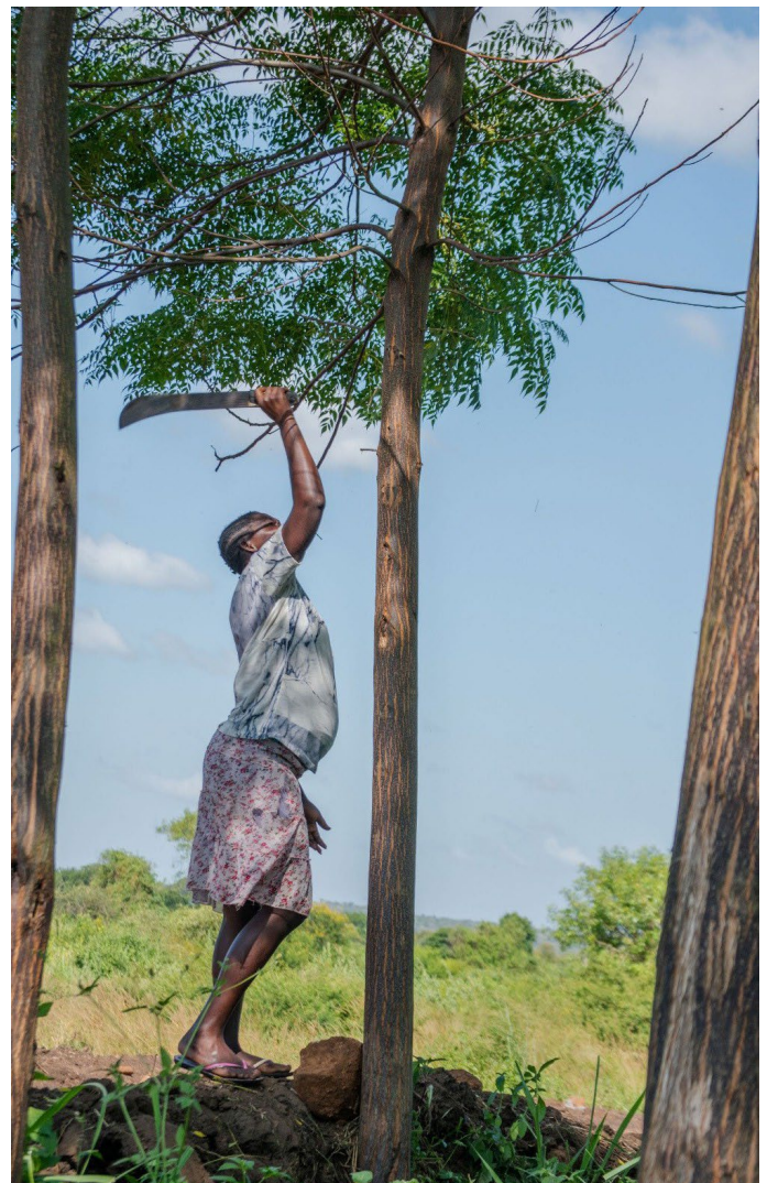
Pruning a tree for firewood in Rhino Refugee Settlement in Uganda (photo: CIFOR-ICRAF).

distances, often through unsafe areas, exposing them to gender-based violence.