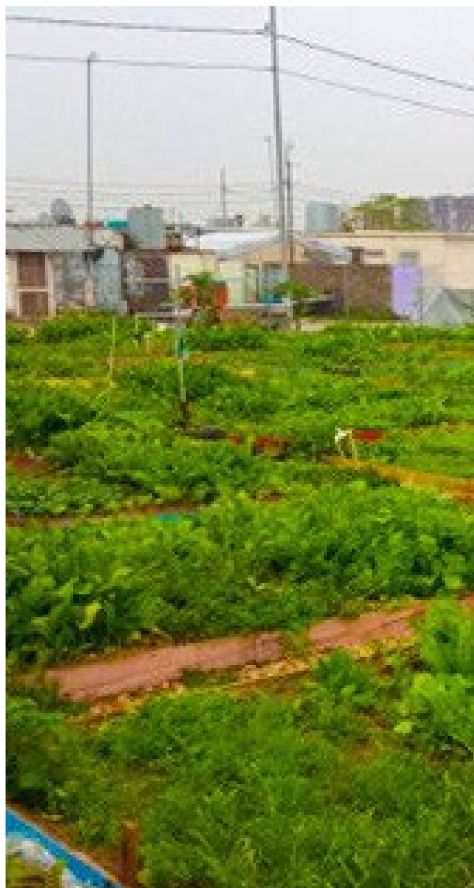
Growing vegetables with raised beds

Additionally, waste management remains a critical concern in refugee-hosting landscapes. For instance, the Za’atari camp generates approximately 34 metric tons of solid waste daily, placing immense strain on infrastructure, municipal services, and the environment (FAO, 2024). Addressing such challenges through integrated CBE frameworks that link waste management, energy generation, and food production is therefore essential to advancing both humanitarian resilience and environmental sustainability.