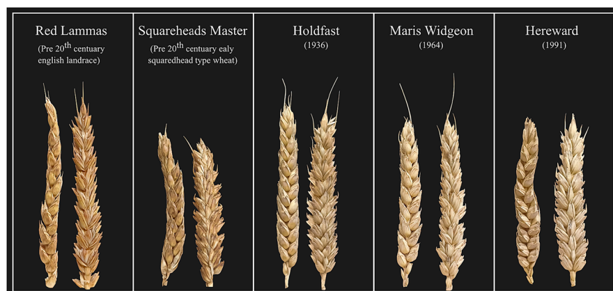
FIGURE 2 Example side and front view images of ears from key early wheat varieties grown in the United Kingdom.