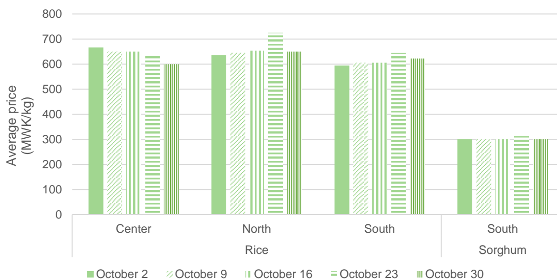
Figure 2. Regional average retail prices (MWK/kg) of rice during October 2021