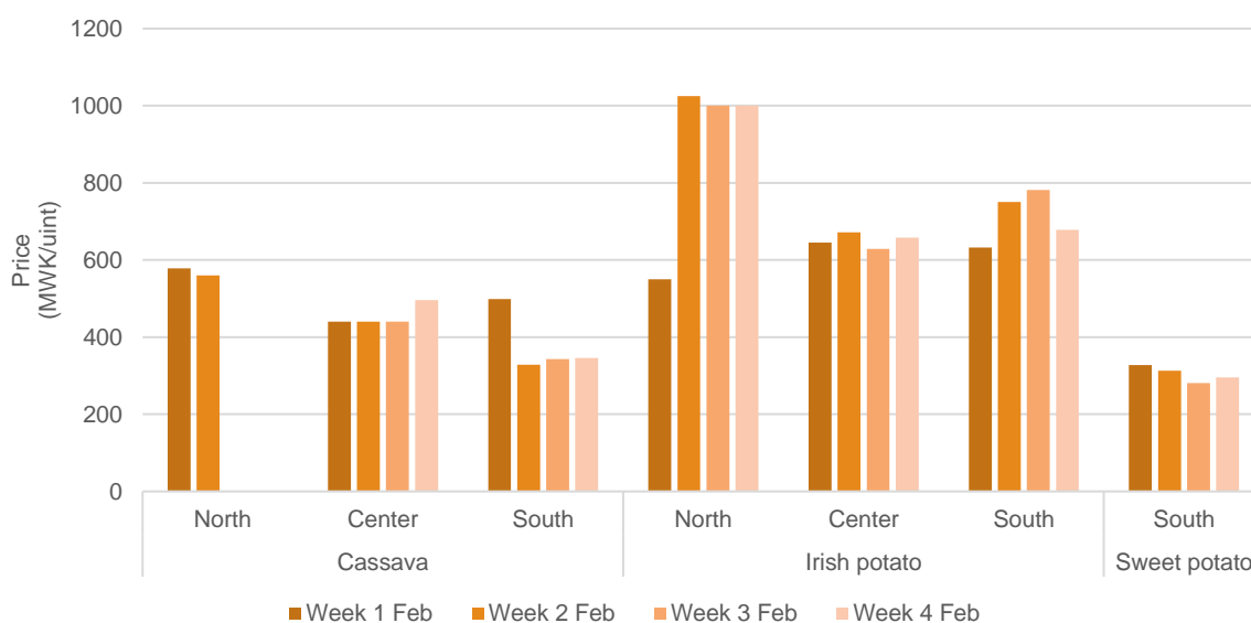
Figure 1. Regional average retail prices (MWK/unit) of cassava, Irish potato, and sweet potato during February 2022