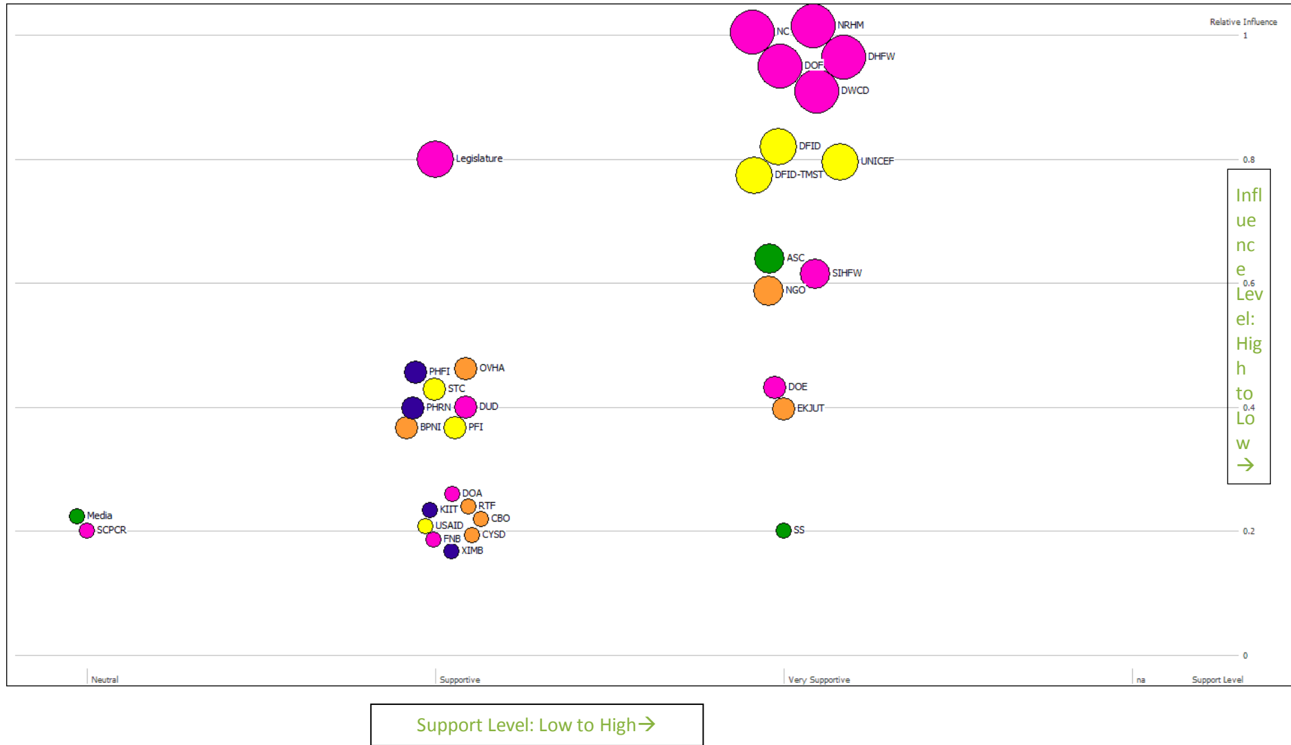
FIGURE 2. LAYERED MAP ACCORDING TO INFLUENCE AND SUPPORT LEVELS: NUTRITION IN INDIA