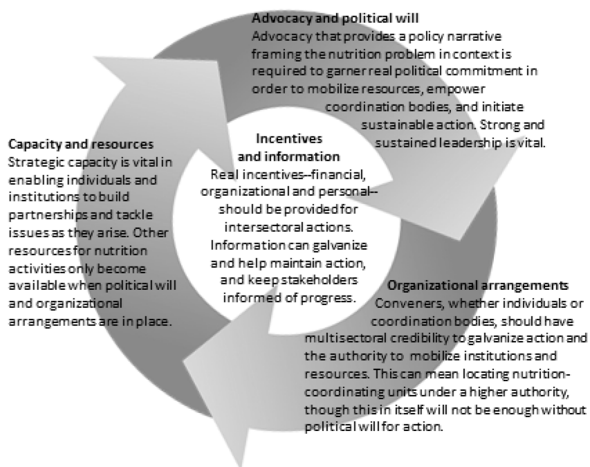
Figure 3.1—Lessons for intersectoral action on nutrition