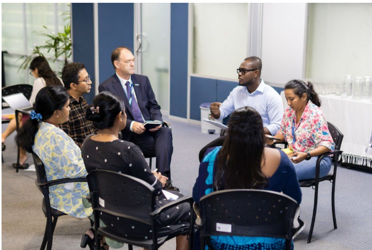
Figure 13: Discussion of group-2.

Focus: Empowering local institutions, producer groups, and marginalized communities to co-design and implement inclusive, context-specific climate adaptation solutions that are scalable and sustainable (Figure 13).