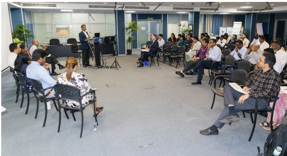
Figure 11: Panel Discussion.