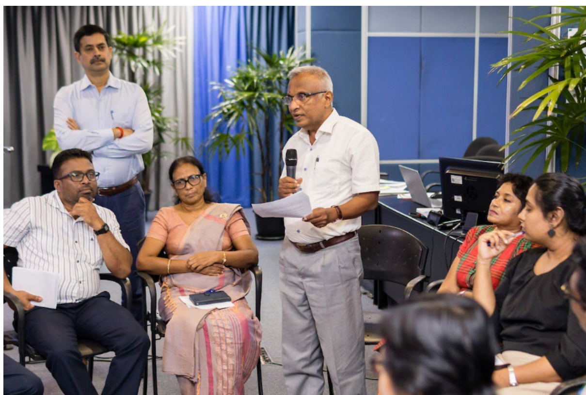
Figure 14: Discussion of group-3.