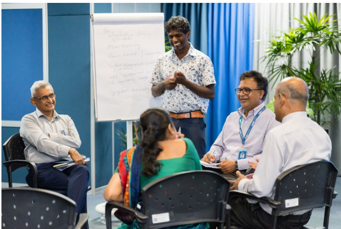
Figure 15: Discussion of group-4