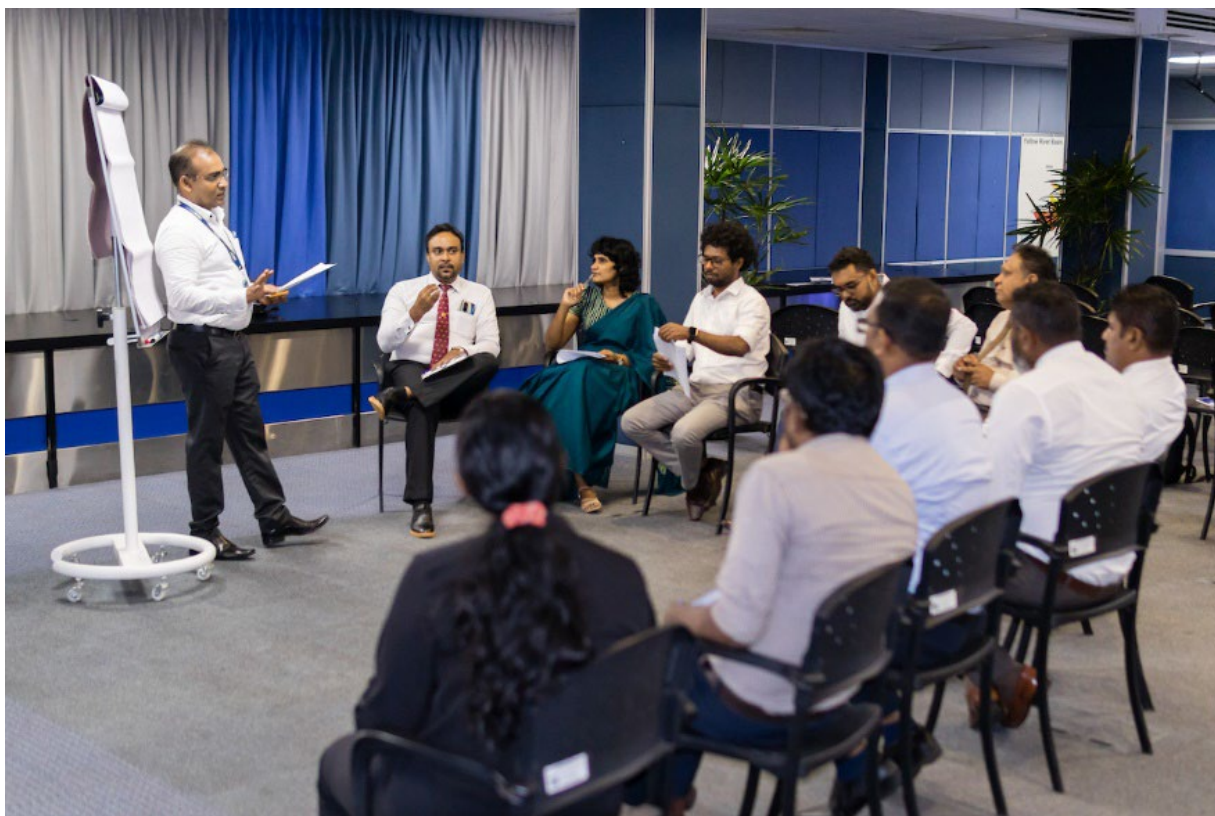
Figure 12: Discussion of group-1.