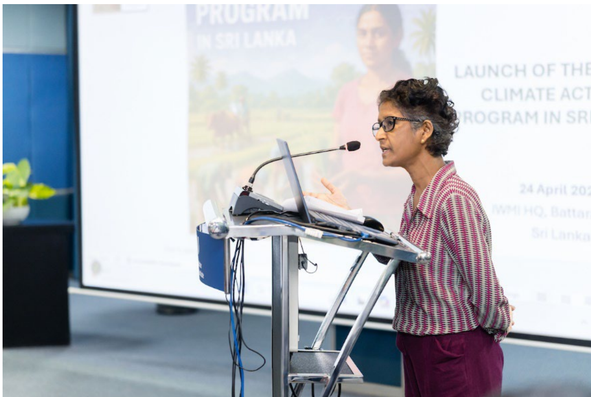
Figure 5: Special remarks by Ms. Chamani Kumarasinghe, Director, Climate Change Secretariat, Ministry of Environment.

Ms. Kumarasinghe highlighted the Ministry of Environment's role as the National Designated Authority for the The United Nations Framework Convention on Climate Change (UNFCCC) and the Paris Agreement. She reaffirmed the Ministry's commitment to supporting vulnerable communities facing climate-related impacts and emphasized the importance of national initiatives such as the Nationally Determined Contributions (NDCs), National Adaptation Plan (NAP), and Greenhouse Gas (GHG) Inventories. Achieving these targets, she noted, will provide a structured plan of action that aligns national decision-making with both global and domestic climate commitments.