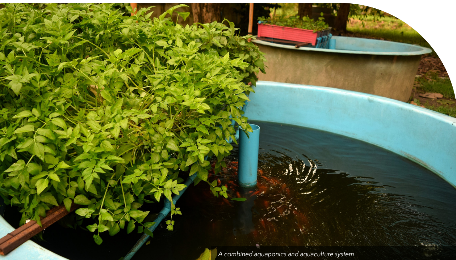
A combined aquaponics and aquaculture system

Aquaculture and aquaponics are both well suited to small spaces in urban areas. The former is solely concerned with fish production; the latter combines fish with vegetable production. Recirculating aquaculture