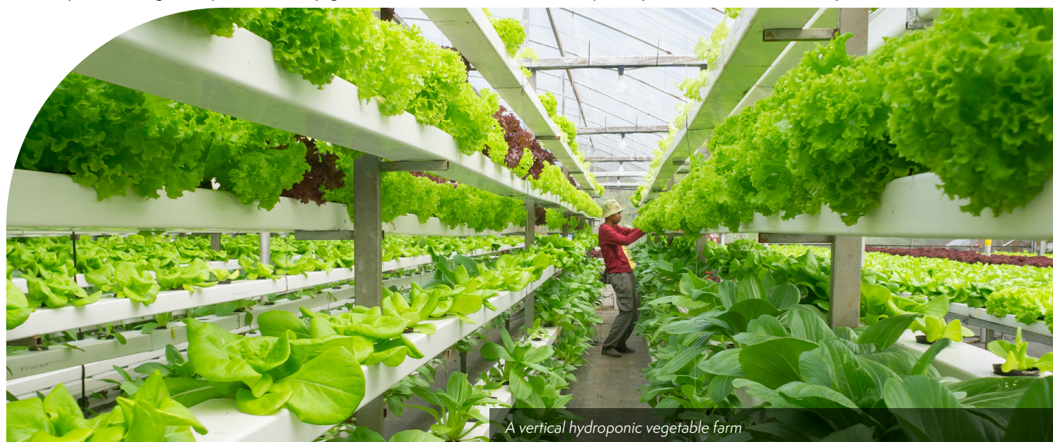
A vertical hydroponic vegetable farm

Equally impressive in terms of productivity is Growing Underground's farm in London. This occupies a World War II air raid shelter 100 feet below Clapham High Street. The company specialises in micro-greens which take just two weeks to grow, including pea shoots, basil, coriander, parsley and rocket. These, they claim, contain