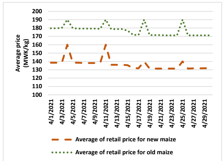
Figure 2. Daily retail prices for old and new maize (MWK/kg)

As the 2020/21 harvesting season is underway, both ‘old’ (harvested in the 2019/20 season) and ‘new’ (recently harvested) maize stocks are for sale on the market. Figure 2 compares the average retail maize price of ‘old’ and ‘new’ maize stock in April 2021. Prices for ‘new’ maize are usually lower than for ‘old’ maize because of its higher moisture content but follow the same pattern as old maize price throughout the month. On average, retail prices of ‘new’ maize were MWK41/kg lower than for ‘old’ maize during April, MWK11/kg lower than last month and were also lower than minimum farmgate price for maize (MWK 150/kg) set by the Ministry of Agriculture and Food Security.