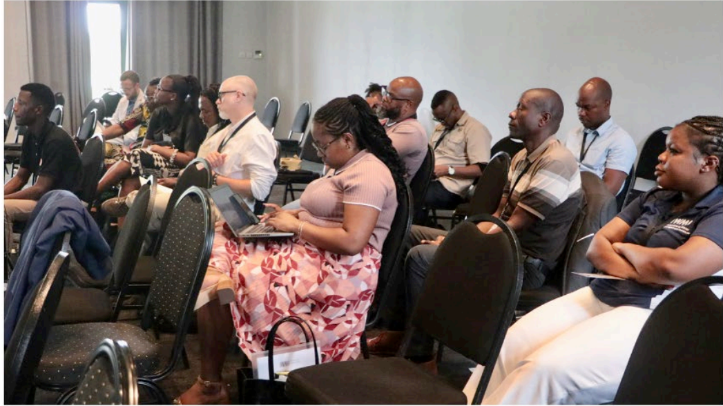
Figure 12. Attendees at Session 2 on the DT and Water Copilot.