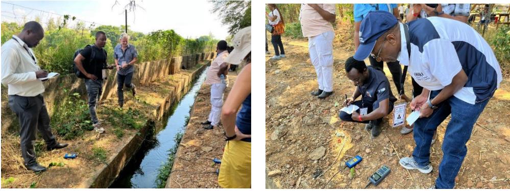
Figure 15. Participants taking salinity readings in the stream, to determine channel velocity and discharge.

They also carried out a stream health assessment using miniSASS , scoring river health based on observed macroinvertebrates (Figure 16).