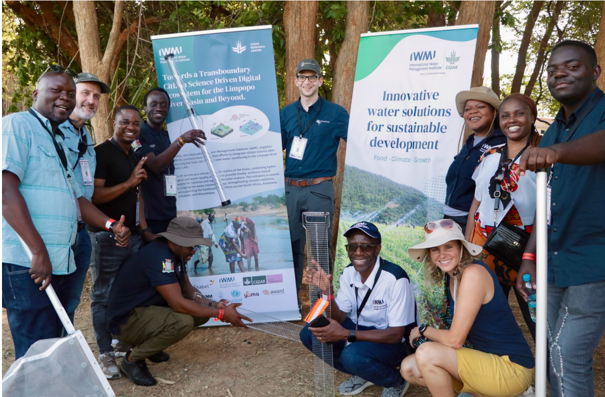
Figure 13. Members of the Zambian Ministry of Water Development and Sanitation, GroundTruth, IWMI, and GWP-SA at the excursion, at Kalimba Reptile Park, Lusaka, Zambia.