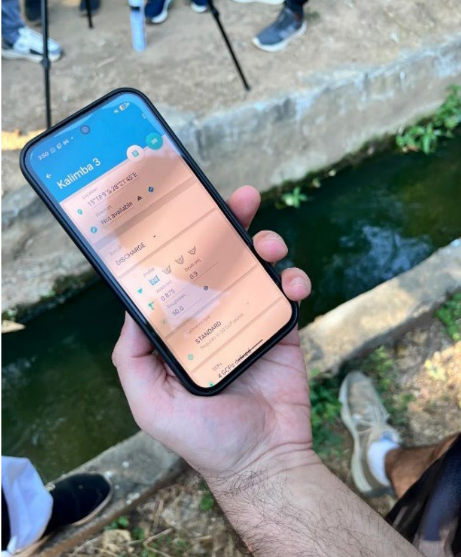
Figure 20. Example of smartphone use in data collection (measuring streamflow and estimating discharge with videos from a smartphone)

Finally, participants explored smartphone-based discharge estimation , using videos captured on mobile phones to derive flow estimates (Figure 21).