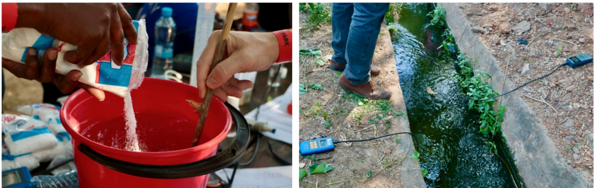
Figure 14. Demonstration by GroundTruth, using table salt in citizen science hydrological data collection, collecting streamflow velocity data using a flow meter.

Participants worked in small groups under expert guidance to learn and apply practical techniques for assessing surface water quality and quantity. Activities included streamflow velocity measurements , where participants collected streamflow data using both a flow meter and low-cost tracer methods (see Figures 14–16).