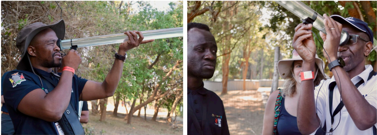
Figure 17. Demonstration of the use of the clarity tube for observing suspended solids in river water, a core parameter of river water quality.