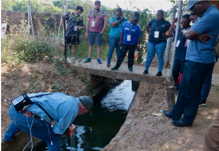
Figure 18. Demonstration on taking velocity and discharge measurements using the velocity plank (transparent velocity head rod) (photo: IWMI).