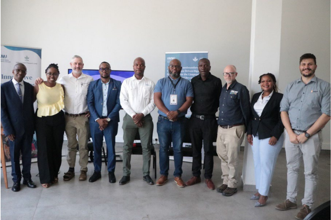
Figure 7. LIMCOM Member State representatives, IWMI citizen science and DT team, GroundTruth, AWARD, and GWP-SA representatives working together on the project.