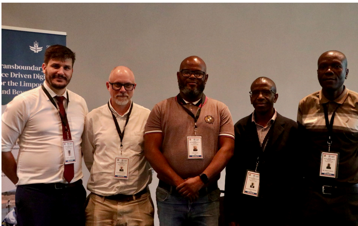
Figure 10. Session 2 panellists, including LRB Member State representatives, a LIMCOM/GWP-SA representative and IWMI representatives.

Figures 10–12 illustrate these dynamics in practice: Figure 10 shows panellists and LRB Member State representatives and LIMCOM/GWP-SA representatives, reflecting the strong multi-stakeholder engagement in the session. Figure 11 captures audience members engaging in an active Q&A with the panel, while Figure 12 depicts attendees of the session, underscoring the broad interest in the DT and Water Copilot as tools for transboundary water governance.