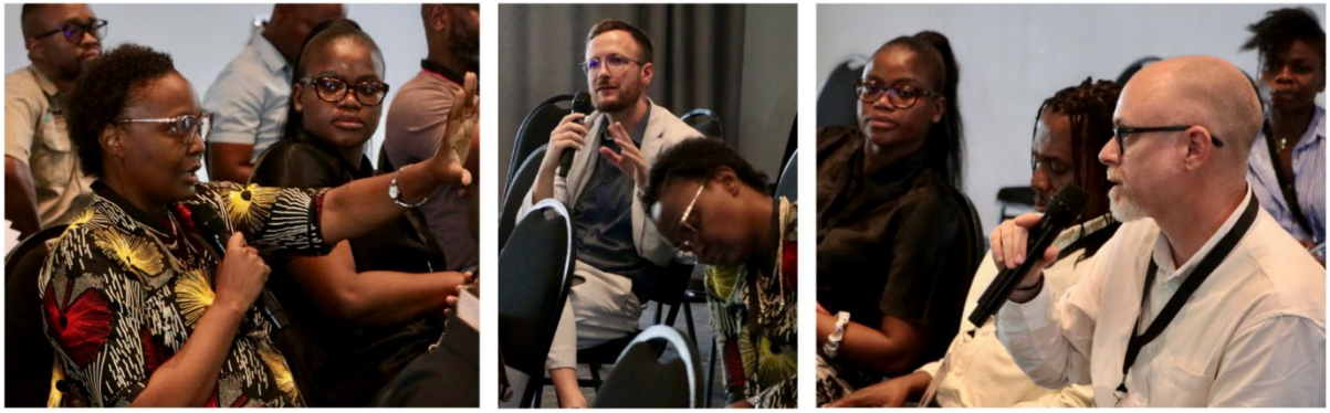
Figure 11. Audience members engaging in the Q&A session (photos: IWMI).