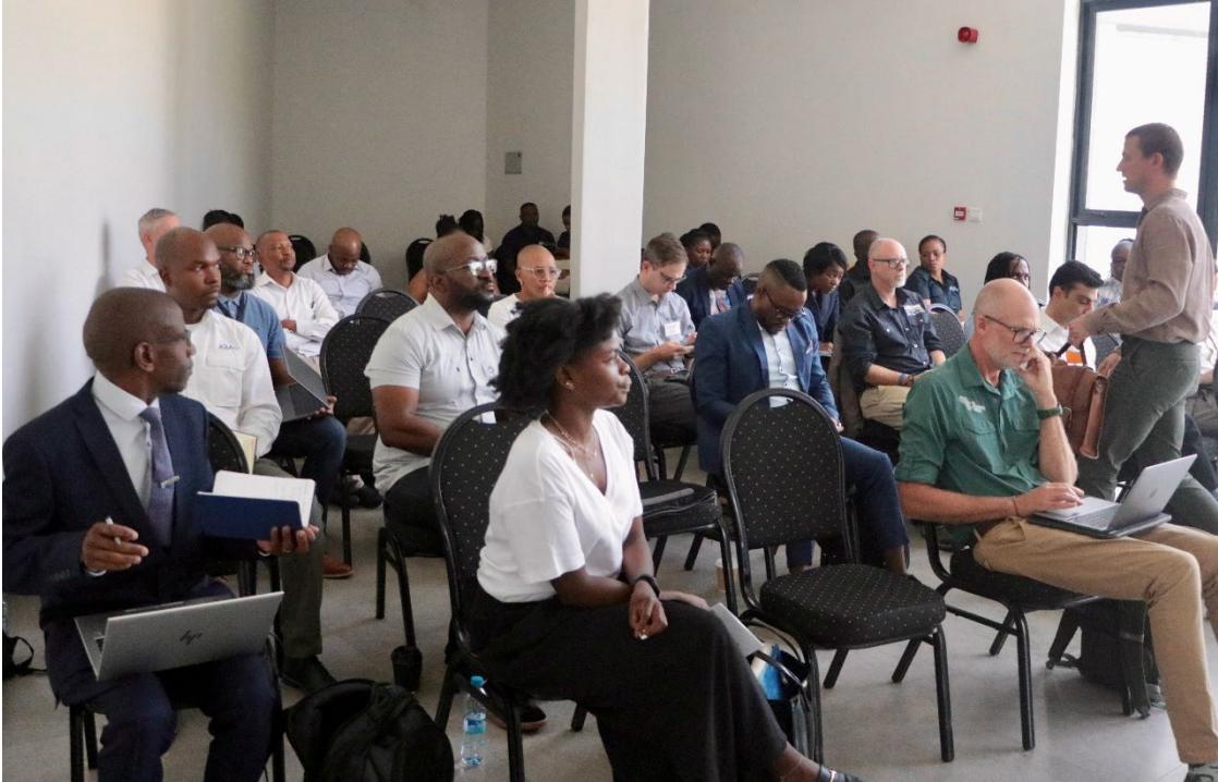
Figure 6. Attendees in IWMI's citizen science Session 1 (photo: IWMI).

Figure 6 shows attendees participating in Session 1, reflecting strong engagement from across the basin. Figure 7 illustrates the collaborative nature of the initiative, depicting LIMCOM Member State representatives together with the IWMI citizen science and DT team, as well as partners from GroundTruth and Global Water Partnership Southern Africa (GWP-SA), working jointly on the project.