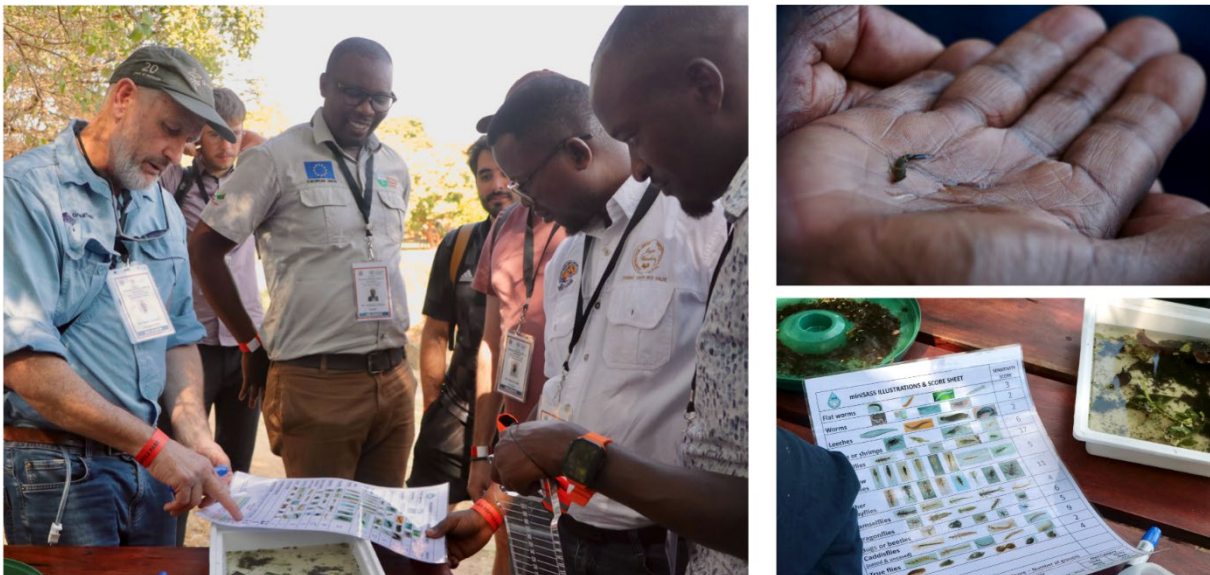
Figure 16. GroundTruth leading a demonstration on the use of a miniSASS scoresheet to score river/water body health based on the organisms observed.

They also carried out a stream health assessment using miniSASS , scoring river health based on observed macroinvertebrates (Figure 16).