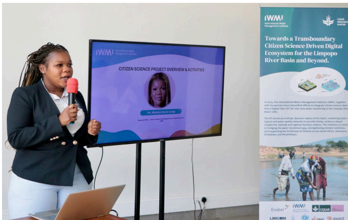
Figure 3. IWMI’s representative presenting on the citizen science project across the LRB.

YOMA platform: YOMA enables youth engagement in the citizen science program through learning-to-earning pathways (Storr, 2025). The platform supports: