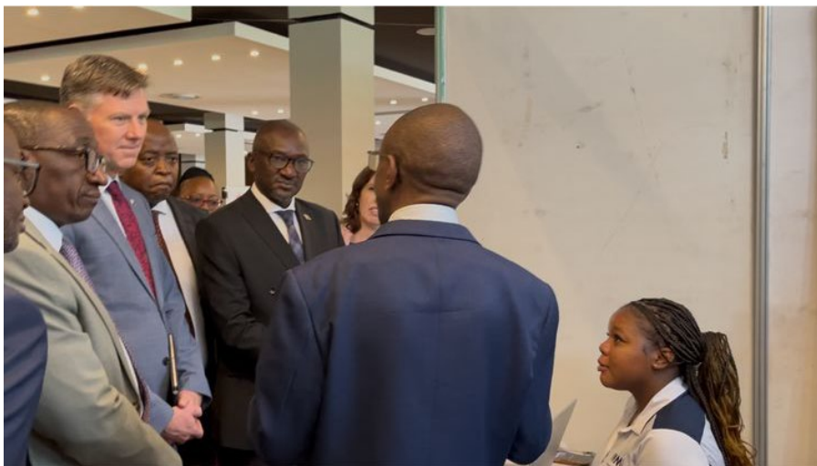
Figure 1. IWMI representatives are engaging with the Zambian Ministry of Water Development and Sanitation on the work IWMI is actively involved in, around citizen science in the LRB.

Anchored in WaterNet’s regional mandate, the sessions also advanced broader policy objectives aligned with the Southern African Development Communities (SADC) Protocol on Shared Watercourses, open and interoperable data principles, and inclusive participation. Figure 1 shows IWMI’s interaction with the Zambian Minister of Water Development and Sanitation at the exhibition booth. Deliberations highlighted ethical integration of indigenous and local ecological knowledge, multilingual accessibility, and the need for clear governance around data ownership, quality assurance, and institutional mandates for risk communication.