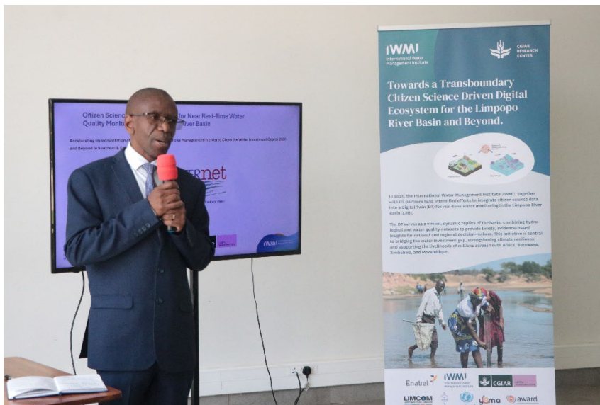
Figure 2. IWMI representative introducing the session on transboundary citizen science digital ecosystems for the LRB (photo: IWMI).

IWMI, YOMA, and LRB Member States joined in a presentation and panel discussion to explore the integration of citizen science into water management within the LRB. These presentations and discussions highlighted citizen science as an effective approach for data collection, community engagement, and supporting early warning systems. In Figure 2, a representative from IWMI's delivers an introductory talk for the session, setting the stage for the conversations that were had and facilitating the conversations.