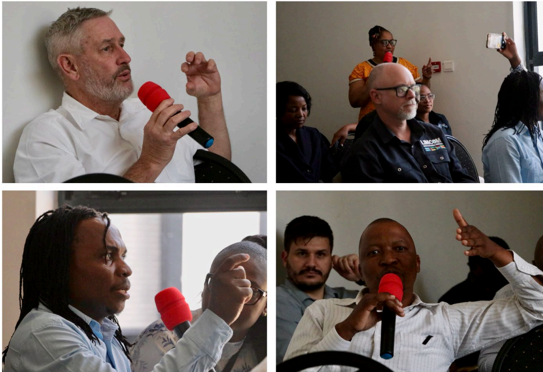
Figure 5. Audience members engaging in a Q&A session, for Session 1.