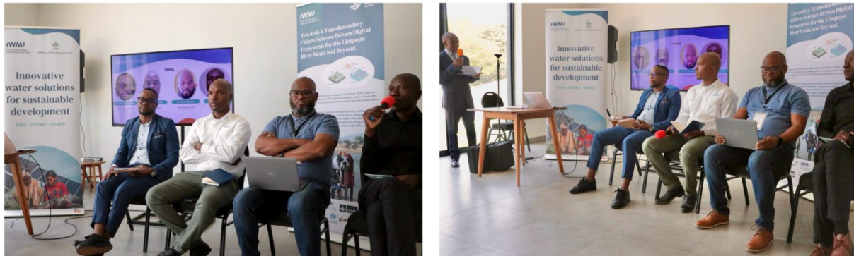
Figure 4. a) Panelists for the transboundary citizen science efforts within the LRB were Member States representatives from Botswana, Mozambique, South Africa, and Zimbabwe (left to right), b) IWMI representative (far left) engaging with the panelists.

Figure 4 shows panelists sharing insights from across the LRB. From this panel discussion, Mozambique highlighted its reliance on community monitors and citizen scientists to strengthen and support early flood warning systems. Zimbabwe emphasized the importance of trust, underscoring that communities must see that the data they provide leads to tangible action. Botswana focused on data quality, including the use of photo verification and promoting community ownership of information. Finally, South Africa reported on the use of WhatsApp for rapid communication with communities and the active engagement of private stakeholders in these communication channels.