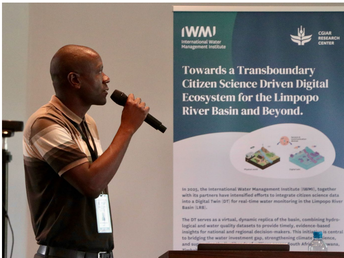
Figure 9. The Zimbabwe Member State representative, presenting in Session 2 on the application of the DT and Water Copilot for water monitoring in the LRB, from Zimbabwe's point of view

From a community engagement and governance perspective, the DT and Water Copilot were seen as important enablers of strengthened transboundary coordination, improved stakeholder engagement, and bridging the gap between scientific information and community realities, supporting more sustainable basin development.