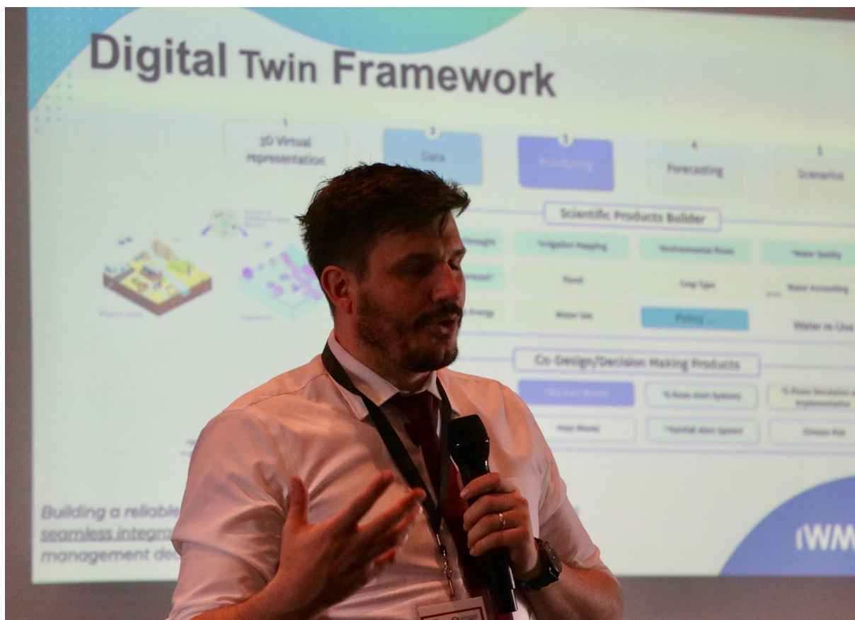
Figure 8. IWMI-Consultant presenting on the DT and Water Copilot technologies in Session 2.

Day 2 focused exclusively on the DT and its role in transforming water resource management in the LRB. The session explored how DT addresses fragmented data systems, improves transparency, and enables proactive decision-making through advanced modelling and integration of diverse datasets (Storr, 2025). In Figure 8, IWMI-Consultant, from the Association for Water and Rural Development (AWARD), is presenting on the development and implementation of the DT and Water Copilot for water resources monitoring in the LRB.