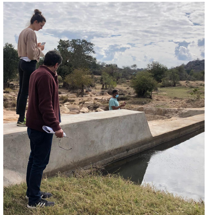
Figure 4. IWMI and Dabane Trust carrying out sand dam monitoring in Gwanda, Zimbabwe.

Sand dams are, however, not without risks. The quality of the water abstracted from the sand dam sites may not be adequate and long-term water quality testing is required to determine whether sand dams are effective in filtering out minerals and other potential contaminants. Unlike other small water infrastructure constructed in rural areas, sand dams require periodic maintenance. In some parts of the catchment, the geological characteristics do not allow for sand dam construction. This is particularly problematic for those areas where boreholes dry up during the dry season. Overall, however, sand dams have significant potential and comprise one key option in integrated water storage management.