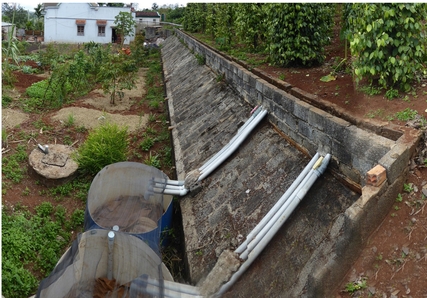
Figure 6. A MAR pilot site in Krong Buk district, Dak Lak province, Vietnam.

MAR received endorsement from the Ministry of Agriculture and Rural Development (MARD) and the Ministry of Natural Resources and Environment (MoNRE), in Vietnam, as well as the private sector as an agricultural extension tool for climate adaptation; an important milestone to enable wider adoption. MAR interventions were initially implemented by IWMI and Hanns R. Neumann Stiftung with the support of Nestlé, the Swiss Agency for Development and Cooperation (SDC) and CGIAR, working together with various government agencies and local farmers. Building on the lessons learned from the initial piloting, a new phase of the project is starting with IWMI working with the Western Highlands Agriculture & Forestry Science Institute (WASI) and Dong-A University with support from the Global EbA Fund in the implementation of a larger cluster of new MAR interventions to increase the cumulative impact of piloting.