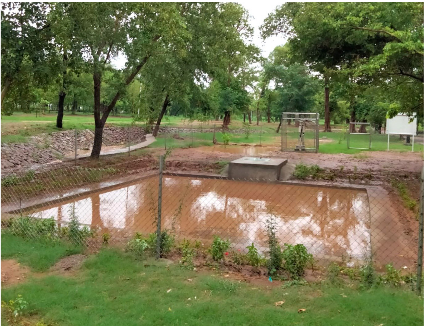
Figure 5. Groundwater recharge site at Kachnar Park, Islamabad, Pakistan.

Despite there being a high potential for establishing MAR sites in the major cities of Pakistan, uptake of the approach has been slow. Based on the successful extension and wider acceptance of the MAR model for Islamabad, IWMI is collaborating with the provincial (state) governments to establish fully instrumented MAR sites in cities within these provinces to provide scientific evidence for the uptake of groundwater recharge initiatives at the national scale.