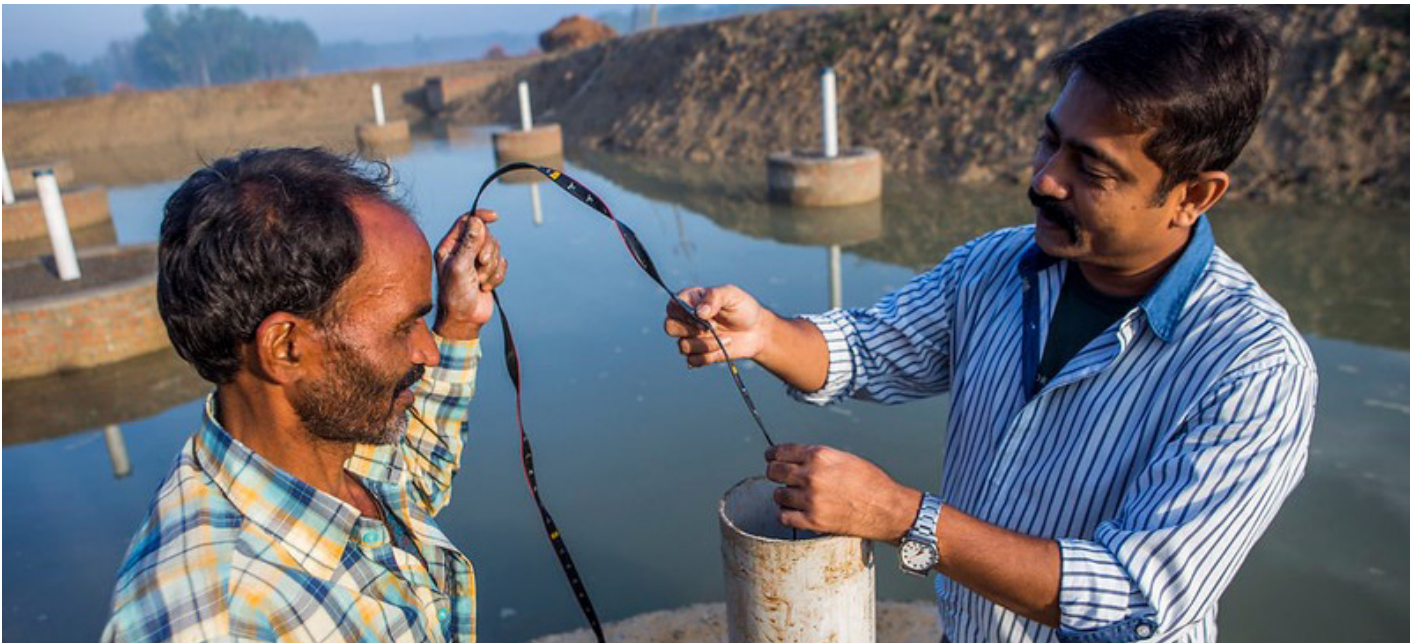
Figure 3. The pilot site established to test the Underground Transfer of Floods for irrigation (UTFI) approach in Jiwai Jadid village, Rampur district, Uttar Pradesh, India.