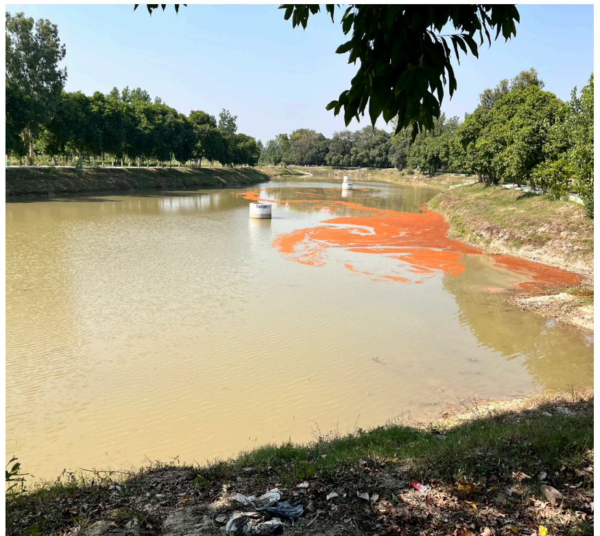
Singan Khera recharge site, Rampur district, Uttar Pradesh, India, established under the Mission Amrit Sarovar.

Global assessments reveal a vast potential with over 15 million square kilometers (11% of the world's land area) potentially suitable for MAR. Given the substantial benefits and opportunities MAR offers, it is essential for policymakers and practitioners to accelerate its implementation in developing countries as a tool for enhancing climate resilience. The evidence and guidance provided in this brief and related documents offer valuable support for this effort. Concrete steps are outlined to help developing countries lay the groundwork for successful MAR implementation, thereby strengthening their climate adaptation strategies.