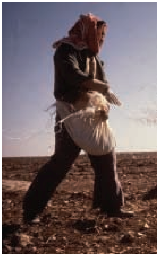
A farmer in Jordan sows pasture crops. Tapping the traditional knowledge of farmers should help improve livelihoods.

As in so many parts of the world, genetic diversity is under threat, and for all the usual reasons: intensification of agriculture, changed patterns of land use, physical erosion. Older landraces and wild varieties, which were widely planted in the past, are in decline. Farmers no longer grow the semi-wild wheat and barley landraces that they used to. Local olive and fig selections are also being abandoned, as are the wild plums and staples of the vegetable garden, such as watermelons and onions. Farmers cite droughts and water scarcity—springs have dried up and flows in some rivers are greatly reduced—as driving the shift away from old and traditional crops. They prefer improved varieties of just a few cash crops, to sell in the markets, and they say that these represent a better use of the available supplies of water.