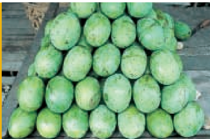
Mangifera odorata on sale at a roadside market stall.