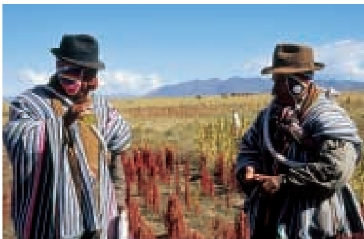
Community leaders in Takaka, on the altiplano of Bolivia, helped organize their participation in an evaluation of cañahua, an Andean grain related to quinoa.

Although the meeting was small—just 35 participants—it brought together the leading people in participatory plant breeding from the Future Harvest Centres and, as would be expected given the topic, expertise from farmers' organizations, non-governmental groups, university departments, development workers and national agricultural research systems. A