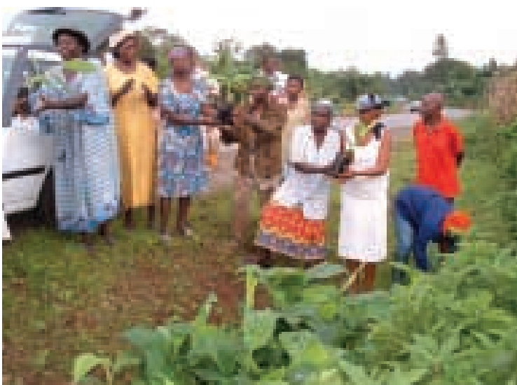
Women from the village of Loum 99 in Cameroon gather to unload healthy plants supplied by the project. A. Nkakwa Attey

A package of new varieties, new technologies and new approaches to marketing will improve the livelihoods of banana growers in Africa.