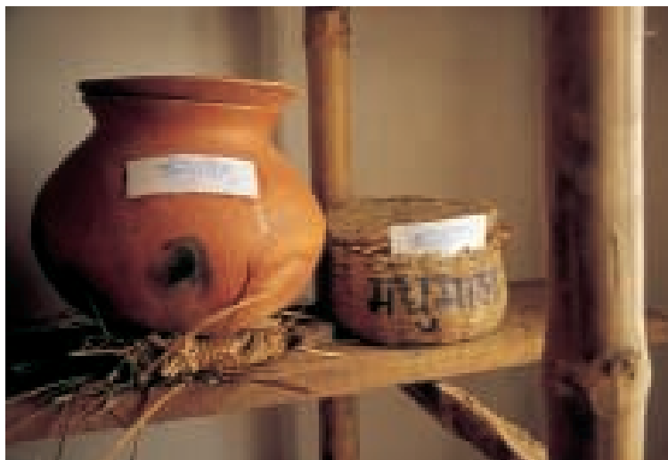
Farmers not only still grow traditional varieties in Bara, Nepal, but they also store them in traditional clay pots, sealed with animal dung to keep insects out.

But only in favourable environments—those where farmers have access to productive,