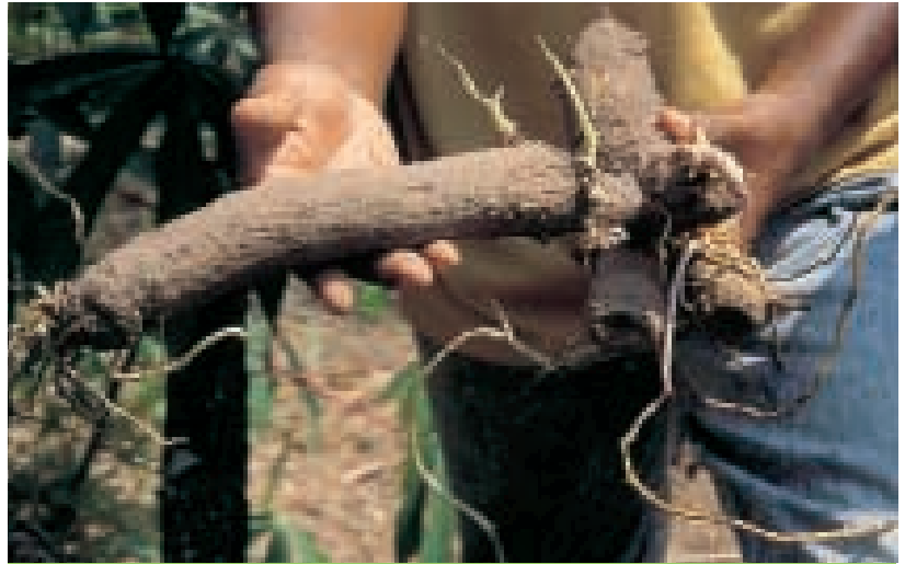
Domesticated yams, as seen here, have thicker tubers and less thorny stems.

Farmers do not actually appreciate that yams produce true seed and that they are using selection from true seed as a method to create and select improved clones. This offers great opportunities for improving the yam crop through participatory breeding. Already one researcher from the University of Benin has established a non-governmental organization specifically to work with farmer-breeders. In the future, one can imagine breeders making deliberate crosses of favoured cultivars in order to supply farmers with seed to assess and domesticate. Farmers, too, can be taught about true seed and encouraged to think of ways to incorporate this knowledge in their individual breeding efforts. Either way, the close study of domestication as practised by the yam farmers of Benin indicates not only the value of maintaining diversity in the areas around the farms, but also the vital part that their domestication plays in securing their food supply and improving their livelihoods.