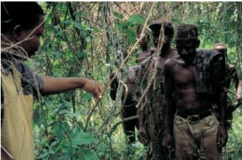
Farmers in Benin examine the thorny stems of a wild yam.

each harvest the tubers of the individual plants that most nearly approach their ideal of a domesticated variety and plant these the following year. The study could find no relationship between the methods used and any aspect of the outcome.