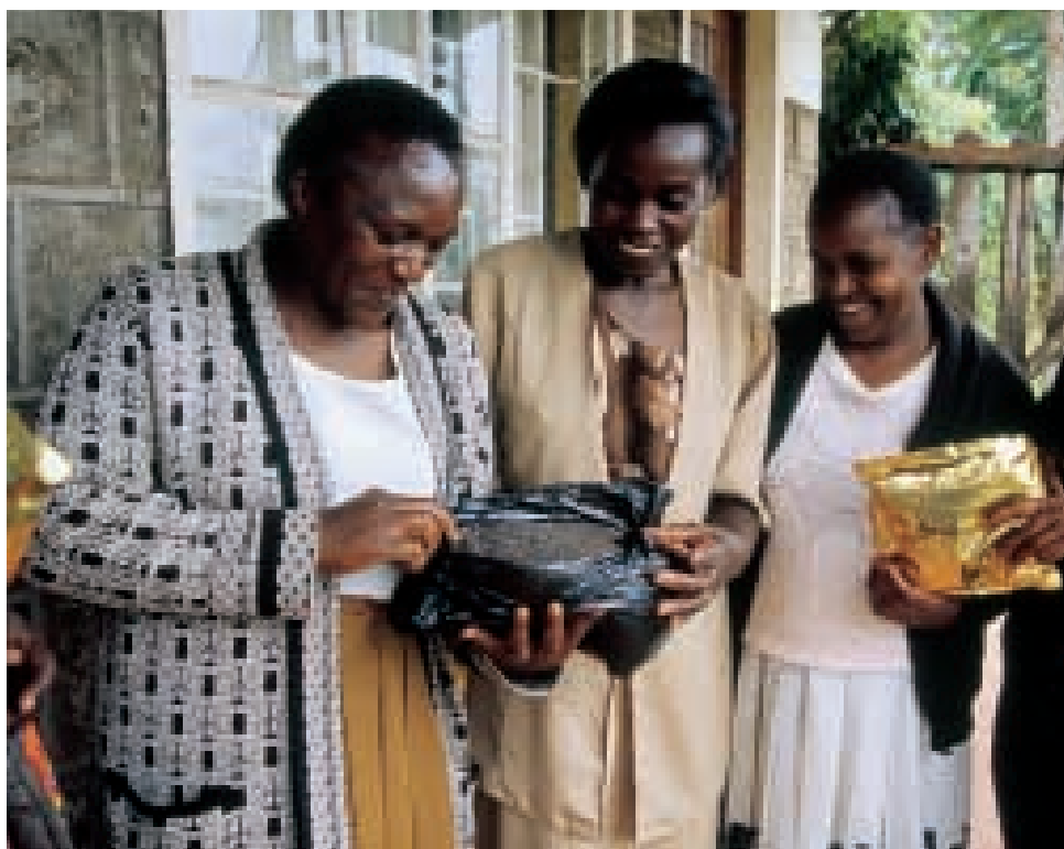
The Karanje Limuni Women's Seed Saving Group in Santa Monica, Kenya, is helping to ensure that people can buy good seed of local leafy vegetables.

health, with the incidence of obesity and diseases such as diabetes and heart disease growing dramatically among the urban poor. In diet, as in agriculture, diversity is often of value in its own right. A rounded nutritional strategy will make use of a mutually reinforcing cycle of improvement.