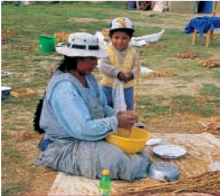
Workers clean seed before it enters the national Andean Grain genebank in Peru.

The IPEE will decide the preferred legal status, governance and financial mechanisms for the Trust, based on consultations with a large number of governments, individuals and organizations, South and North. The Interim Panel will also decide upon questions like the proper balance to be achieved in the allocation of funds. The Panel will hold its first meeting in early 2003. (Further information on Trust governance can be found at http://www.startwithaseed.org/pages/governance.htm .)