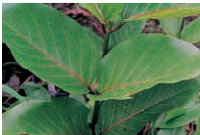
The leaves of Nauclea latifolia are valued in Togo for their medicinal properties.

A. africana is broadly distributed while K. senegalensis is restricted to the northern part of the country. Both species are used primarily to feed animals, by lopping branches, although they are also used for timber and medicinal purposes. The level of threat varied