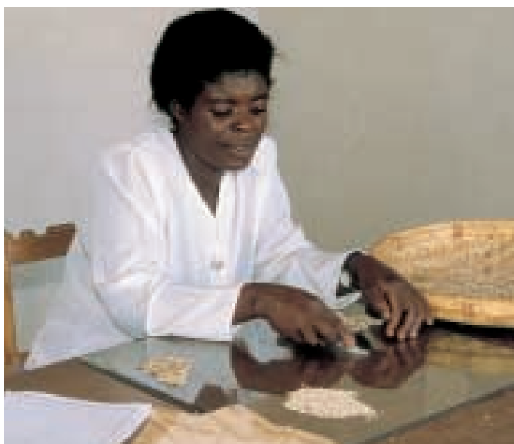
At a community genebank in UMP District, Zimbabwe, local people clean the seeds before storage. The Trust encourages genebanks to work with farmers.

The study drew largely on information gathered by FAO in 2000 from about 100 countries. Its findings were alarming: not only is crop diversity disappearing from the fields, but also a large proportion of the crop resources 'safeguarded' in genebanks around the world could soon be lost due to lack of funding. The report found that while the number of samples held in crop collections has increased in 66% of countries since 1996 (the last time FAO gathered such data), genebank budgets have been reduced in 25% of countries and have remained static in another 35%. Not surprisingly, the majority of budget cutbacks have taken place in the poorest countries, which are home to the diversity of the world's most critical crops.