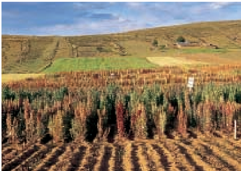
In Bolivia Fundación PROINPA holds 2727 varieties of quinoa. All are being evaluated to see which would be most useful.

One important objective of the study is to make sure that local people can improve their livelihoods in a sustainable way by working with the target species. The people at the start of the process of agricultural production are the ones doing the vital work of maintaining and growing the diversity, and yet at present they reap very little of the rewards for doing so. An earlier case study of the fililière , or commodity chain, for capers in Syria brought to light some of the problems. Picking wild capers is typically a job for young children in marginal areas. They get about Euro 0.70 a kilogram from intermediaries, who do a little preliminary processing and then sell the capers to a Syrian trader for about Euro 1.30 per kg. The Syrian trader sells to a Turkish trader for about Euro 2.00 per kg. The Turkish trader does the final processing and packaging and sells into the European Union market, where consumers pay the equivalent of about Euro 27.00 per kg. That is a final markup of more than 3800% from the child gathering the capers to the shopper in the supermarket. If just a little more of that could be passed back to the families it would make a