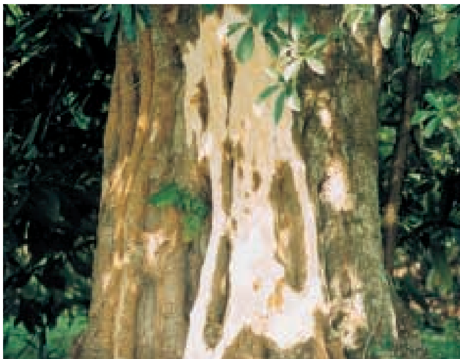
Debarking specimens of Alstonia boonei for medicinal use is a serious threat in Togo.

At the end of 2002 the following countries had appointed national coordinators and participated in one or more of SAFORGEN's activities: Benin, Burkina Faso, Chad, Congo (Brazzaville), Ethiopia, Gambia, Guinea, Kenya, Madagascar, Mali, Niger, Senegal, South Africa, Sudan, Togo and Uganda.