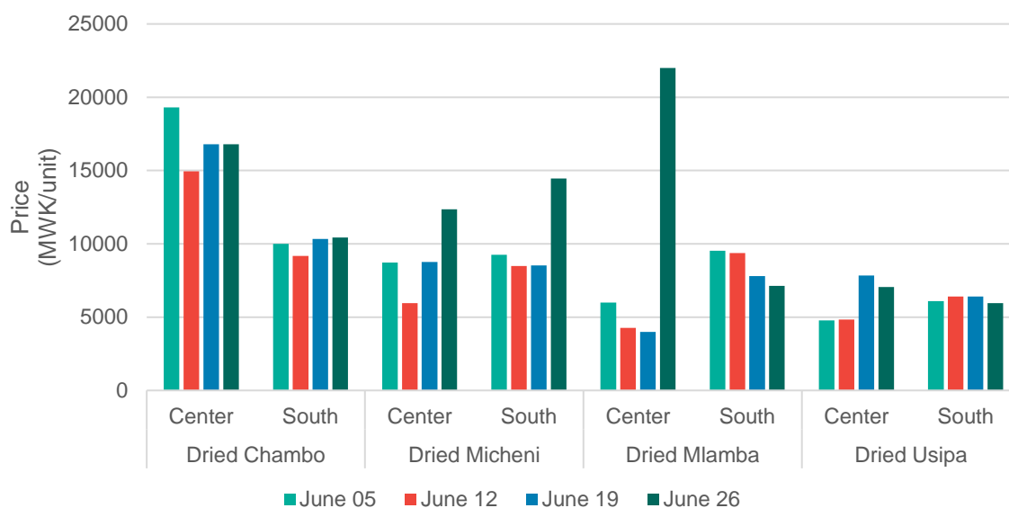
Table 4. Retail prices of dried Chambo and dried Micheni (MWK/unit) during June 2021