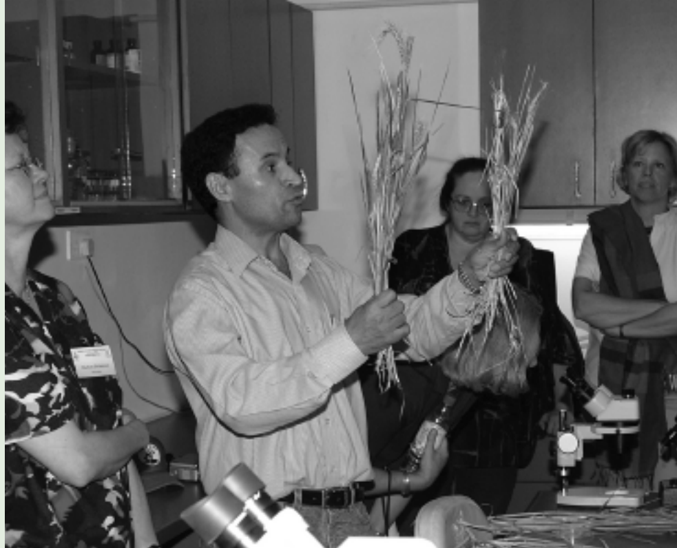
Science Council members and observers during a tour of ICARDA, May 2004.