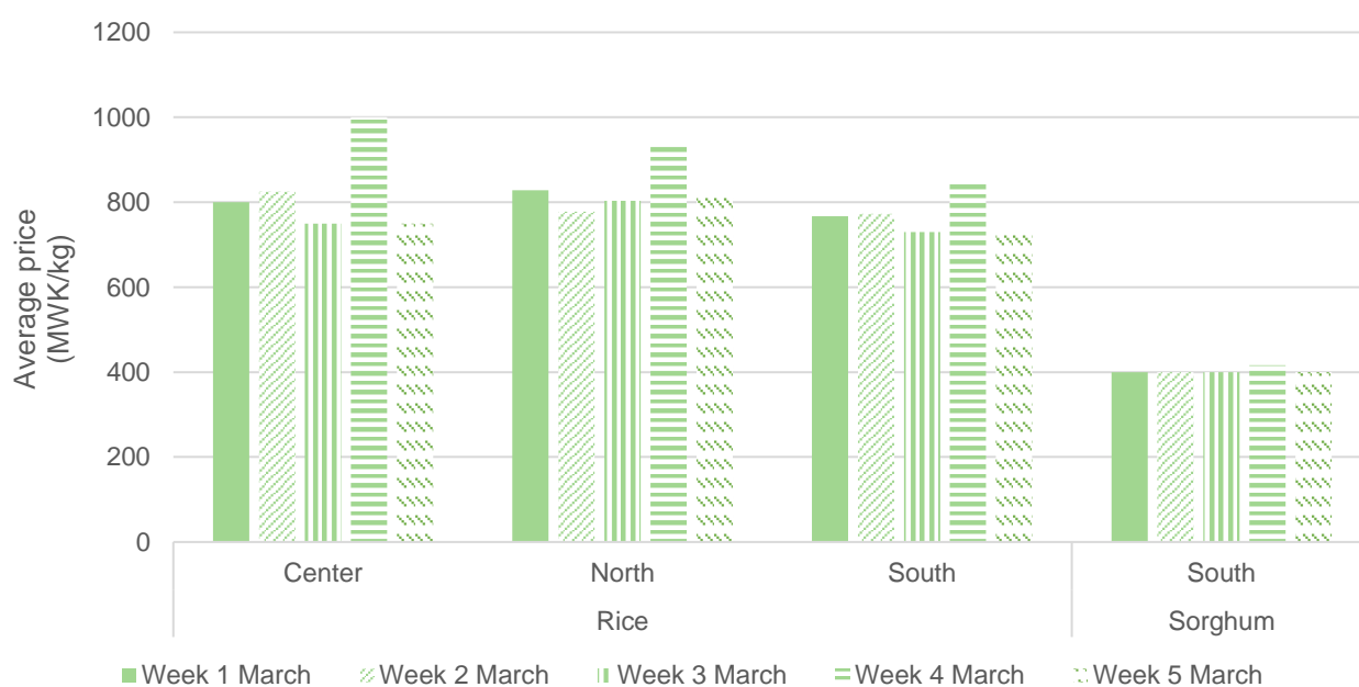
Figure 2. Regional average retail prices (MWK/kg) of rice during March 2022