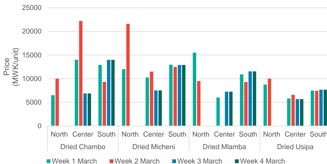
Figure 3. Retail prices of dried Chambo, dried Micheni, dried Mlamba and dried Usipa (MWK/unit), March 2022

Note: Chambo, mlamba and micheni (dried and fresh) are priced per dozen; usipa (dried and fresh) is priced per 5-liter bucket