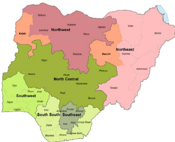
Figure 1: Geopolitical zones and states of Nigeria, with Kebbi and Bauchi states highlighted

Although the qualitative fieldwork was done in Kebbi and Bauchi states, the terms of reference for the study specified it should be undertaken with