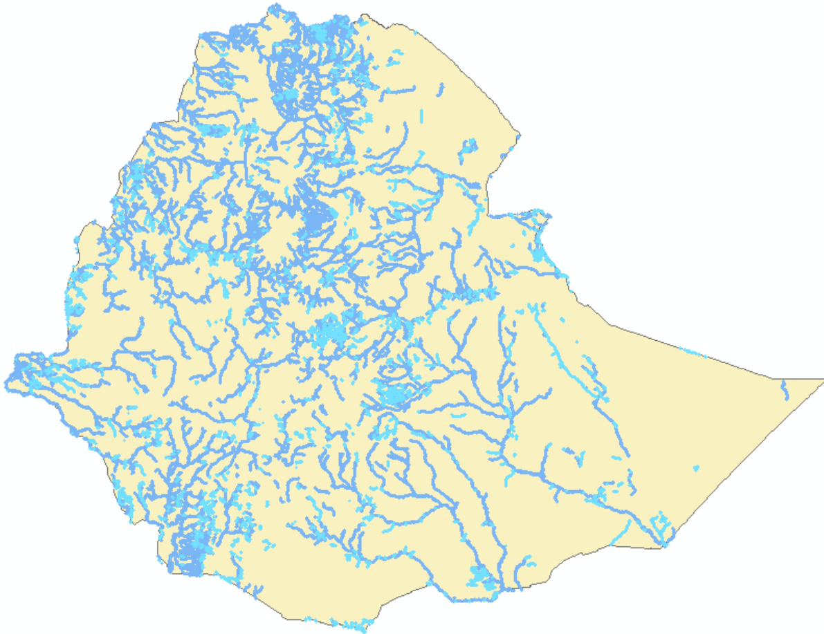
Figure 1. Distance from rivers and streams of sampled households in 2019