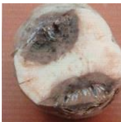
Fusarium root and stem rot

Fusarium root and stem rot, caused by the fungus Fusarium solani , is a common field and storage rot. The rot extends deep into the sweetpotato and is firm and dark tan in color. Internally, elliptical cavities form in which a white mold develops.