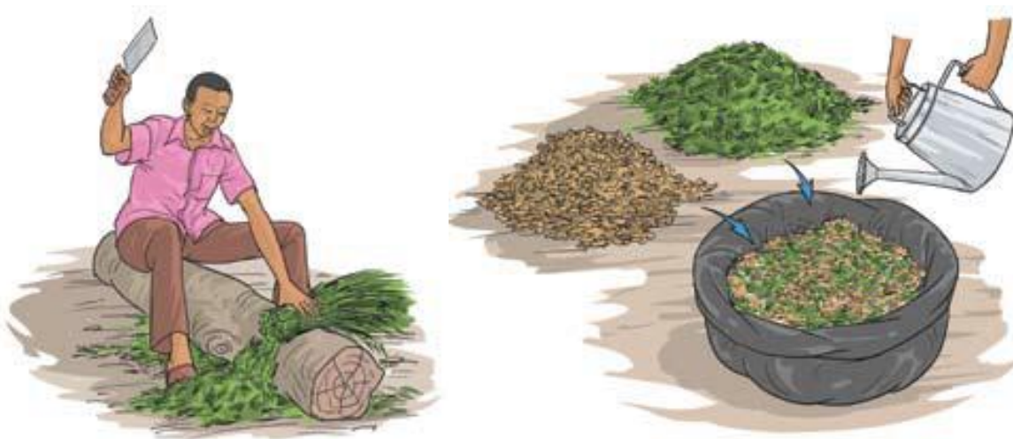
Figure 10: Preparing sweetpotato vines and roots for ensiling

To prepare the material for ensiling, chop the sweetpotato vines and roots to be ensiled into pieces not more than 2.5 cm long (Figure 10). A motorized chopper can be used