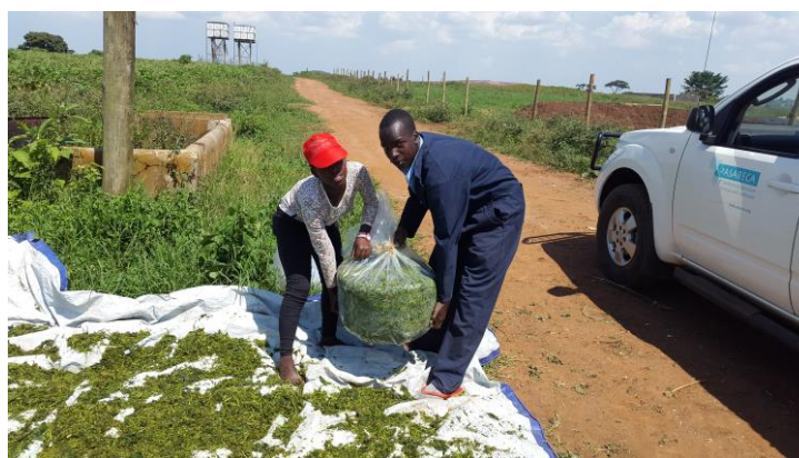
Figure 3: Silage making using plastic bags

Table 5 shows estimated cost of materials required to produce 500 kgs using trench silo method. The calculations are based on the assumption that the farmer gets the vines from her/his field.