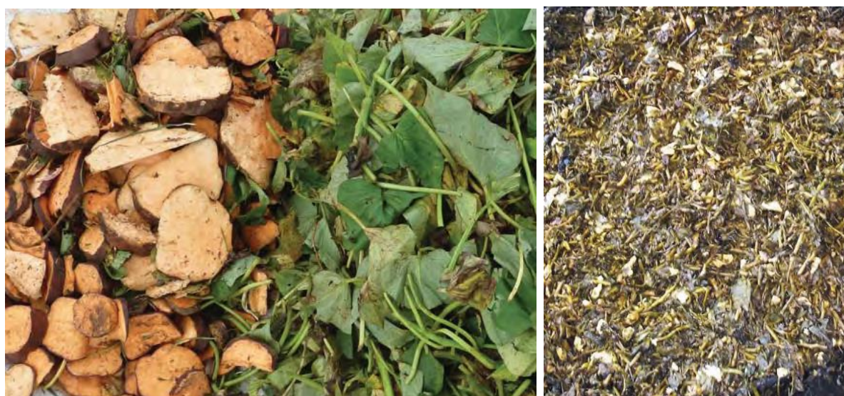
Making high quality sweet potato silage