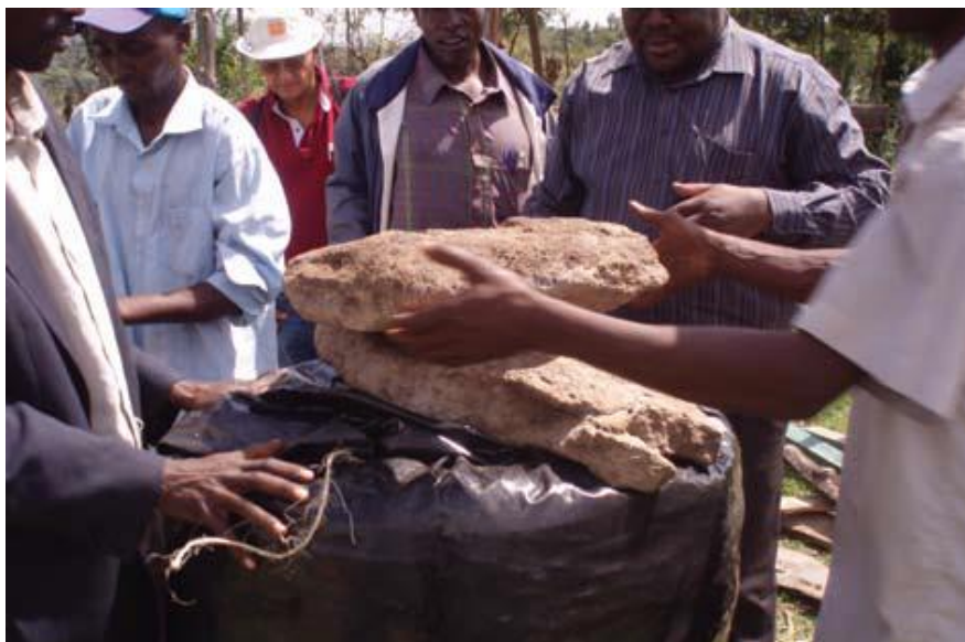
Figure 13: Sealing the tube after ensiling

Bunch the excess tubing at the top together, remove all excess air so the plastic is in touch with the ensiled material and tie a tight knot, using the twine. Place heavy stones on top of the silo to ensure continued compaction during fermentation (Figure 13).