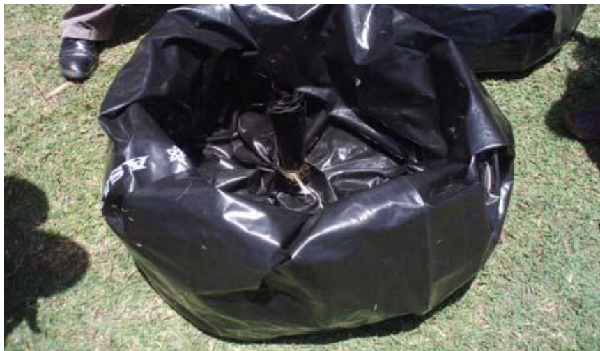
Figure 6: Sealing the bottom of the silage tube

To make a good seal at the bottom of the silage tubing, first open up the tubing. Then on one open end (that will be the bottom of the tube), make even pleats about 20 cm long starting from the end towards the centre on each side of the tubing. Then twist the pleats together and tie off with the rope making a strong knot. Then turn the tubing inside out, so that the tied knot is on the inside (Figure 6).