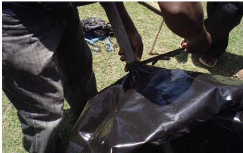
Figure 7: Making the external drainage system of the silage tube