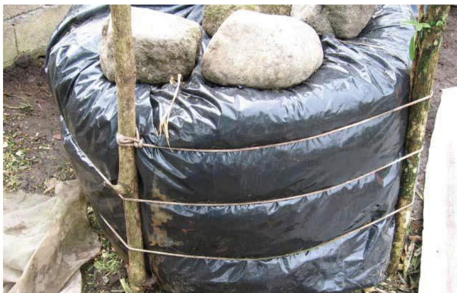
Figure 14: Anchoring the silage tube firmly on the ground

Remove the rods to remove the compacting drum. Anchor the filled tube silo with three poles to prevent the silo from collapse due to drainage of excess effluent from the silo (Figure 14).