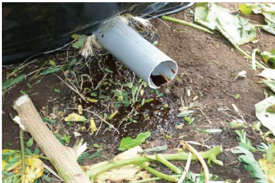
Figure 15: Removing excess effluent from the silage tube

For the first five days, open the drainage tap daily and leave open until all the effluent comes out, then close (Figure 15). Then open the tap every 4 to 5 days thereafter and let any effluent come out. Fermentation is usually complete after 30 days.