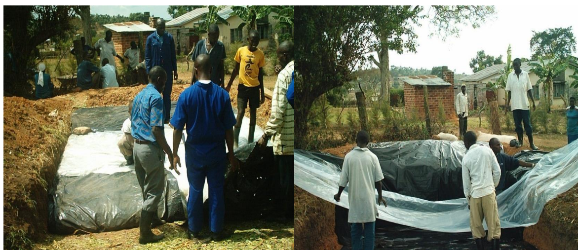
Covering the silo pit