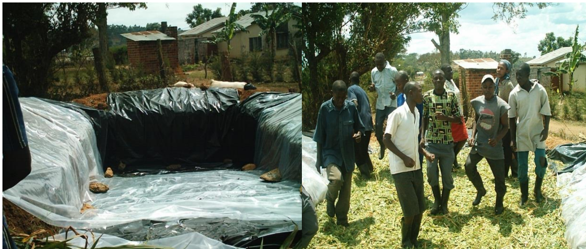
A silo pit

A trench silo can be built by simply digging the ground, but it is better to place plastic sheets inside to prevent loss (Figure 2).