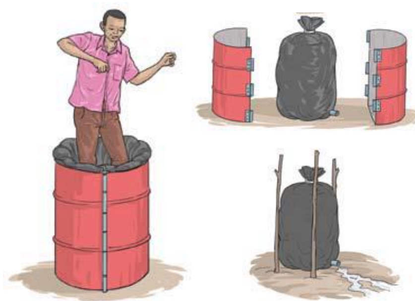
Figure 12: Compacting the sweetpotato vines and roots in the tube

Fill the tubing with alternate layers of the chopped vines and roots and the molasses/water mixture. Each layer of vines and roots should be 20 to 30 cm high; then sprinkled with the molasses mixture until it is thoroughly wet on top. Each layer must be compacted before adding the next layer. One person can compact using feet as shown in Figure 12.