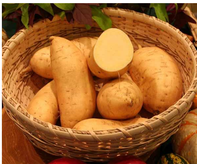
Orange Fleshed Sweet Potato