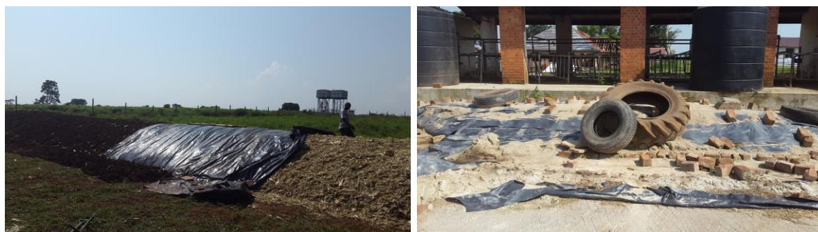
Figure 1: Stack silo