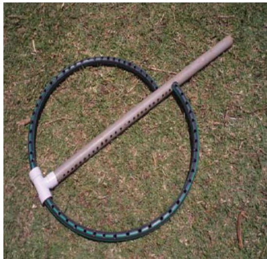
Figure 5: Assembling the internal drainage system for the silage tube