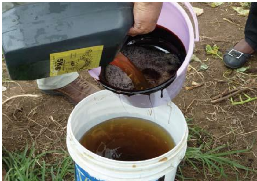
Figure 11: Preparing molasses