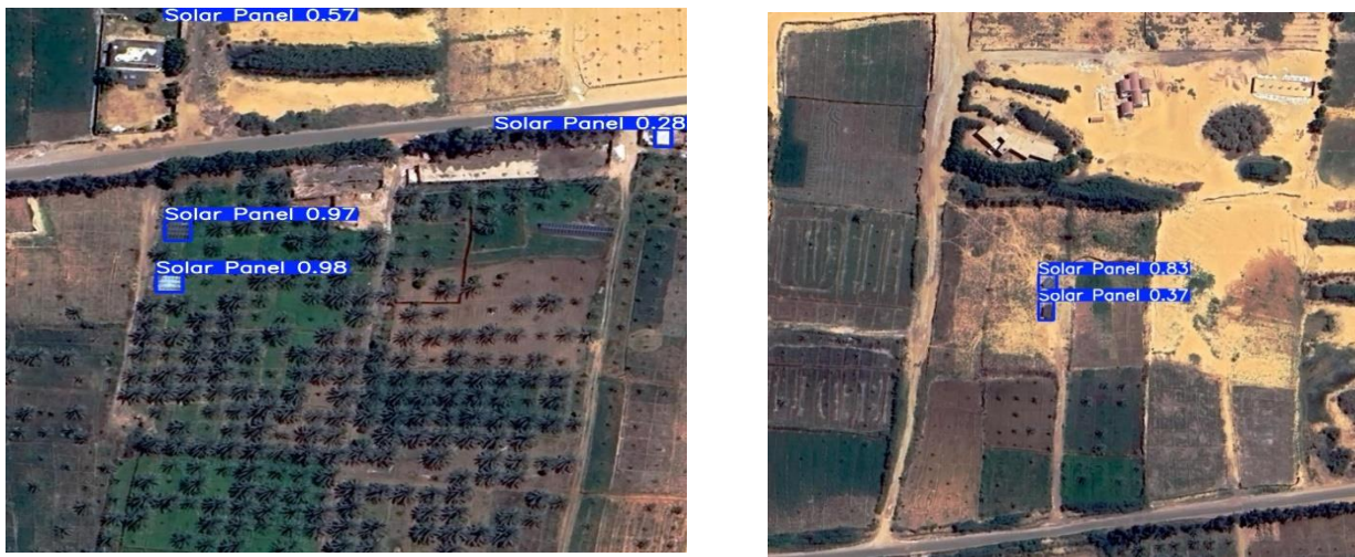
Figure 3. Examples of prediction scenarios on test data with accuracy percentage.

Note however that some tiles produced no detections, while others included occasional false positives. These instances underscore the inherent challenge of detecting very small objects in heterogeneous rural environments. Nevertheless, the model consistently identifies true photovoltaic installations where present, validating the approach. Importantly, these results should not be interpreted as a final accuracy benchmark; instead, they demonstrate that regional-scale solar irrigation mapping is attainable once representative training data are incorporated, a goal achievable through the iterative workflow demonstrated here.