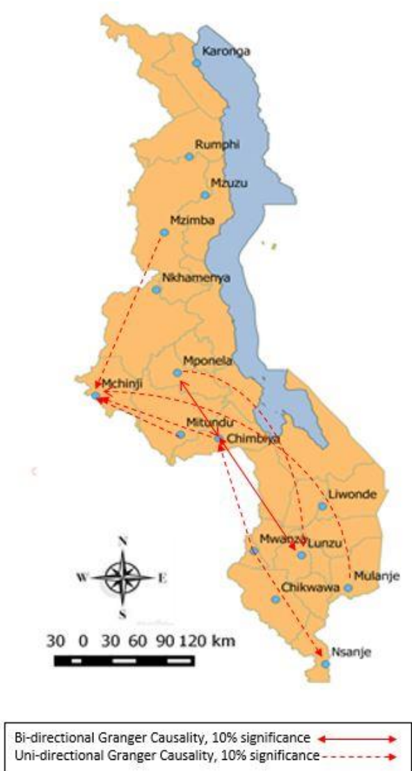
Figure 3. Price linkages between markets

Although it is not a particularly large market, Chimbiya market (near Dedza) appeared to occupy a strategic position in the price formation process. Chimbiya’s importance in the price formation process was also confirmed by interviews with traders in southern Malawi, who stated that they regularly procured from Chimbiya rather than nearer wholesale markets because traders in Chimbiya offered more competitive prices and were more flexible regarding delivery volumes. Mchinji and Mwanza also played important roles in the formation of maize prices. Both are border towns, through which significant yet unquantifiable flows of maize are known to have entered Malawi during late 2016 and early 2017 (FEWS NET 2017).