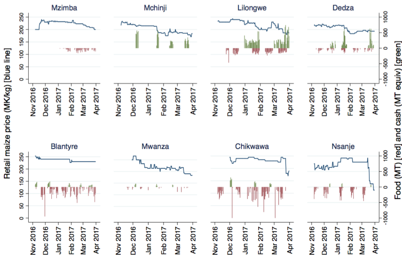
Figure 2. Time series plots of daily maize prices, cash, and food distribution in selected markets, Nov 2016-March 2017