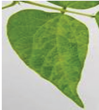
Cowpea mottle virus.