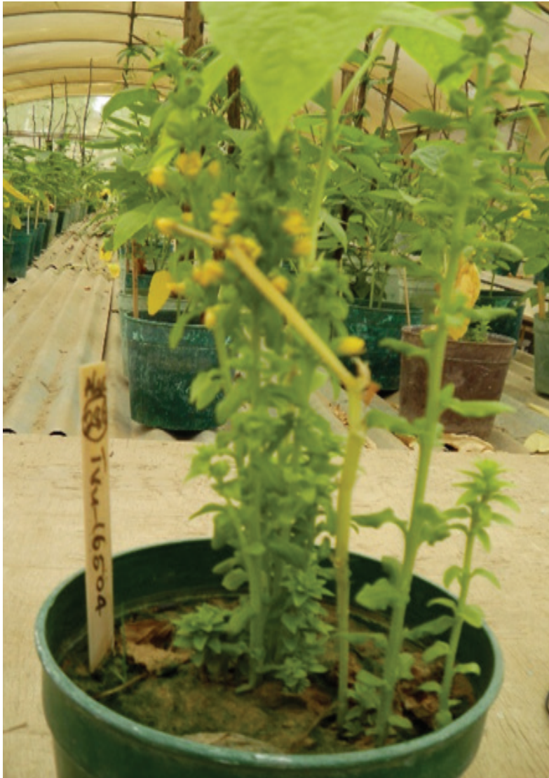
Alectra vogelii parasitizing cowpea.

variety is an effective and affordable option for the control of Striga and Alectra . Many varieties that are completely resistant to Striga and Alectra have been developed and are available in Nigeria.