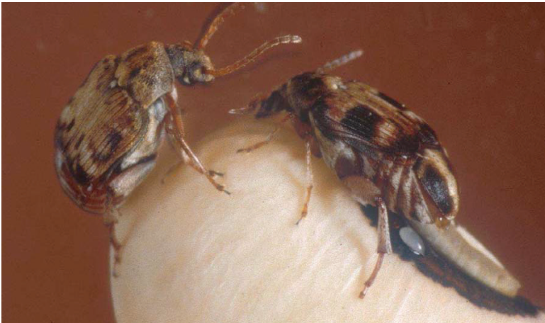
Cowpea weevils laying eggs on cowpea seed.

The cowpea weevil, Callosobruchus maculatus (Fabricius) is a cosmopolitan field-to-store pest that begins its attack shortly before harvest and continues in storage where it develops. The adults lay their eggs on the seeds, and the larvae bore into grains, feeding on the cotyledons and causing substantial losses. The damage affects the quality of the seeds and taints the taste of the crops, thus affecting the market value. This beetle is responsible for most of the losses which occur in stored cowpea seeds. The damage can be controlled by packing cowpea or grain in PICS bags for either short or long-time storage.