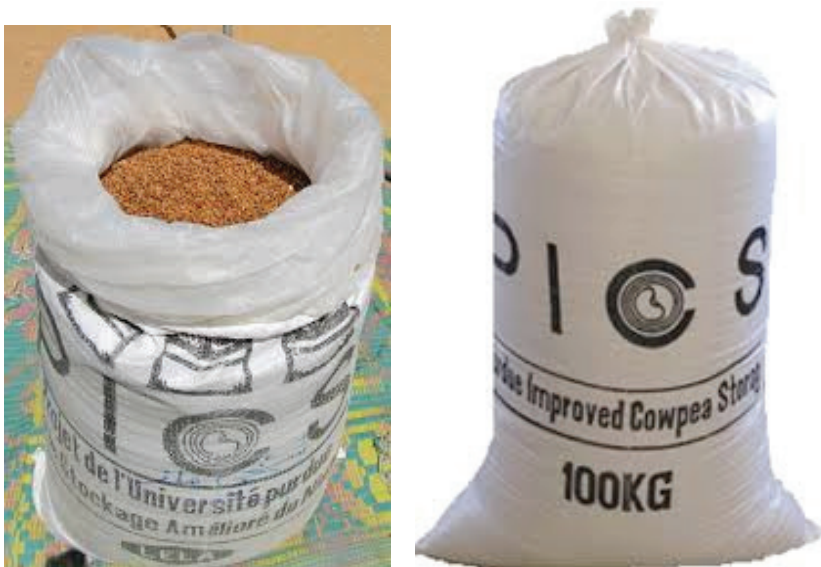
Figure 9. Cowpea storage in triple PICS bag.

Good storage prevents losses and maintains grain quality. Before new produce is brought in, repair all cracks in walls, floors and roofs to deny pests any hiding places; dust the stores/ granaries with appropriate contact insecticides such as Permethrin or Pirimiphos Methyl before storing produce. The method known as the Purdue Improved Cowpea Storage (PICS) bag uses non-chemical, hermetic storage. The PICS bag is composed of three layers: two inner layers of high-density polyethylene and an outer layer of ordinary woven polypropylene. This triple bag technology has been introduced in Nigeria, where farmers are exposed to harmful chemicals while protecting their cowpea grain against insects. The PICS method works by sealing cowpea in an airtight container; this which kills all the adult insects and most of the larvae within days. At the same time the triple bags keep the remaining larvae dormant and unable to damage the seeds (Fig. 9). With the introduction of the PICS bag, cowpea can be stored without the use of hazardous chemicals, and rodents kept away.