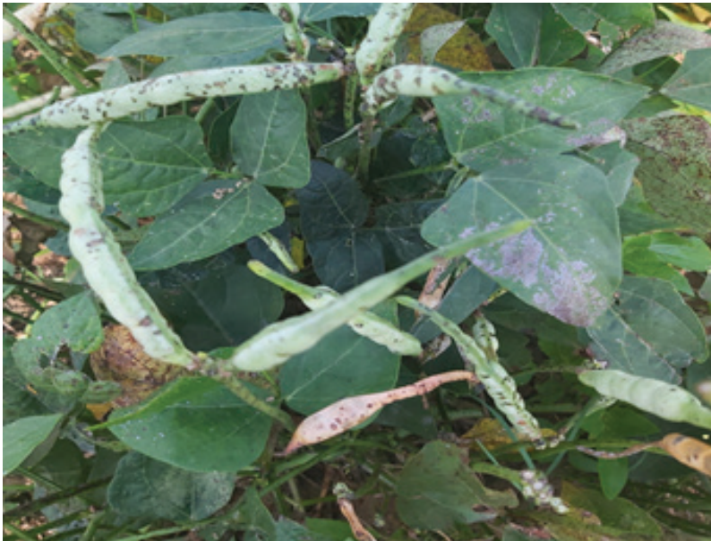
Cowpea pod infected with Scab.

Cowpea scab disease is caused by the fungi pathogen known as Sphaceloma sp. The disease is widespread in tropical Africa and is seed-borne and a major disease in savanna areas. The disease affects all plant parts above the soil, causing up to 100% yield loss. Symptoms of leaf infection include the appearance of spots on both leaf surfaces and cupped, small greyish lesions along the vein. Infected stems show oval to elongated silver-grey lesions, egg-shaped white spots surrounded by red or brown rings on the stem, and pit-like spots with grey powder surrounded by brown borders on pods. When the infection is high, leaves, stems, and pods alike are heavily spotted, plants remain small, and leaves, flowers, and pods drop before maturing. Chemical control may be effective by treating seeds with Mancozeb at the rate of 80 g/kg of seeds. However, the most effective means to control economic losses from scab is using cowpea varieties with genetic resistance/tolerance to the disease.