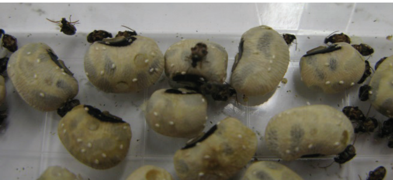
Cowpea seed damaged by weevil.