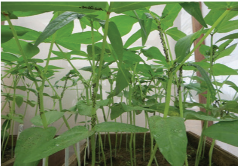
Cowpea plant infested by aphids.

The most damaging pre-flowering insect pests of cowpea are aphids ( Aphis craccivora ), and whiteflies ( Bemisia tabaci ).