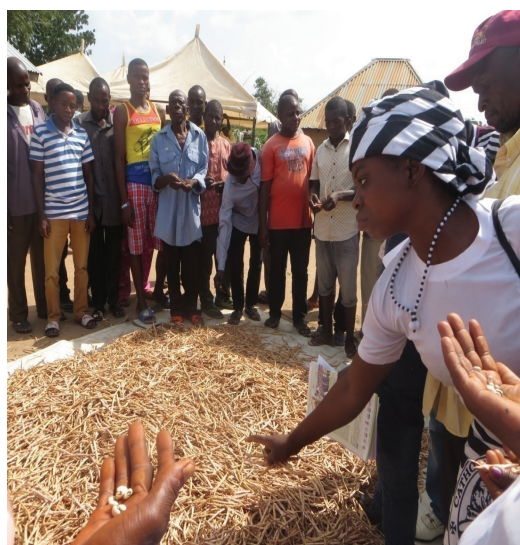
Figure 6. Sun-drying of harvested cowpea pods to reduce moisture before threshing.