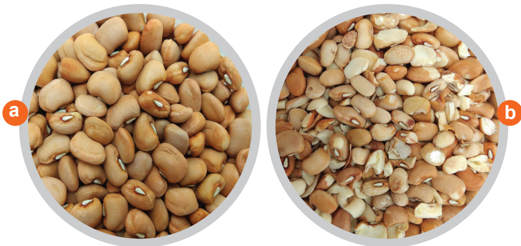
Figure 2. (a) Good seeds for planting and (b) Bad seeds for planting.