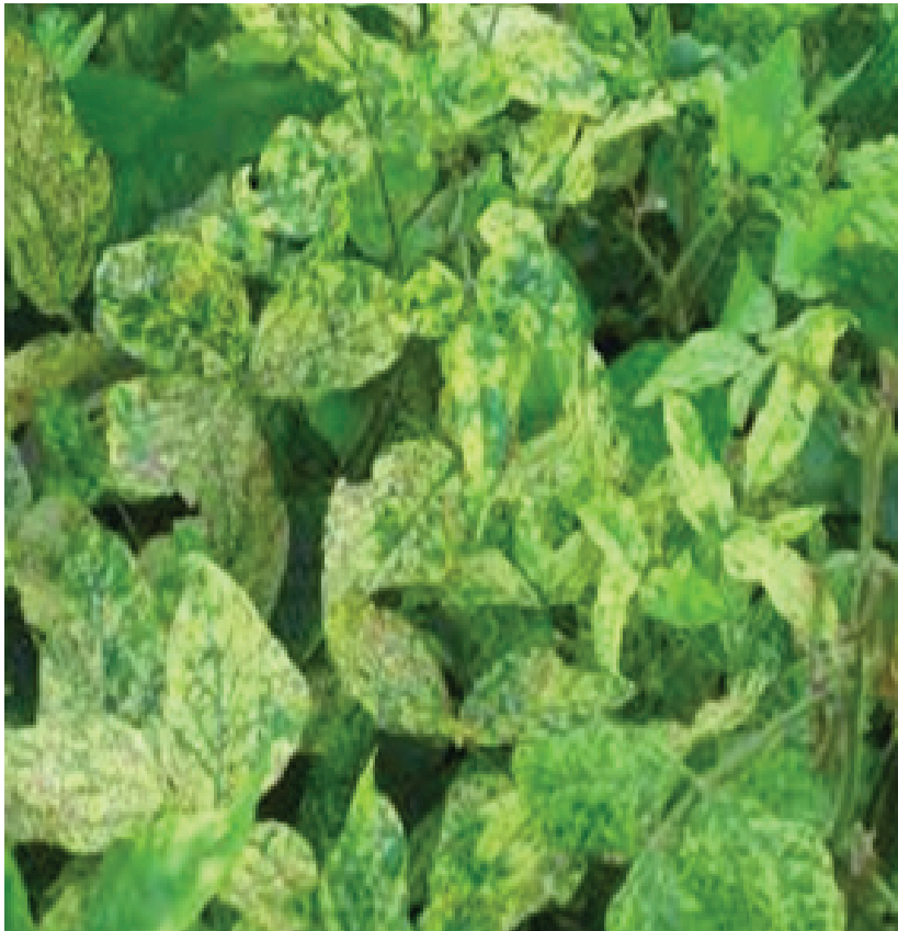
Cowpea yellow mosaic.

Whiteflies cause direct damage and weaken plants by sucking sap and removing nutrients. The leaves become mottled and yellowish. Damage may be more severe when plants are under water stress. Infested plants may wilt, turn yellow, become stunted, or die when infestations are severe or of long duration. Whiteflies not only cause direct damage to the plant but also act as a vector in transmitting Cowpea yellow mosaic virus . The adults are small with white wings, which are densely covered with a waxy powder. Nymphs are black and round or oval. Chemical control can be effective when appropriate insecticides are used. See Table 7 for a list of chemical insecticides to control this pest.