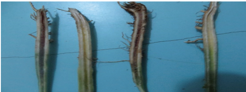
Cowpea stem infected with Fusarium wilt.

Fusarium wilt (FW) is caused by the fungal pathogen, Fusarium oxysporum f.sp. tracheiphilum ( Fot ). It is one of the diseases that pose a major threat to cowpea production worldwide. The disease causes substantial yield losses ranging from 50 to 100%. The occurrence and epidemic spread of this soil-borne disease are influenced by factors such as soil nutrient levels, temperature, and moisture stress. The fungal pathogen F. oxysporum has a wide host range, encompassing plants in the Leguminosae, Malvaceae, and Solanaceae families and causes vascular wilt. The pathogen enters the plant through the root system and invades the vascular tissue. Infected plants exhibit a reduction in plant growth, leaf chlorosis, wilting, and vascular discoloration, which result in the death of infected plants with severe overall yield loss. Broad irregular patches of affected plants are visible in infested cowpea fields. The disease is a soil-borne and seed-borne fungus that is difficult to manage through fungicide applications alone. The most cost-effective and environmentally safe control is the use of resistant cultivars when they are available.