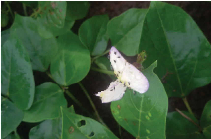
Thrips on cowpea flower.

The most damaging flowering insect pests of cowpea are thrips , ( Megalurothrips sjostedti Trybom.) and Maruca . They are frequently responsible for total crop loss. The adults are tiny black slender insects with two pairs of feathery wings. Both adults and the wingless larvae (nymphs) are attracted to white, yellow, and other light-colored flowers. The pest feeds on flower buds and flowers. Attack during the pre-flowering period may damage the terminal leaf bud and bracts, causing the latter to become deformed with a brownish-yellow appearance. Severely infested plants do not produce any flowers. When the population of thrips is very high, open flowers are distorted and discolored. Flower buds and flowers fall prematurely without forming any pods. Yield losses from this insect pest have been estimated at between 20 and 100%. The current management of thrips relies on chemical control with insecticides or the use of a tolerant variety. See Table 7 for a list of chemical insecticides to control this pest.