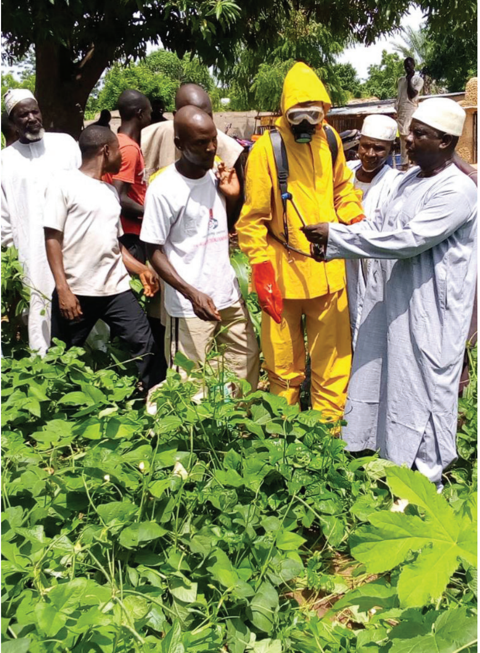
Figure 4. A Research officer giving instruction on type of nozzle to be used.