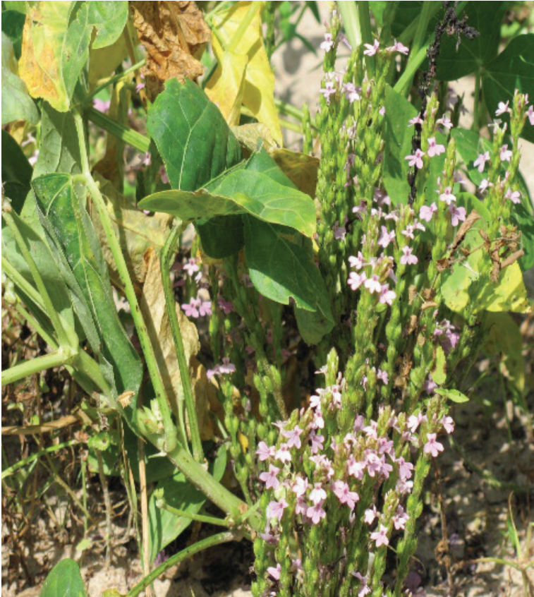
Striga gesnerioides parasitizing cowpea.

seedling. It causes stunting, wilting and yellowing between the veins of cowpea leaves, resulting in the death of infested plants. The problem becomes worse when soil moisture is limiting.