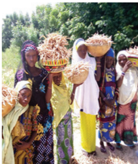
Figure 5. Harvested mature pods of IT99K 573-1-1.

Cowpea must be harvested as soon as the pods are fully mature and dry to avoid an infestation in the field because most of the storage pests are from-field-to-store pests. Harvesting is done by handpicking the pods (Fig. 5). For early maturing and erect varieties, one picking may be sufficient. For indeterminate and prostrate varieties, the dried pods can be picked two or three times as they do not mature at the same time because of the staggered flowering period. After harvest, sun-dry the pods on a platform or tarpaulin for proper drying before threshing (Fig. 6). Thereafter, thresh the pods and winnow to separate the seeds from the chaff or haulms. The seeds are further cleaned to remove debris and those that are broken and packed in plastic bags for storage.