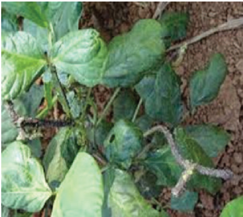
Cowpea aphid-borne mosaic virus.

Aphis craccivora feeds by piercing the plant tissue and sucking sap from the under-surface of young leaves and stem tissues, and on the pods of mature plants. The cowpea aphid causes economic losses both directly by sucking sap and indirectly through the transmission of viral diseases. It not only causes direct damage to the plant but also acts as a vector in transmitting Cowpea aphid-borne mosaic virus and Cucumber mosaic virus . Aphids excrete large quantities of a sugary substance called honeydew, which supports the growth of sooty mold. This mold, a fungus, is dark-colored and reduces the amount of sunlight that reaches the leaf. The honeydew produced on the plant is evidence of aphids feeding on the crop. Mild damp weather favors the development of aphid populations. Chemical control can be effective when appropriate chemical insecticides are used. See Table 6 for a list of chemical insecticides to control this pest.