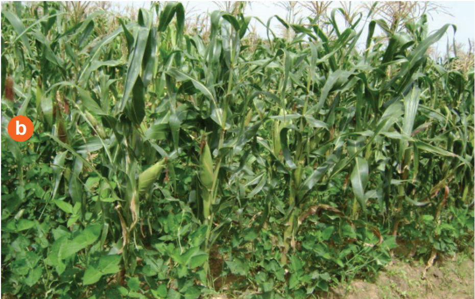
Figure 3. (a) Maize + cowpea strip intercropping. (b) Cowpea relayed into maize.