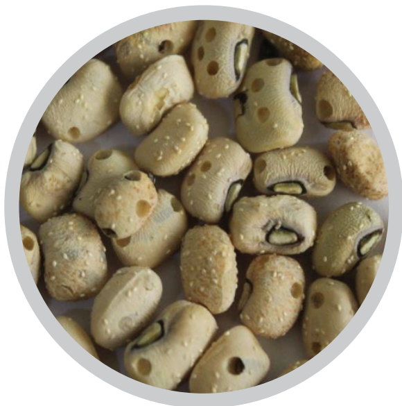
Figure 8. Poorly stored cowpea seeds (damaged by weevils).

One of the biggest challenges that confront grain farmers and merchants is how to effectively store their products. The most important storage pest of cowpea is the weevil (bruchid) called Callosobruchus maculatus . Severe infestation can lead to total grain loss in storage. It is a pest from-field-to-store; adult beetles lay eggs on pods (in the field) or on seeds (in storage). After hatching, the larvae develop within seeds and eat up the cotyledon, thereby causing extensive damage. Adults emerge from the seeds through holes made by the larvae that make it easy to recognize infested seeds (Fig. 8). Adopt store hygiene and fumigation and use airtight containers to control bruchids.