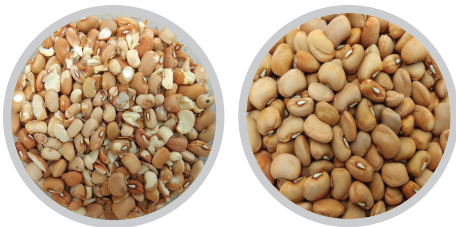
Figure 7. Cowpea seeds (a) not properly cleaned and (b) properly cleaned.

Clean out the store thoroughly before a new crop is loaded. Old residues should be burned. Only well-dried and properly cleaned seeds should be stored (Figs 7a and 7b). The safe moisture content for storage is 7–8%; such seeds make a cracking sound when crushed between the teeth. High moisture content and high humidity during storage decrease seed viability. There are various hermetic products for storage; the main one is PICS bags (multi-layer, made of 2 polyethylene bags), but plastic bottles and clay pots are also used.