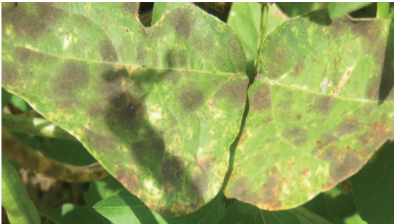
Cercospora leaf spot infected leaves.

The disease symptom on infected plants presents necrotic spots on the upper leaf surface and profuse masses of conidiophores and conidia, appearing as downy grey to black mats, on the lower leaf surface. CLS disease is seed-borne and seed transmitted. The most effective means to control economic losses from CLS is using cowpea varieties with genetic resistance to the disease.