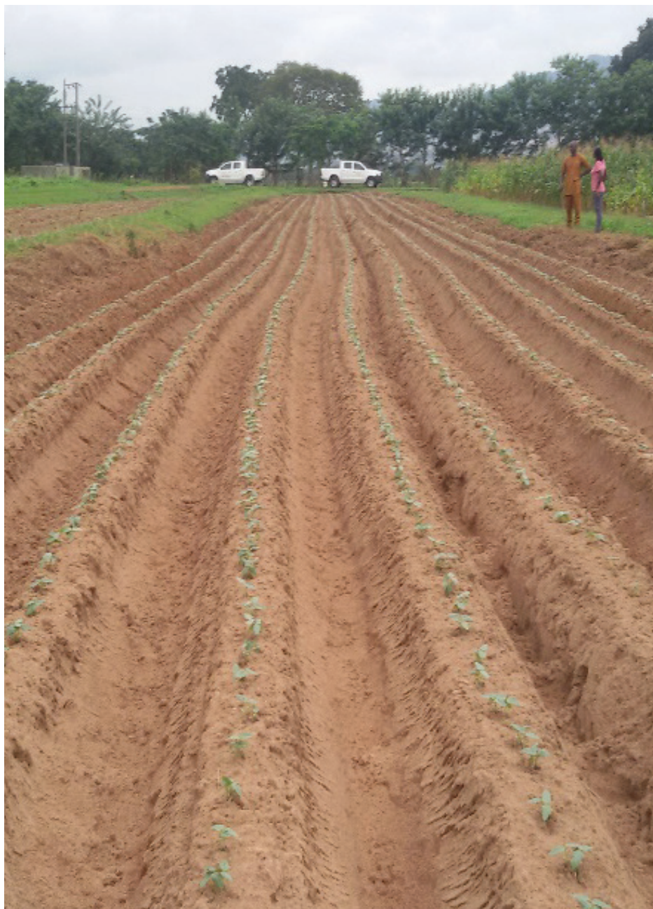
Figure 1. Cowpea planted with hand on a well-prepared field.