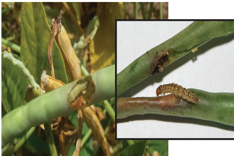
Larvae boring into a cowpea pod.

Among the cowpea pod borers, Maruca vitrata is the most widespread. It is a pre- and post-flowering pest and feeds on every part of the plant. The adult is a nocturnal moth, light brown with whitish markings on its forewings, and lays eggs on the plant. The larvae that emerge damage plants in the field, particularly during the reproductive stage, through feeding on the tender parts of the stems, peduncles, flower buds, flowers, pods, and seeds. The holes bored on the buds, flowers, or pods by feeding are the damage symptom. Infested pods and flowers are webbed together. This pest can cause a significant grain yield reduction of between 20 and 80% if not controlled with insecticides. Complete crop failure may occur, especially in situations where management strategies are not applied. No good sources of resistance have been found within the cowpea genotypes. See Table 7 for a list of chemical insecticides to control this pest.