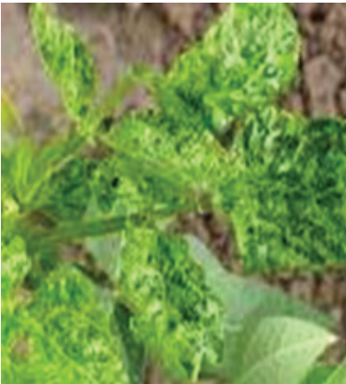
Cowpea yellow mosaic virus.

Cowpea is severely affected by a range of virus diseases causing significant yield and economic losses owing to reduced grain production, poor quality seeds, and costs incurred in phytosanitation and disease control. The majority of the viruses infecting cowpea are vectored by insects (mainly aphids, beetles, and whiteflies), and some are seed-transmitted. Most of the virus infections result in foliar symptoms such as mosaic and mottling, thickening/brittleness of older leaves, wrinkling, leaf distortion, a severe reduction in leaf size, and stunting of plants resulting in yield losses ranging from 10 to 100%. Mixed infections with more than one virus are common under field conditions. Seven viruses are recognized to infect cowpea in Nigeria. Three are beetle-transmitted [ Cowpea yellow mosaic virus (CPMV), genus Comovirus ; Cowpea mottle virus (CMeV), and Southern bean mosaic virus (SBMV)]; two are aphid-borne [ Cowpea aphid-borne mosaic virus (CABMV), genus Potyvirus , and Cucumber mosaic virus (CMV), genus Cucumovirus ]; two are whitefly-transmitted [ Cowpea golden mosaic virus (CPGMV), genus Bigeminivirus , Cowpea mild mottle virus (CPMMV), genus Carlavirus ]. The best way to control virus disease is to grow a resistant variety or control the vectors where applicable with insecticides. Rogue out plants with symptoms during active growth.