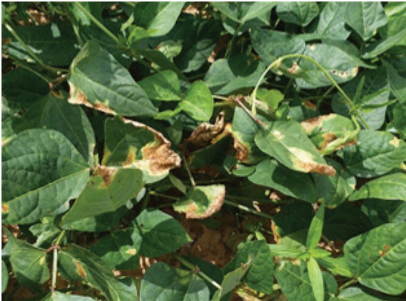
Cowpea leaves infected with Bacterial blight.

Bacterial blight of cowpea (CoBB), caused by the bacterium Xanthomonas axonopodis pv. vignicola , is an important disease of cowpea, causing severe losses in grain yield of more than 64-100% in some areas of Nigeria. The symptoms of CoBB appear as tiny, water-soaked, translucent spots, which are more clearly visible from the abaxial surface of the leaves. The spots enlarge, coalesce, and develop into big necrotic spots, usually with a yellow halo, and lead to premature leaf drop. The pathogen also invades the stem causing cracking with brown stripes. Pod infection appears as dark green water-soaked areas, from where the pathogen enters the seeds and causes discoloration and shriveling. CoBB is seed-borne, and the pathogen can be spread by wind-driven rain and insects. Different strategies are used to control the disease, including cultural practices, intercropping, and the application of chemicals. Cultivation of resistant cowpea varieties is the most promising strategy to control the disease.