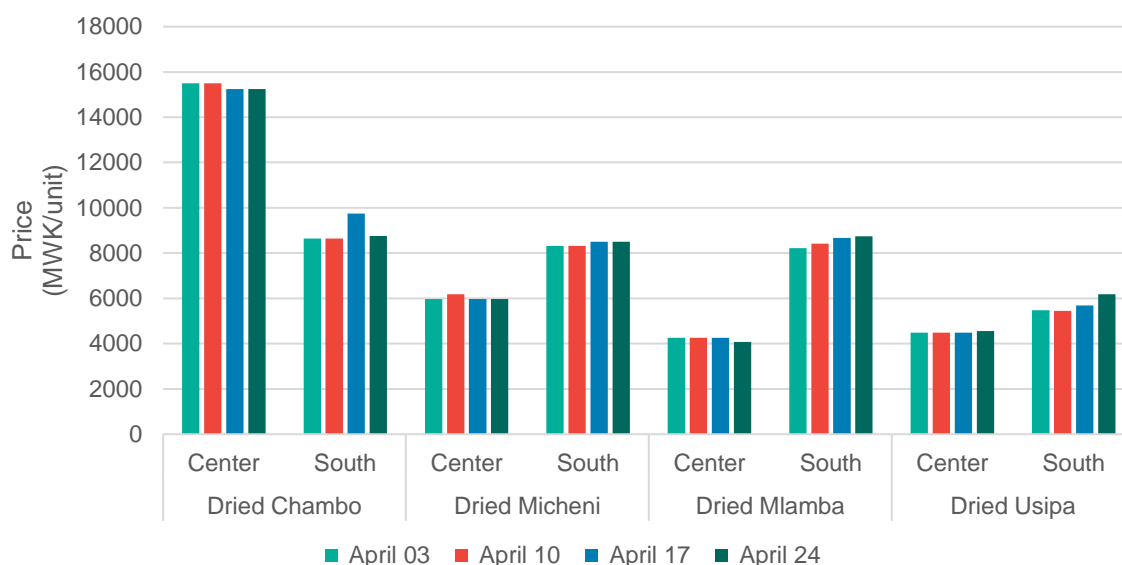
Table 4. Retail prices of dried Chambo and dried Micheni (MWK/unit) during April 2021