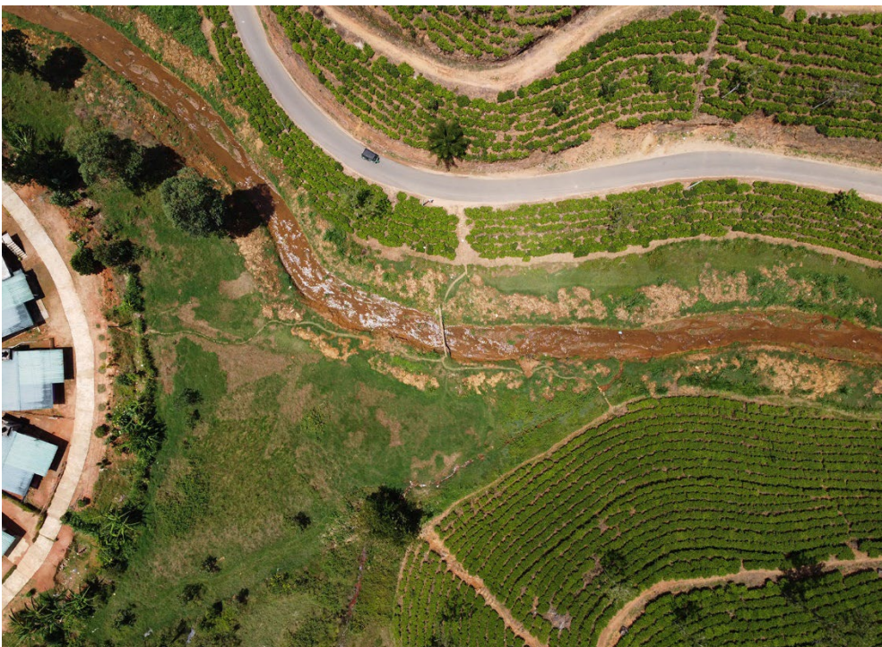
Figure 7: Part of the canal before and after restored sections are now better equipped to handle flood situation.