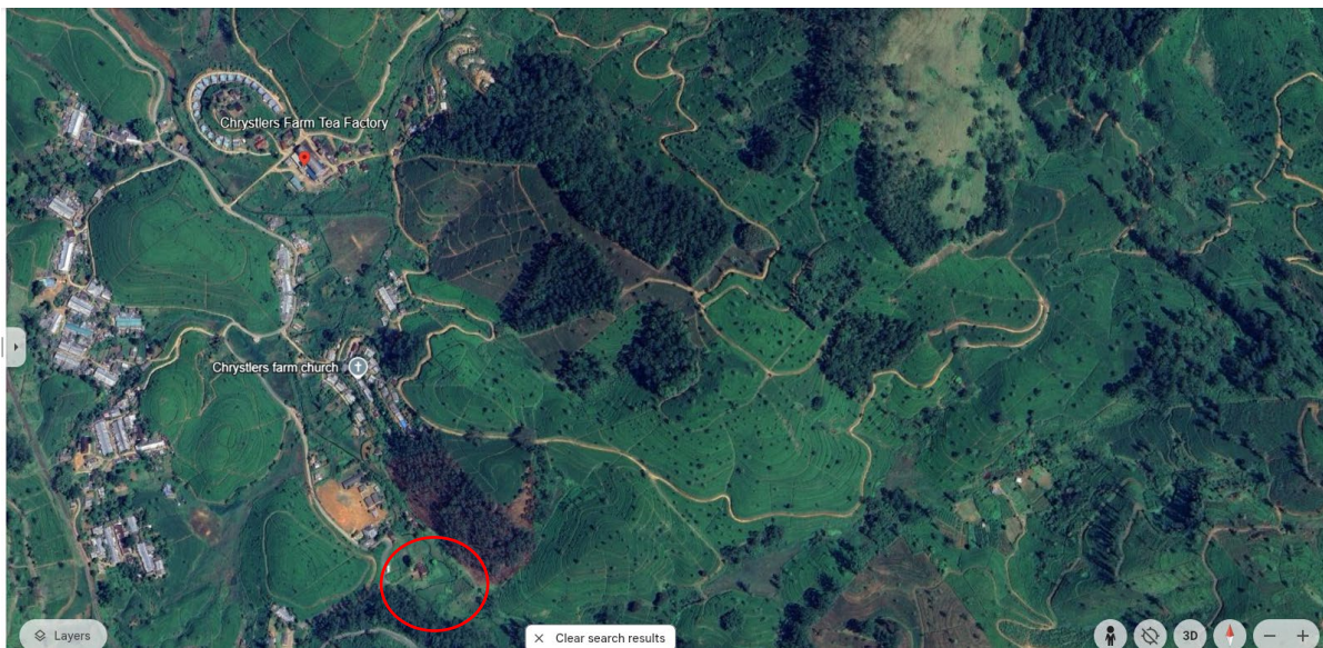
Figure 6: Future Proposal for the Restoration ( marked in red)

They pointed out that other canals in the area require restoration due to flooding, which affects houses and toilets in various locations. Discussions with the local communities highlighted ongoing challenges in specific areas that still need to be addressed to ensure effective climate adaptation across the locality. The community has learned valuable lessons and recognized the importance of canal restoration from the project initiatives. For example, they emphasized the need to restore the beginning of the canal. The tea estate management is currently exploring additional funding sources to implement restoration efforts in these areas. Figure 06 illustrates the future proposal for the restoration.