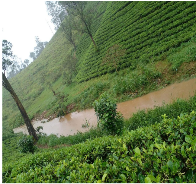
Figure 8: The Chrysler's Farm Tea Estate community did not face any flooding events in November 2024