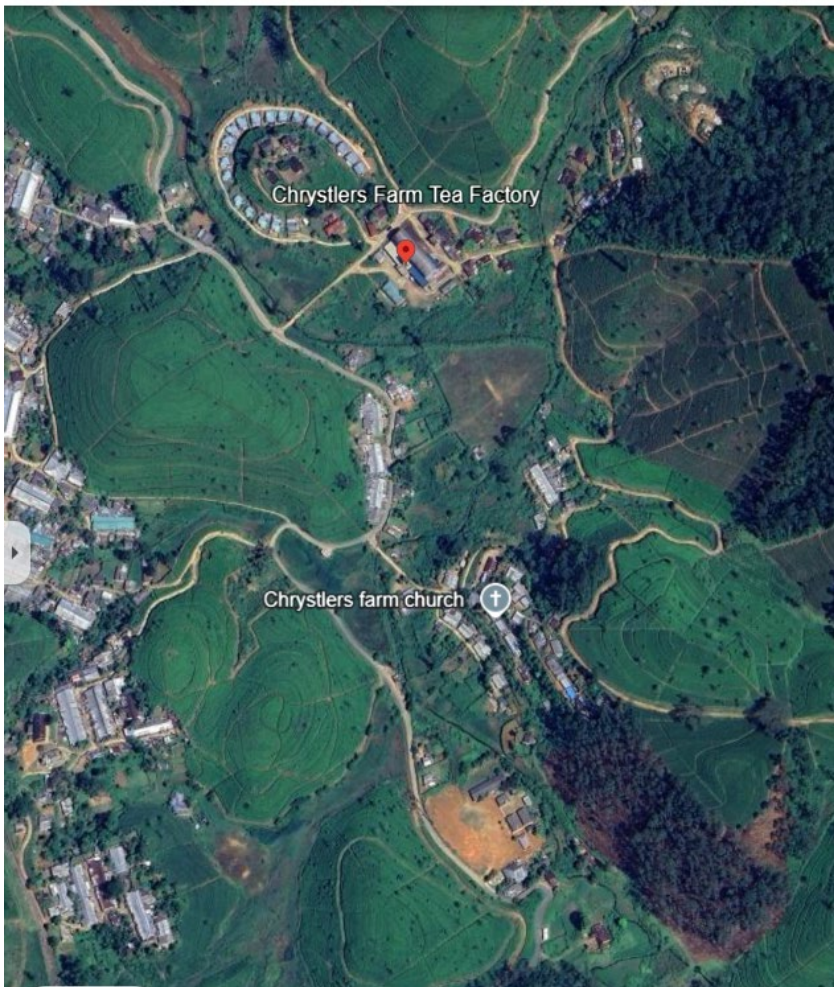
Figure 2: Canal running through the Chrystler's Farm Tea Estate

Recent flooding in Kotagala, particularly in areas such as Chrystler's Farm, has caused widespread damage and disruption. The Chrystler's Farm Tea Estate, located in this flood-prone region, is particularly vulnerable due to a 2-kilometer-long canal that runs through the estate. This canal, critical for drainage, has become a recurring source of flooding, affecting approximately 25 of the 50 families settled along its banks. The floods not only disrupt daily life—impacting residents, schools, and essential services—but also severely affect the operations of the tea estate, a key livelihood source for the community. Flooding typically occurs twice a year, with the most severe events concentrated during the May-July and October-December periods, leaving the community in a cycle of recovery and vulnerability.