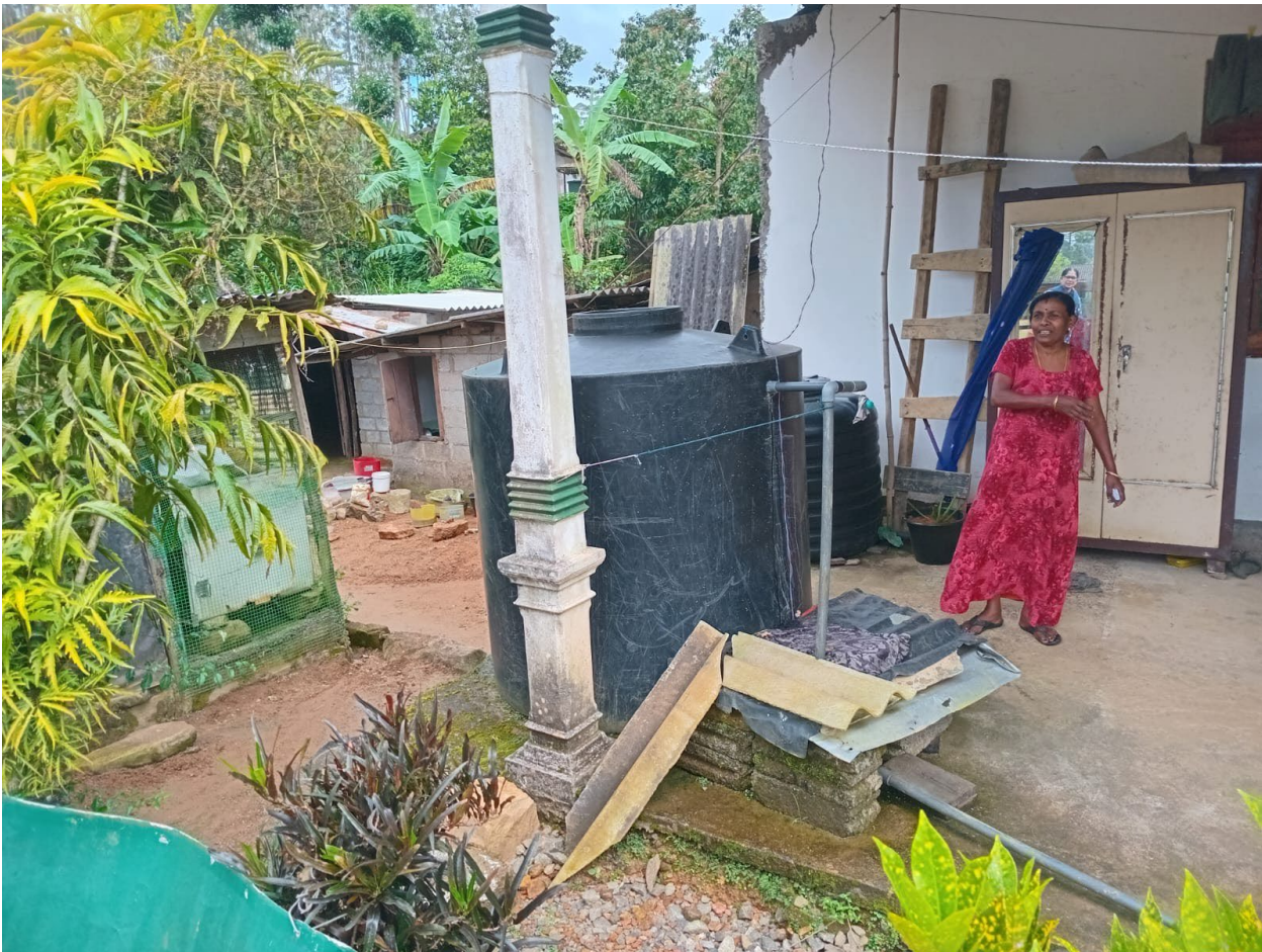
Figure 5: Relocation of some houses from flood-prone areas and the upgrading of their conditions

Figure 05 illustrates the relocation of some houses from flood-prone areas and the upgrading of their conditions, highlighting one of the families that has elevated the foundation of their house.