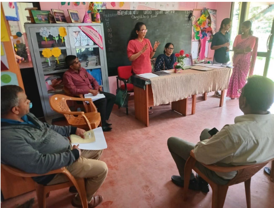
Figure 4: Focus group discussions were held at Chrysler's Farm Tea Estate with the local communities