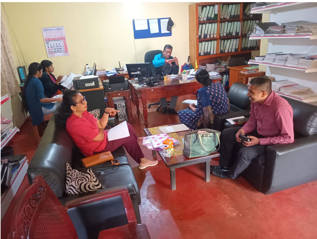
Figure 3: Questionnaire survey conducted at Chrystler's Farm Tea Estate

Our commitment to ensuring the equitable distribution of benefits was a key focus, with particular attention given to whether all community members—irrespective of gender, social status, or other factors—were able to benefit from the initiative. Efforts to address gender inequality and promote social inclusion were carefully examined, highlighting the importance of creating opportunities for all groups within the community. Additionally, the interviews assessed the community's capacity to manage future climate risks, emphasizing the sustainability of the implemented climate adaptation measures over the long term. A total of 32 individuals participated in the questionnaire survey, including 24 local community members, four estate management and welfare division representatives, five school teachers, and four local government officers, ensuring a diverse range of perspectives were captured. The verbal consent form was administered prior to participants completing the survey questionnaire.