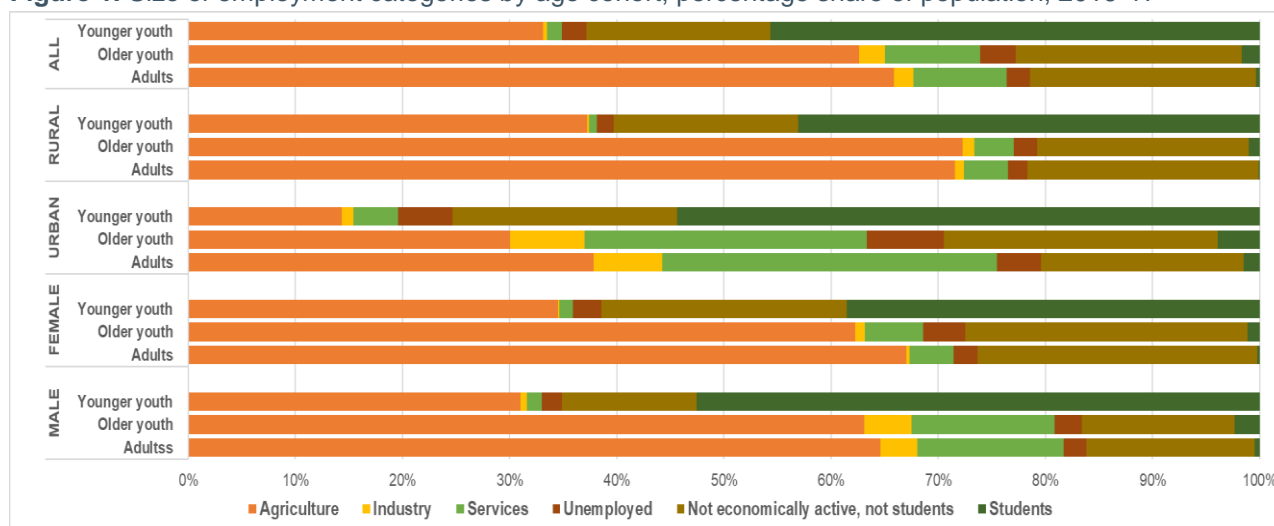
Figure 1. Size of employment categories by age cohort, percentage share of population, 2016-17