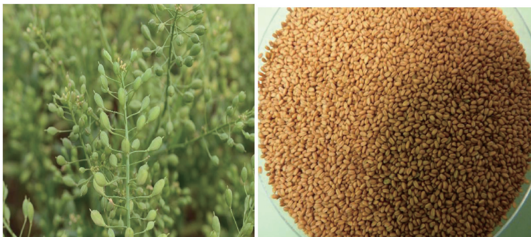
Fig. 2 Camelina plant and seed 61) .

need for fertilizers and pesticides. As a hardy, drought-resistant crop, Camelina requires minimal inputs compared to traditional oilseed crops, which often rely heavily on chemical fertilizers and pest control 22) . Its ability to thrive in nutrient-poor soils means that farmers can cultivate Camelina without the environmental burden associated with synthetic fertilizers, thus minimizing soil degradation and reducing greenhouse gas emissions associated with fertilizer production and application. Furthermore, Camelina's natural resistance to pests can lower the reliance on chemical pesticides, promoting a healthier ecosystem and reducing potential harm to beneficial organisms in the soil 22, 23) .