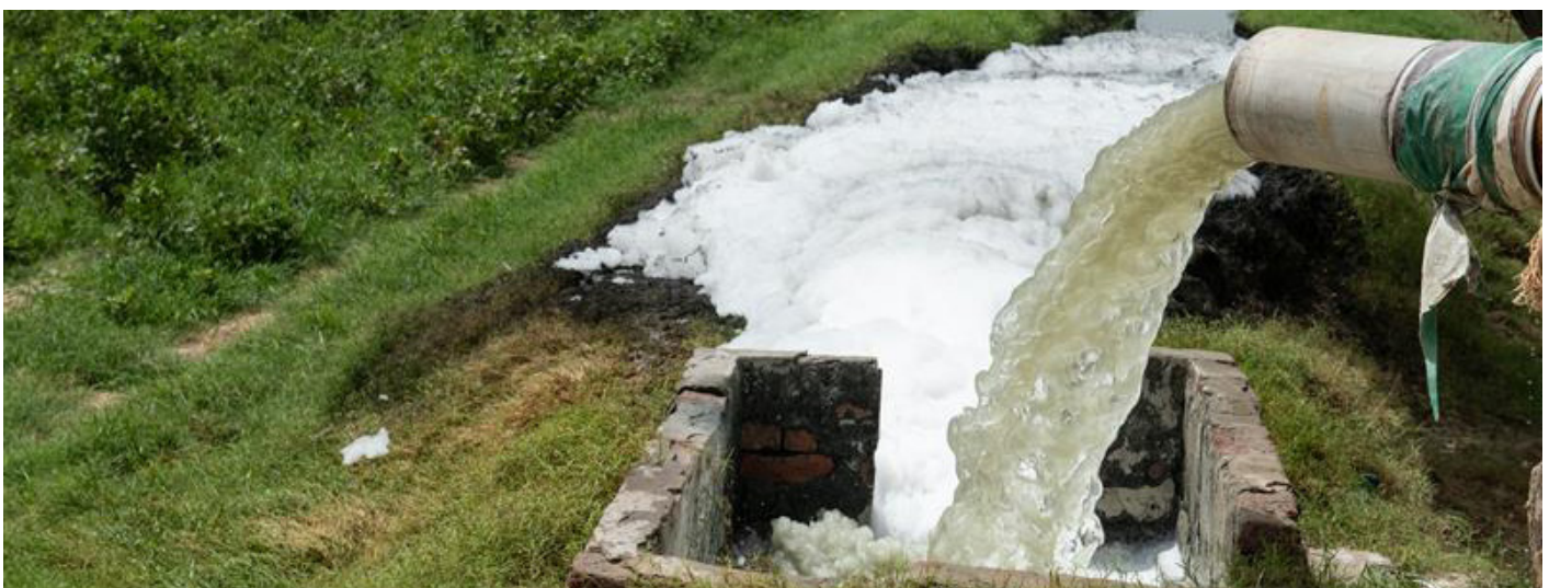
Wastewater being channelled for crop irrigation in parts of Punjab Province, Pakistan.

Finally, water management and sustainable development must go beyond wastewater treatment and use to address the multidimensional water security issues Pakistan is facing as the country strives to achieve the water-related United Nations Sustainable Development Goals by 2030 (Ishaque et al. 2024).