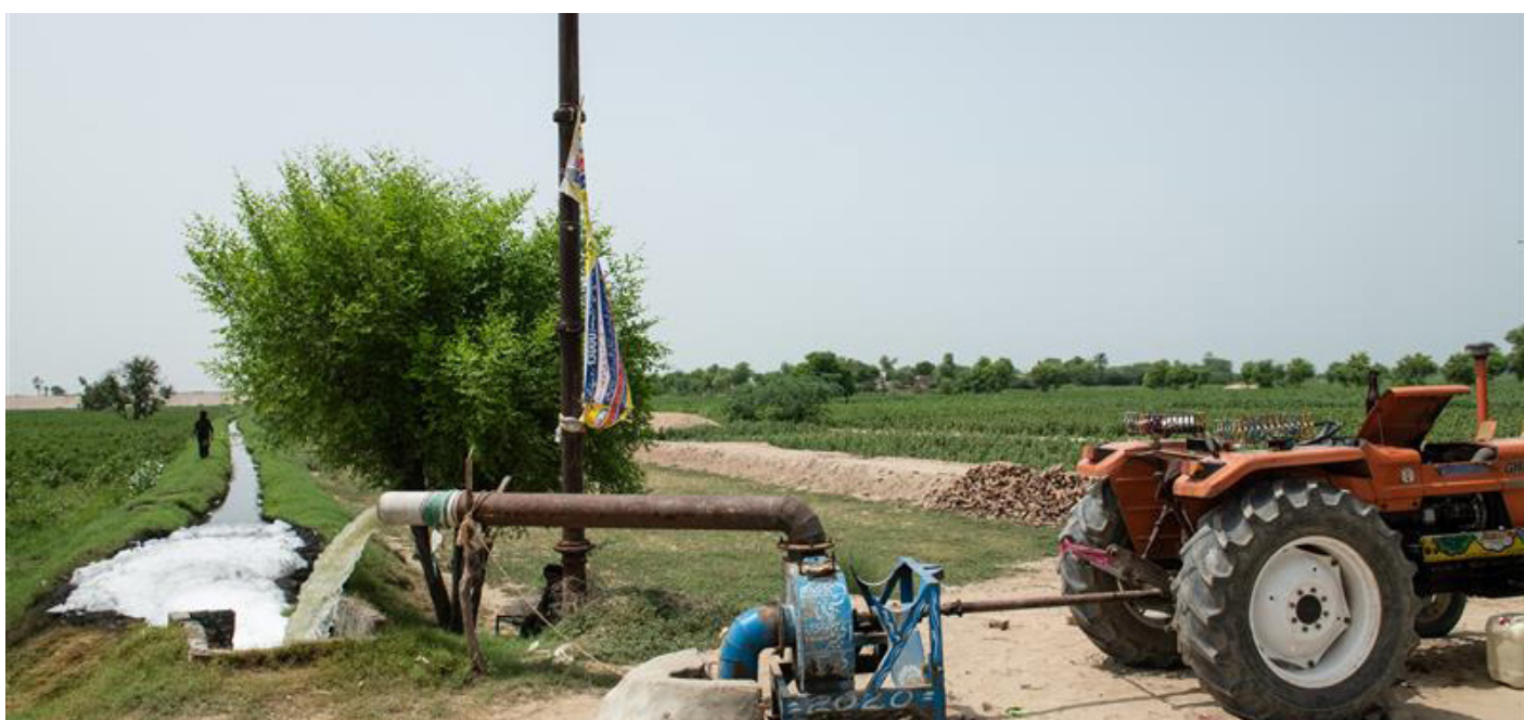
Many farmers in parts of Punjab Province, Pakistan use wastewater for agriculture.

Only papers presenting interesting or unique approaches for follow-up research have been referenced in this brief; for other works, readers are encouraged to see the published reviews.