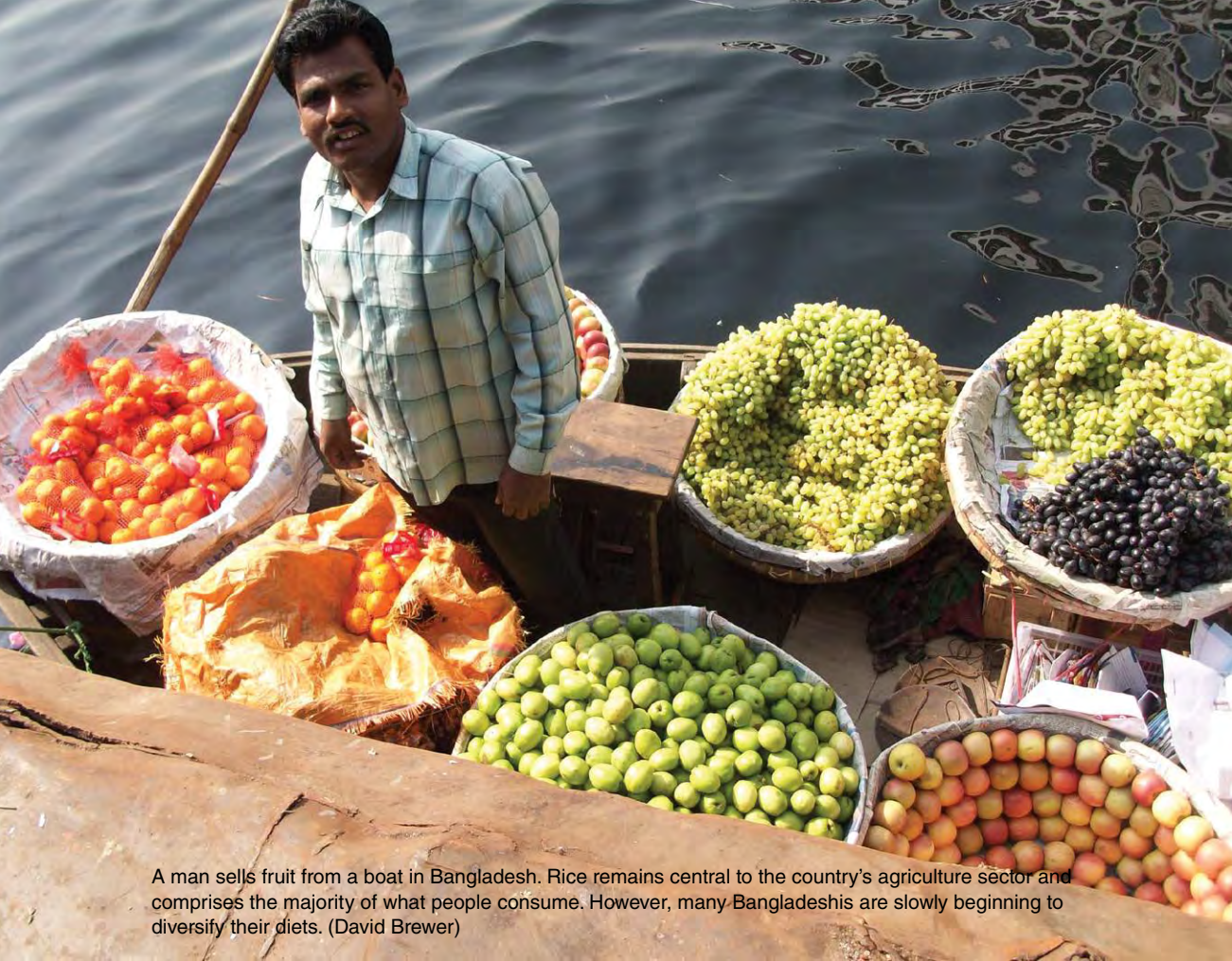
A man sells fruit from a boat in Bangladesh. Rice remains central to the country's agriculture sector and comprises the majority of what people consume. However, many Bangladeshis are slowly beginning to diversify their diets. (David Brewer)