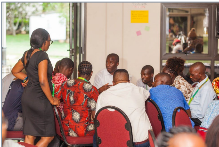
Figure 17: Group in breakout discussion

By working alongside these key stakeholders, the UU project in Malawi aims to empower Malawian farmers with sustainable and productive cropping practices, leading to a more resilient and food-secure future.