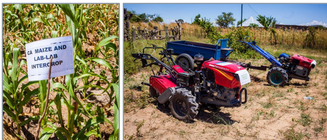
Figure 14: a) Farm with CA practices e.g., mulching, maize-lablab intercrop and b) small-scale machinery.