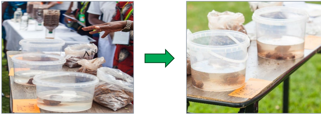
Figure 7 Water infiltration A: Before

The experiment investigated water infiltration, particularly focusing on the vertical movement of water (percolation) through the soil profile to replenish aquifers accessible to plant roots. Conventional tillage practices are observed to induce soil compaction, resulting in impeded infiltration due to degradation of soil structure. This negative impact manifests as a surface seal, rendering the soil highly susceptible to erosion. Conversely, both undisturbed (virgin) and conservation agriculture (CA) soils promote water percolation, facilitating efficient drainage and downward water movement (Figure 7).