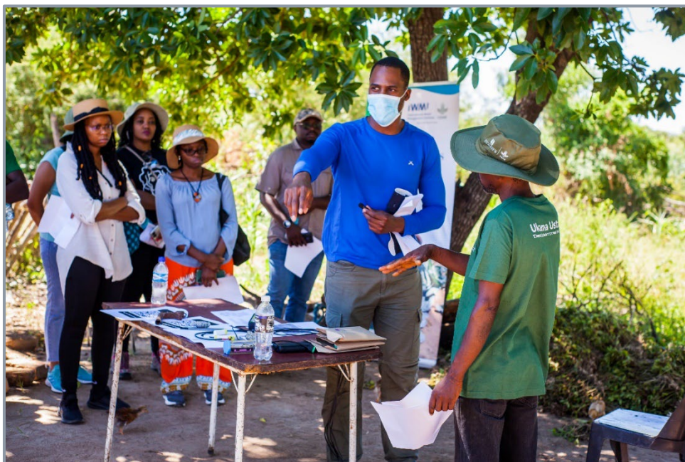
Figure 13: IWMI researcher demonstrating and explaining Chameleon sensors to the participants.