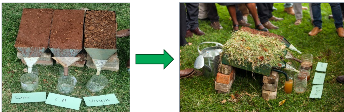
Figure 18 Run-off Trial

This investigation examines the susceptibility of three soil types to surface runoff: virgin soil, conventionally tilled soil, and soil under a CA regime. Two experiments were conducted. The first evaluated bare soil from each treatment, assessing the impact of rain on runoff and erosion. The second experiment employed a mulching treatment on all three soil types (Figure 8). The experiments are considered complementary. The first isolates the effects of raindrop impact on bare soil, influencing surface runoff and erosion. Observations from the first experiment revealed that runoff from virgin soil displayed minimal turbidity, whereas runoff from conventionally tilled soil exhibited high sediment load. Runoff from CA soil displayed a moderate level of turbidity. The second experiment, incorporating mulch across all treatments, demonstrated a further reduction in turbidity of runoff from virgin soil. This finding highlights the effectiveness of mulch in mitigating soil erosion by attenuating the impact of raindrops on loose soil surfaces. Collectively, these experiments illustrate the efficacy of CA practices, such as mulching, in minimizing soil erosion.