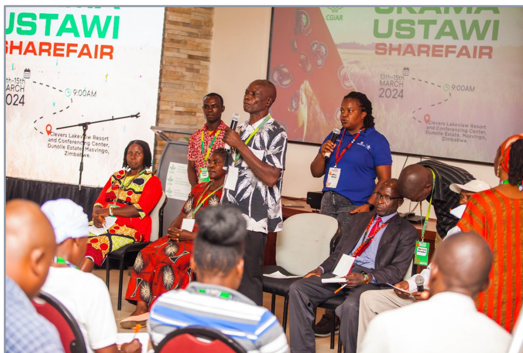
Figure 16: Farmers on the panel, flanked by their translators

To open the session, a video set the scene about the three principles of CA. This video was intentionally simple to translate the concepts across different languages and without requiring translation (infographics). This was followed by a farmer panel discussion (Figure 4) on how climate change affects farmers and impacts activities, and what has changed since UU started working with farmers: