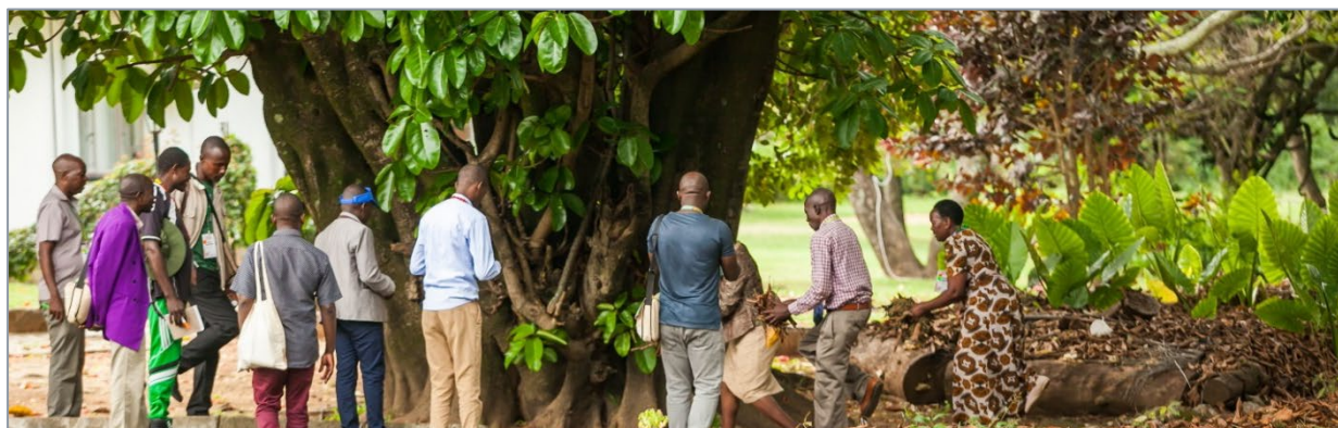
Figure 22: Film crew enacting CA practices

As a highlight of the workshop, participants were invited to showcase their creativity. Divided into six teams, they were tasked with identifying a key CA activity and developing a short video (Figure 12) that depicted its implementation through role-play. Competition ensued, with the most innovative video presentation receiving recognition for its creativity. This resulted in fun and informative videos. Some teams opted for engaging narratives, while others chose a news-style format. Still others crafted compelling video demonstrations that effectively portrayed a problem, the corresponding CA solution, and the subsequent positive impact.