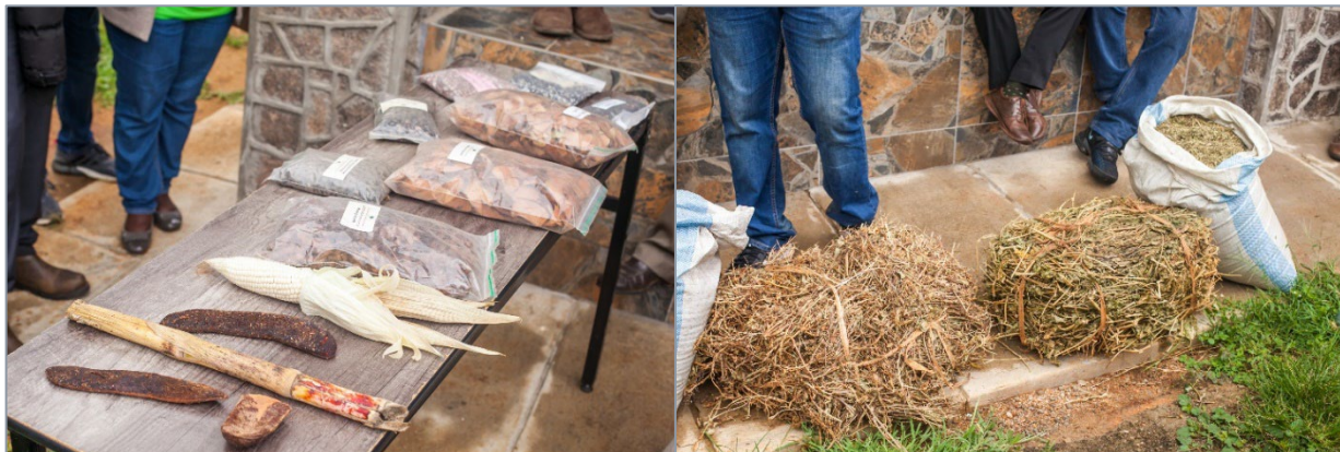
Figure 21: Livestock Feed Exhibit

This session, facilitated by Thembinkosi Baleni (ILRI) and Godfrey Manyawu (ILRI) addressed the critical challenge of ensuring livestock feed security during drought periods for smallholder farmers. The exhibition (Figure 11) focused on showcasing the benefits of incorporating CSA intercrops, such as lablab, into existing farming practices. Emphasis was placed on equipping farmers with effective feed preservation techniques for both roughage (forage crops) and concentrate feedstuffs. These techniques will enable farmers to maintain a strategic reserve of high-quality feed, even during dry seasons, thus mitigating the negative impacts of drought on animal health and productivity. The session specifically covered various ensiling methodologies, providing farmers with the knowledge and skills required to preserve the nutritional value and palatability of forages after drying.