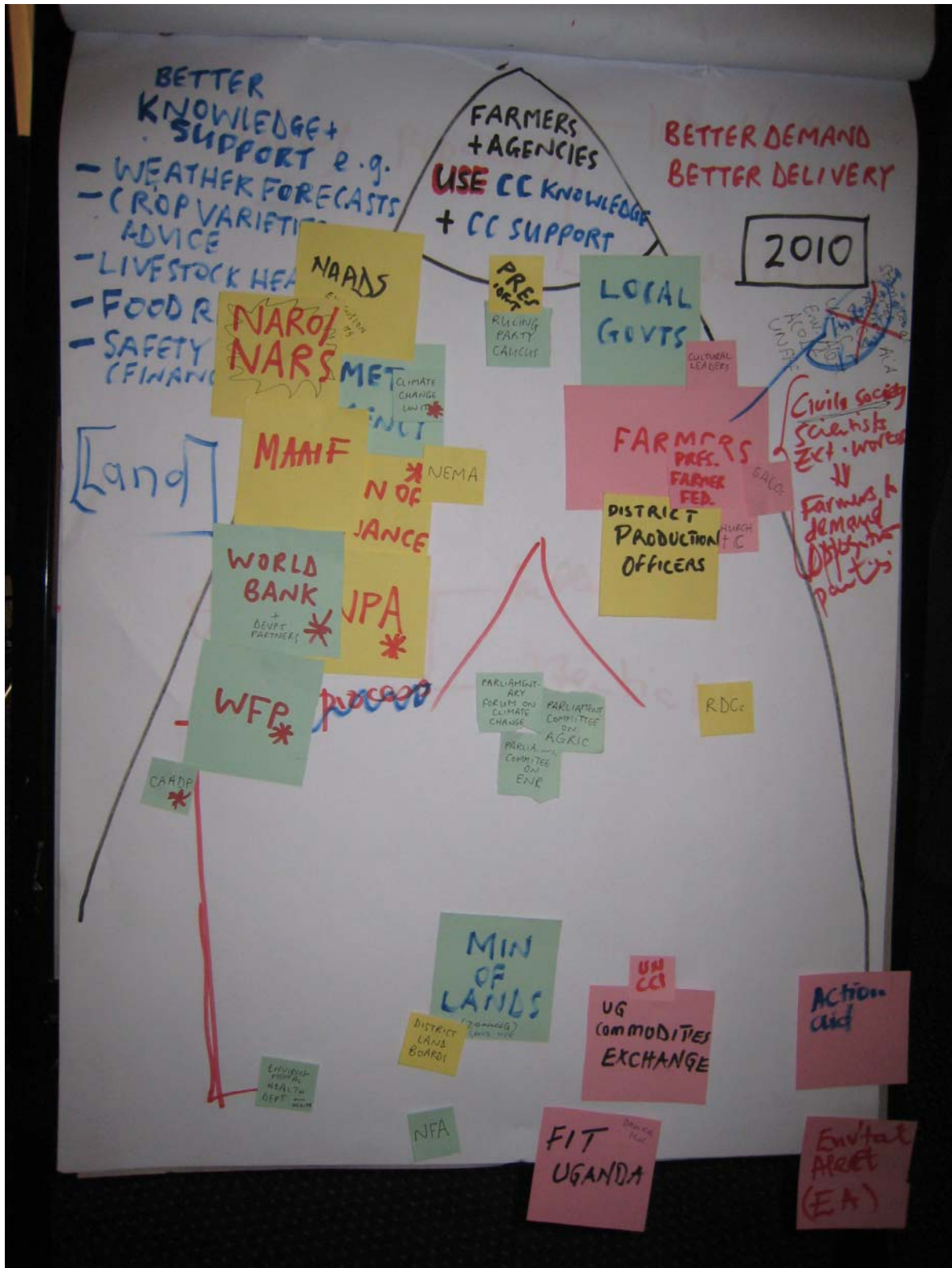
Annex: photo of stakeholder influence mapping