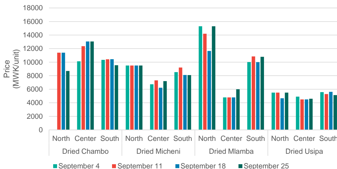
Figure 3. Retail prices of dried Chambo, dried Micheni, dried Mlamba and dried Usipa (MWK/unit), September 2021

Note: Chambo, mlamba and micheni (dried and fresh) are priced per dozen; usipa (dried and fresh) is priced per 5-liter bucket